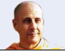
RADHANATH SWAMI MAHARAJ

Understanding and managing stress effectively is essential for a healthier life