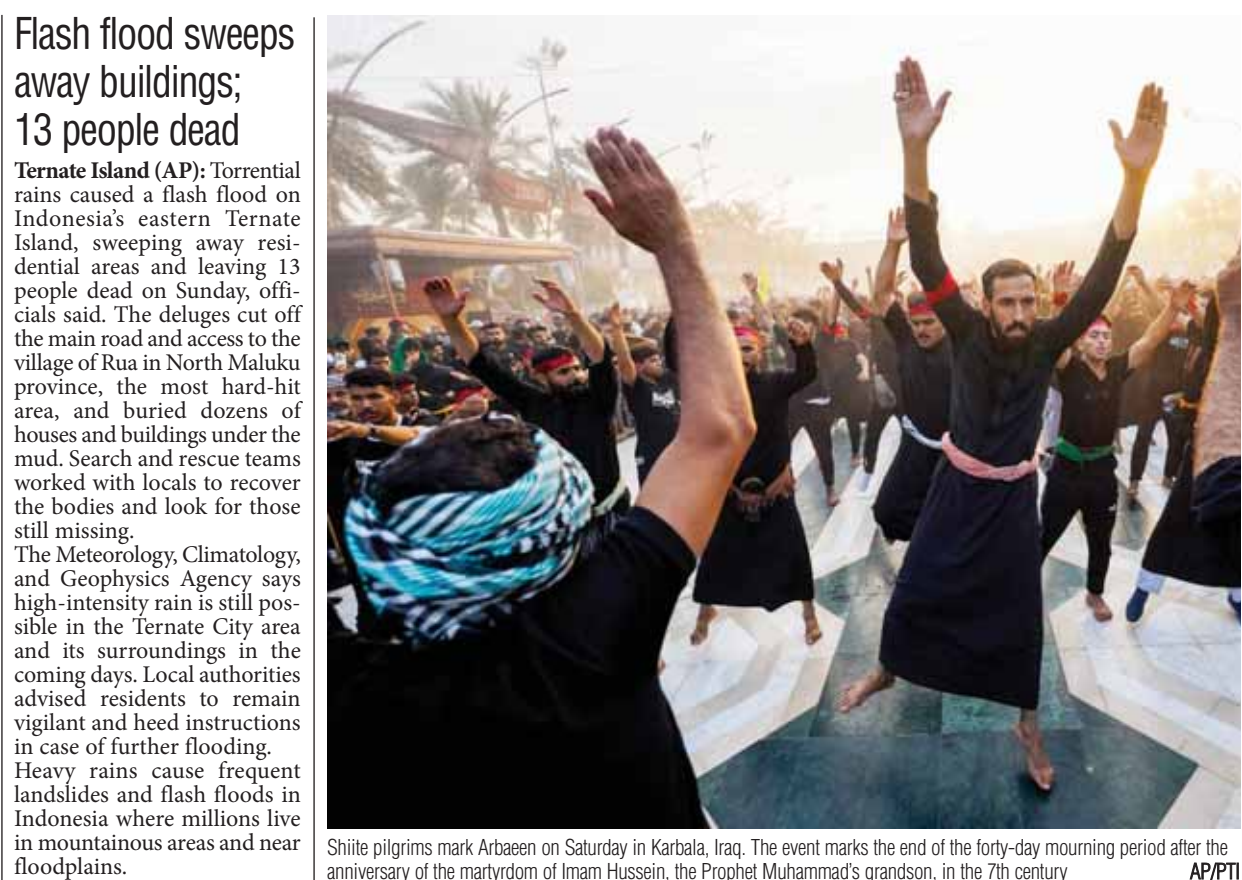
Shiite pilgrims mark Arb'een on Saturday in Karbala, Iraq. The event marks the end of the forty-day mourning period after the anniversary of the martyrdom of Imam Hussein, the Prophet Muhammad's grandson, in the 7th century

Torrential rains caused a flash flood on Indonesia's eastern Ternate Island, sweeping away residential areas and leaving 13 people dead on Sunday, officials said. The deluges cut off the main road and access to the village of Rua in North Maluku province, the most hard-hit area, and buried dozens of houses and buildings under the mud. Search and rescue teams worked with locals to recover the bodies and look for those still missing. The Meteorology, Climatology, and Geophysics Agency says high-intensity rain is still possible in the Ternate City area and its surroundings in the coming days. Local authorities advised residents to remain vigilant and heed instructions in case of further flooding. Heavy rains cause frequent landslides and flash floods in Indonesia where millions live in mountainous areas and near floodplains.