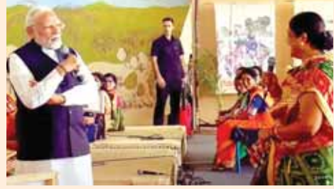
Prime Minister Narendra Modi during an interaction with Lakhpati Didis, in Jalgaon, on Sunday