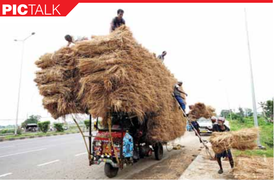
Workers load heaps of straw on an autorickshaw, in Bardhaman.