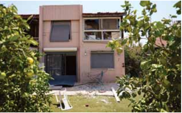
A damaged house is seen following an attack from Lebanon, in Acre, north Israel, on Sunday