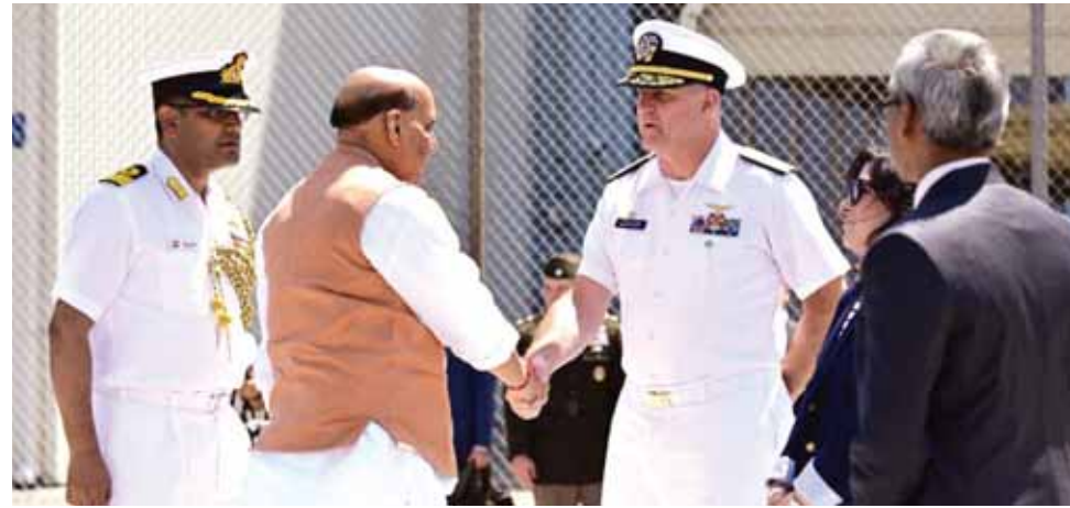
Union Defence Minister Rajnath Singh with others during a visit to the Naval Surface Warfare Centre, in Carderock, Maryland, USA