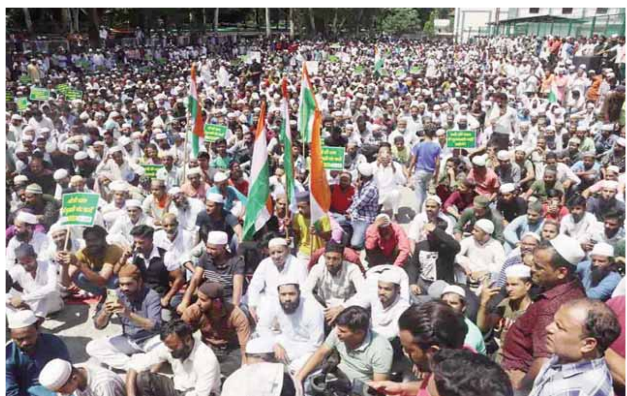
Members of the Muslim community protest near Parade Ground in Dehradun on Sunday against controversial statements allegedly made recently by a public figure in Maharashtra

Besides this, the project will help streamline municipal services for the public. Citizens will be able to check property details, pay taxes, register complaints and modify their details online. These initiatives aim to reduce corruption, ensure fair taxation and prevent encroachment on public lands, they added.