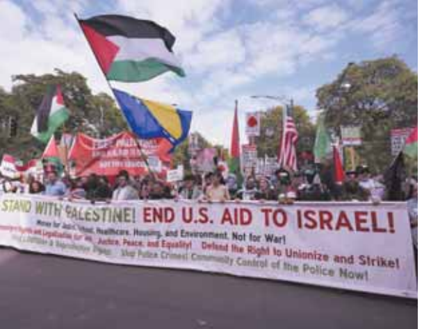
Protesters march to the Democratic National Convention after a rally at Union Park Monday, in Chicago

a blow to Hamas, which hopes to exchange hostages for Palestinian prisoners, an Israeli withdrawal and a lasting cease-fire. But it was also likely to increase pressure on Israel's government to reach a deal to