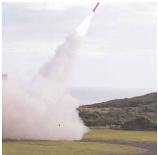
A MIM-104C (PAC-2) Patriot short-range anti-aircraft missile launches from Pingtung County, Southern Taiwan, on Tuesday