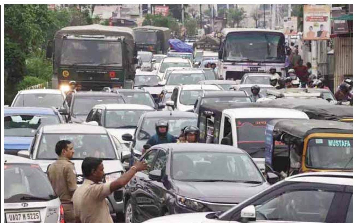
Police personnel man the traffic amidst congestion on Haridwar Road in Dehradun which witnessed traffic snarls on different roads on the occasion of Rakshabandhan on Monday