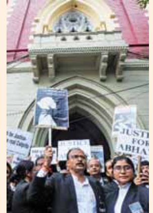
Lawyers of Calcutta High Court stage a protest against alleged sexual assault and murder of a postgraduate trainee doctor, in Kolkata, on Monday