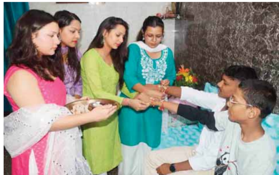
Sisters tie rakhis on the wrists of their brothers on Rakshabandhan in Dehradun.

tant of seeking guidance from a priest rather than relying on social media for information about the festival's traditions. Apart from this, a large number of people were also