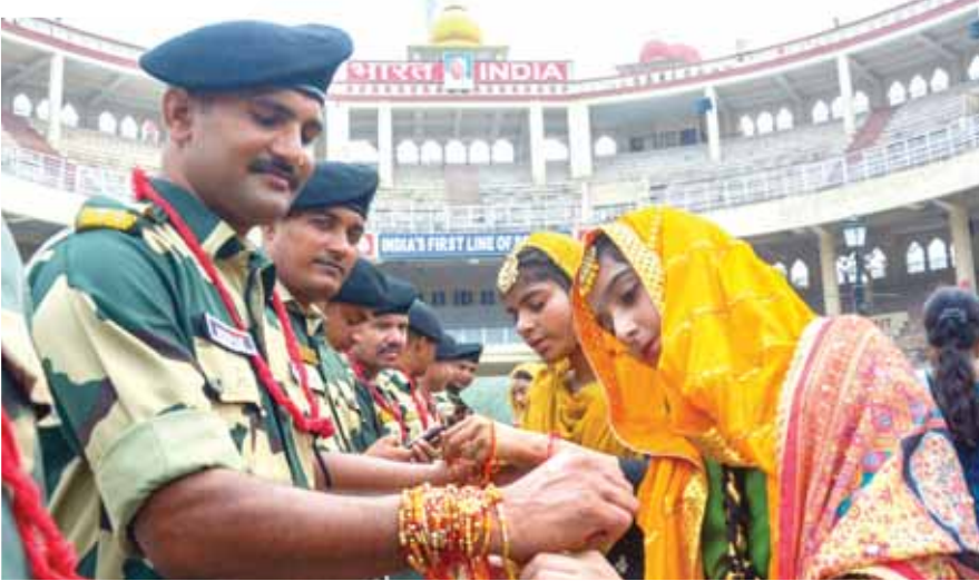
Women tie 'rakhi' on wrists of BSF personnel on the occasion of Rakshabandhan at Attari-Wagah Border, Amritsar