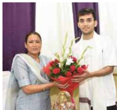
Paris Olympics men's singles badminton event.

achievement in reaching the bronze medal match in the