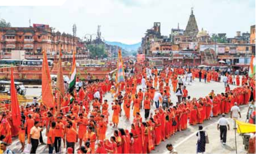
Women devotees carry holy water in the 'Kalash Yatra' in Jaipur