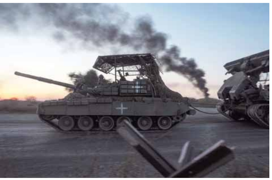
Ukrainian servicemen ride atop on a tank after returning from Russia near the Russian-Ukrainian border in Sumy region, Ukraine, on Saturday, August 17, 2024

country since World War II, sapped by a failed counteroffensive last summer and months of grinding Russian gains in the eastern Donbas region, and proven its ability to seize initiative. It has resembled Ukraine's lightning operation from September 2022, led by Syrskiy, in which its forces reclaimed control of the northeastern Kharkiv region after taking advantage of Russian manpower shortages and a lack of field fortifications. Zelenskyy seeks permission to strike deeper into Russia. Ukrainian President Volodymyr Zelenskyy late on Saturday urged Kyiv's allies to lift the remaining restrictions on using Western weapons to strike targets deeper in Russia, including in Kursk, saying that his troops could deprive Moscow "of any ability to advance and cause destruction" if granted sufficient long-range capabilities. "It is crucial that our partners remove barriers that hinder us from weakening Russian positions in the way this war demands. ... The bravery of our soldiers and the resilience of our