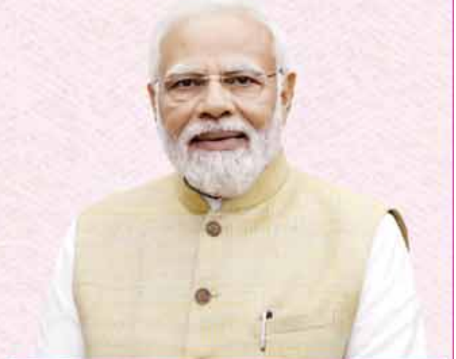
नरेन्द्र मोदी प्रधानमंत्री

देवभूमि की सभी बहनों को रक्षाबंधन के पावन पर्व की हार्दिक शुभकामनाएँ। हमारी सरकार माताओं-बहनों के हित संरक्षण और सशक्तीकरण की दिशा में निरंतर कार्य कर रही है।