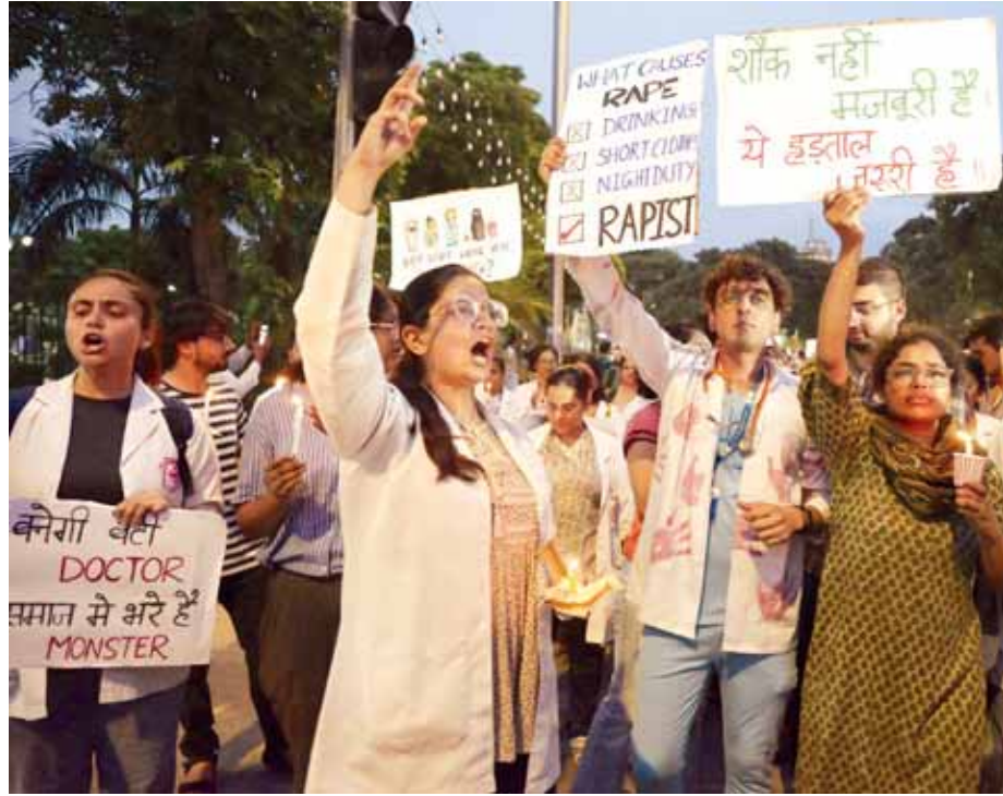
Members of various Resident Doctors' Associations protest during a candle march against the alleged rape and murder of a trainee doctor at Kolkata's RG Kar Medical College and Hospital, at Connaught Place, in New Delhi, on Sunday