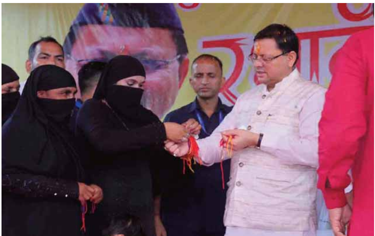
A woman ties a rakhi on chief minister Pushkar Singh Dhami's wrist on the eve of Rakshabandhan at a programme in Banbasa on Sunday. A large number of local women tied rakhis on the CM's wrist on the occasion

Armani, Marc Jacobs, Maui Jim, Michael Kors, Jimmy Choo, Prada, Salvatore Ferragamo, Tom Ford, Gucci, Versace, Calvin Klein,