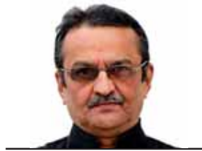
B K JHA

The recent barbaric act of violence, rape, and murder against a resident lady doctor in Kolkata has sent shockwaves across the nation. This incident, coupled with the growing number of attacks on medical professionals, calls for an urgent need for a safe operating environment for those who dedicate their lives to saving others.