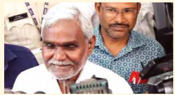
Former Jharkhand Chief Minister Champai Soren speaks with the media upon his arrival at Delhi airport on Sunday

reluctance to perform night shifts at the hospital. "Clearly, she was under pressure for some reason or was privy to something she should not have known," one family member speculated, questioning why the victim would tear out 4-5 pages from her personal diary. On Sunday, the CBI summoned several security staff members and a subaltern police officer for questioning. However, investigators have yet to determine why hospital authorities delayed informing the police by two hours after discovering the body or why students and staff were instructed not to go to the third floor, where the seminar room — and the victim's body — was found early on the morning of August 9. The officials also have asked the former principal of the college as to why the common wall between the bathroom and the seminar hall was pulled down after the incident and why the washbasins and such other things were replaced in a hurry.