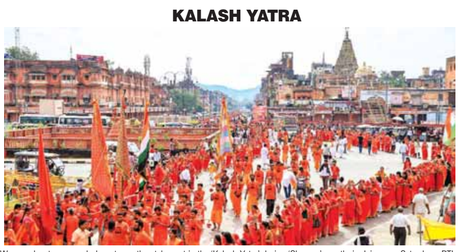
Women devotees carry holy water as they take part in the 'Kalash Yatra' during 'Shravan' month, in Jaipur, on Saturday

rather than underlying acts, and requires an analysis of the elements of each crime. The panel of three judges concluded that a co-conspirator's plea agreement did not compel a different result. The panel held that the Non Bis in Idem exception did not apply because the Indian charges contained distinct elements from the crimes for which Rana was acquitted in the United States. In its ruling, the panel also held that India provided sufficient competent evidence to support the magistrate judge's finding of probable cause that Rana committed the charged crimes. The three panel of judges were Milan D Smith, Bridget S Bade, and Sidney A Fitzwater. Rana, a Pakistani national, was tried in a US district court on charges related to his support for a terrorist organisation that carried out large-scale terrorist attacks in Mumbai. A jury convicted Rana of providing material support to a foreign terrorist organisation and conspiring to provide material support to a foiled plot to carry out terrorist attacks in Denmark. However, the jury acquitted Rana of conspiring to provide material support to terrorism-related to the attacks in India.