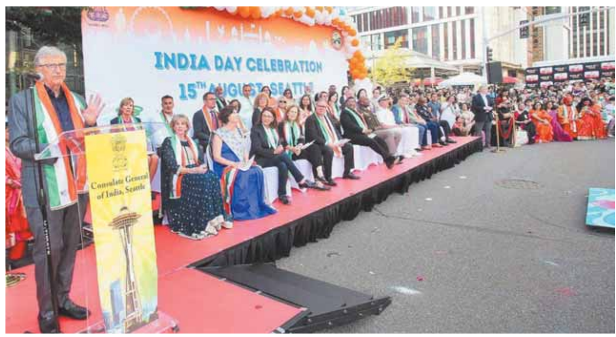
American businessman and Microsoft founder Bill Gates during flagging off the First India Day celebrations, in Greater Seattle area, USA.