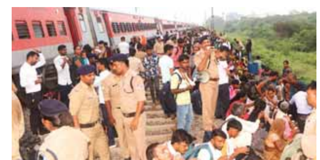
Police personnel during a rescue operation after coaches of the Sabarmati Express passenger train derailed between Kanpur and Bhimsen stations in Uttar Pradesh, on Saturday