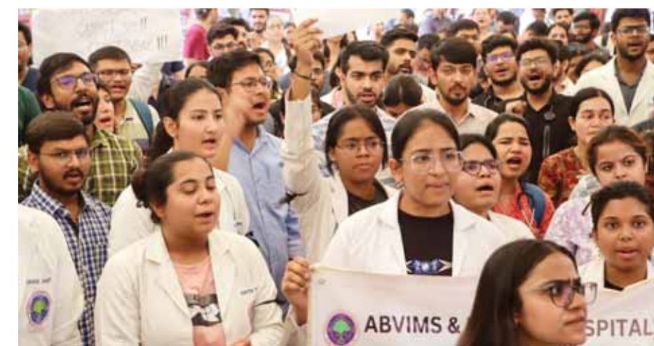
Doctors and staff of RML Hospital stage a protest demanding justice for the woman doctor who was allegedly raped and murdered at Kolkata's R G Kar Medical College and Hospital, in New Delhi, on Saturday