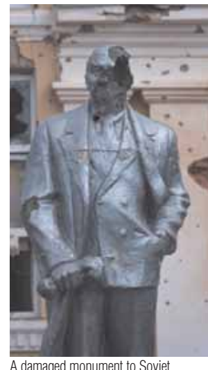
A damaged monument to Soviet founder Vladimir Lenin stands in a central square in Sudzha, Kursk region.