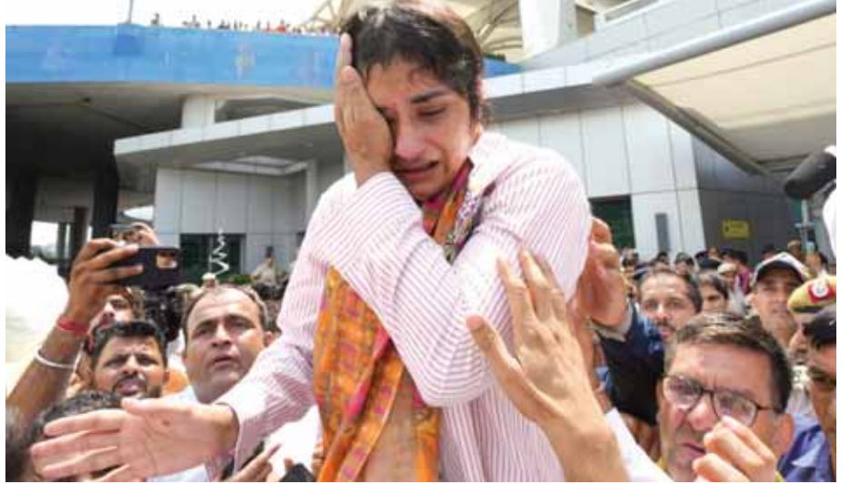
Wrestler Vinesh Phogat gets emotional as she arrives after Paris Olympics heartbreak, at IGI airport, in New Delhi, on Saturday