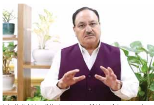
Union Health Minister JP Nadda speaks on the RG Medical College rape and murder incident, in New Delhi, on Tuesday

demonstration on or around the hospital campus stating it was in violation of High Court directions and amounts to contempt of court. The administration issued an office memorandum drawing the attention of all resident doctors to the "Code of Conduct" as laid down by the High Court. It further stated that the violation of the High Court orders by the individual/students/employees/students/Resident Doctors/Associations/Unions etc will be in contravention of the directions of High Court and make them liable for disciplinary actions and also for contempt of court.