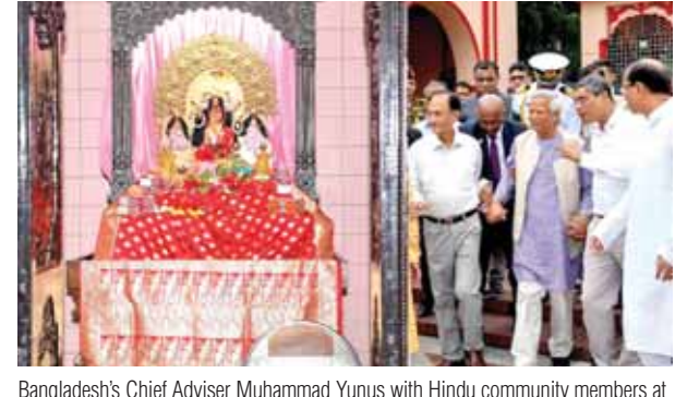
Bangladesh's Chief Adviser Muhammad Yunus with Hindu community members at the famous Dhakeshwari Temple in Dhaka, on Tuesday

Reaching out to the distressed Hindu community members at the famous Dhakeshwari Temple here, Bangladesh's Chief Adviser Muhammad Yunus on Tuesday urged the people to "exercise patience" before judging his Government's role. Yunus, who took charge as the Chief Advisor of the interim Government on August 8 amid ongoing violence and vandalism, including against the minorities, also said each one's rights should be ensured and blamed "institutional decay" for the predicament that his country