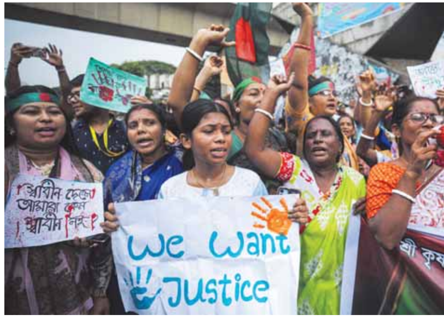
Hindus in Bangladesh hold a rally condemning violence against them and other religious groups in Dhaka, Bangladesh, on Monday.

Israeli strikes in Gaza killed at least 16 Palestinians, including four women and seven children, and orphaned another four children, Palestinian medical officials said Tuesday. Ten people were killed in a strike late Monday on a house near the southern city of Khan Younis, where Israel ordered mass evacuations in recent days, saying it must act against Palestinian militants. Nasser Hospital, where the bodies were brought, said another four children, including a 3-month-old infant, were wounded. The infant's parents and their other five children were among those killed. The parents of the other three wounded children were also killed, according to the hospital's list of casualties. An Associated Press journalist counted the bodies. A separate strike near Deir al-Balah in central Gaza killed a woman and her twin babies, who were four days old, and their grandmother. Another strike in central Gaza killed a man and his nephew. An Associated Press reporter counted the bodies at the nearby Al-Aqsa Martyrs Hospital and spoke to the father of the twins, who had planned to register their birth on Tuesday. Israel says it tries to avoid harming civilians and blames their deaths on Hamas because its fighters operate in residential areas. The military rarely comments on individual strikes, which often kill women and children.