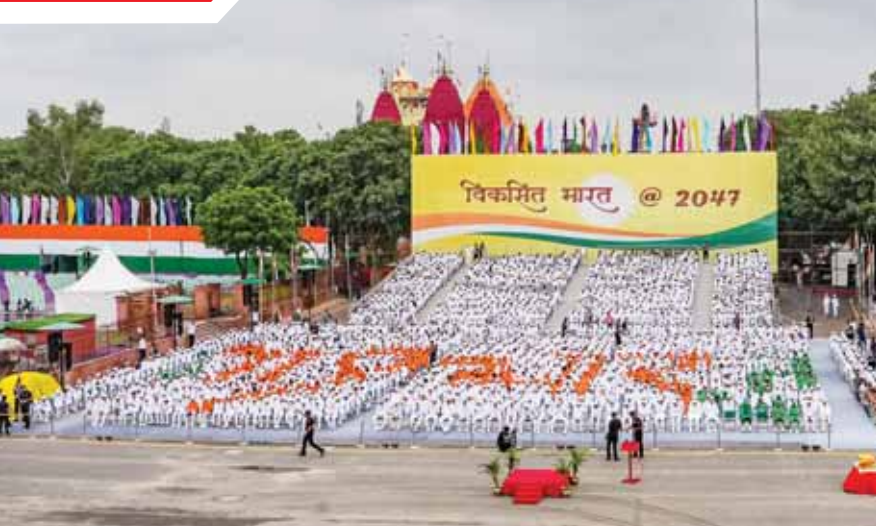
NCC cadets during full dress rehearsal for the 78th Independence Day celebrations at Red Fort, in New Delhi