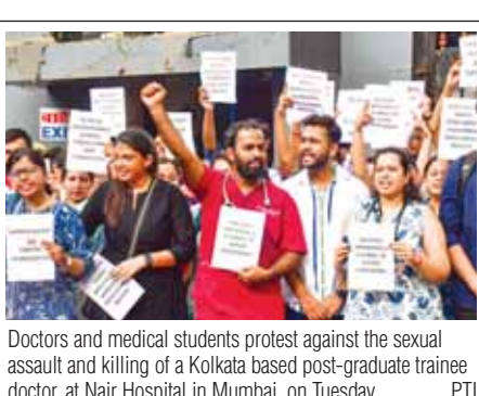
Doctors and medical students protest against the sexual assault and killing of a Kolkata based post-graduate trainee doctor, at Nair Hospital in Mumbai, on Tuesday