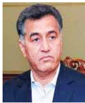
(Hameed's) political meddling will also be proved." Siddique quoted PTI founder Khan as saying that Hameed had supported his party inside Parliament by getting legislation passed and meeting the required number of members in the National Assembly. He said Hameed also remained involved in the general elections by backing the PTI. The senator said the former ISI chief had controlled the media and politicians and tried to control the judiciary as well.

actions were "internal", former premier Khan's Pakistan Tehreek-e-Insaf (PTI) party chairman, Barrister Gohar Ali Khan, said the army is a disciplined and organised institution with its own procedures for dealing with both serving and retired officers, the Dawn newspaper reported. However, members of the ruling Pakistan Muslim League-Nawaz (PML-N), including Information Minister Attaullah Tarar, Senator Irfan Siddiqui, Senator Afnan, Rana Sanaullah as well as Pakistan People Party (PPP) leader Qamar Zaman Kaira, were more open in their views on the move, with Tarar calling it a "right decision". "Action against Faiz Hameed would have been taken on the basis of investigation," the minister said. Pointing out that only a brief announcement had been made by the military spokesman about the ex-ISI DG, Senator Siddiqui said, "When investigation will go forward, his