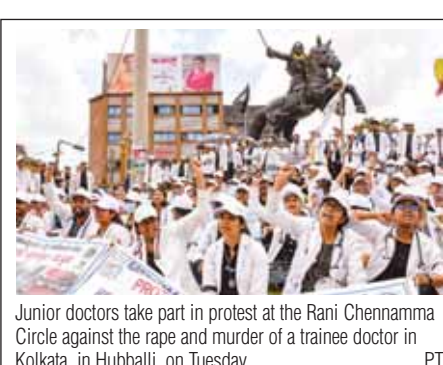
Junior doctors take part in protest at the Rani Chennamma Circle against the rape and murder of a trainee doctor in Kolkata, in Hubballi, on Tuesday