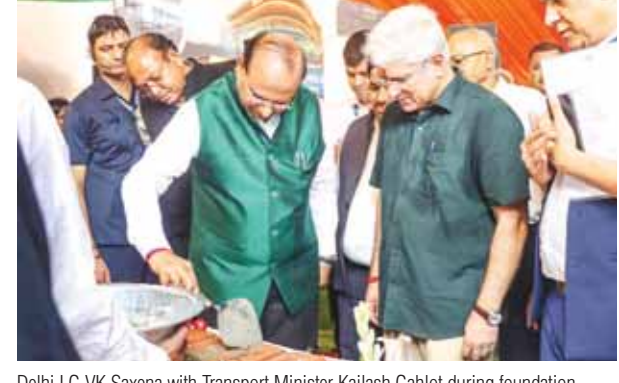
Delhi LG VK Saxena with Transport Minister Kailash Gahlot during foundation stone laying of multi-level electric bus depot, in New Delhi, on Tuesday

Uncertainty over who will hoist the national flag in the absence of Chief Minister Arvind Kejriwal, ended on Tuesday after Lieutenant Governor Vinai Kumar Saxena nominated Delhi Home Minister Kailash Gahlot to hoist the national flag at State Government function on Independence Day at Chhatrasaal Stadium. A controversy erupted with the jailed Chief Minister Arvind Kejriwal directing Cabinet member Atishi to do the same. "Lieutenant Governor is pleased to nominate Minister (Home), GNCTD,