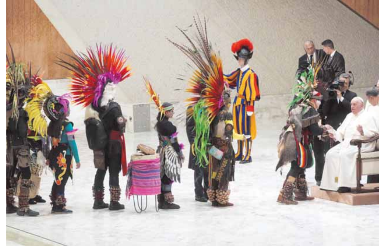
A group of Mexican faithful wearing traditional costumes meet with Pope Francis attends the weekly general audience in the Paul VI hall at the Vatican on Wednesday.

service to and from the space station, after the shuttles retired in 2011. NASA signed contracts worth billions with both companies in order to have a backup in case one of them got sidelined by an accident.