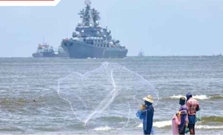
Fishermen cast their nets in the Arabian sea, at the Kochi coast