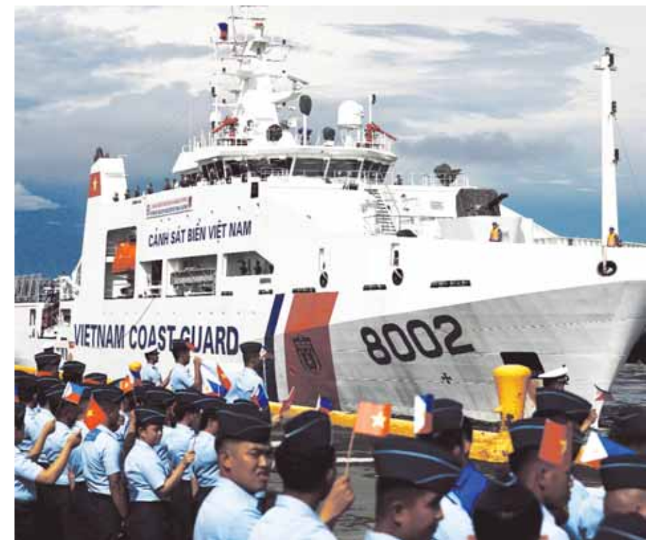
Manila : Philippine Coast Guard personnel wave flags as the Vietnam Coast Guard CSB-8002 patrol ship makes a port call at the Port of Manila, Philippines, 05 August 2024. Philippine and Vietnam coastguards will conduct joint maritime exercises in the disputed South China sea to foster mutual understanding and enhanced cooperation between the two nations