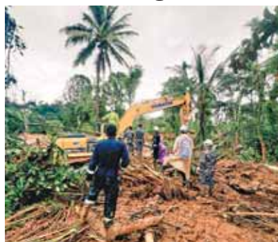
A rescue operation underway after a landslide in Wayanad

As search and rescue operations continue in landslide-hit Wayanad district in Kerala which has claimed over 380 lives and left more than 100 missing, Union Environment Minister Bhupender Yadav on Monday attributed the tragedy to the "illegal human habitat expansion and protection for illegal mining in the fragile region by local politicians" under the tutelage of the Southern State Government. Talking to reporters here on Monday, Yadav also accused local politicians of failing to regulate and protect sensitive zones, contributing to the disaster that struck the region six days ago. The impacts of the landslides are still being felt by the locals, exacerbating the ongoing crisis in Wayanad. "It is an illegal protection to the illegal human habitation by the local politicians. Even in the name of tourism, they are not making proper zones. They allowed encroachment of