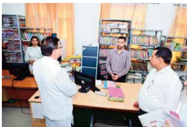
crore to Rs 10 crore.

crore to Rs 10 crore. He also directed officials to check the feasibility of group insurance for journalists. A system should also be put in place for accreditation of journalists till the Tehsil level. He said that the Information department is the link between the government and the public and that it should ensure that the works and schemes of the government are communicated in simple language through the media to the public.