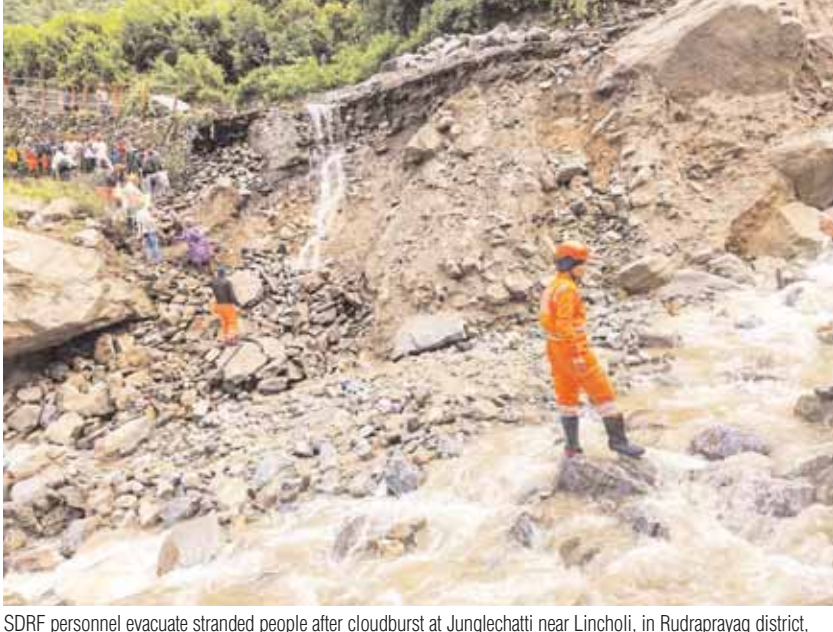
SDRF personnel evacuate stranded people after cloudburst at Junglechatti near Lincholi, in Rudraprayag district, on Thursday

"During the heavy rain on Wednesday, the adhesive material used to fix the glass domes over the Lobby of the Building was slightly displaced, causing minor leakage of water in the Lobby," the Lok Sabha Secretariat said in a statement.