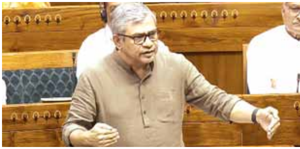
Union Railway Minister Ashwini Vaishnaw speaks in the Lok Sabha during the Monsoon session of Parliament, in New Delhi, on Thursday

Under criticism due to series of train accidents and derailments in recent times, Railways Minister Ashwini Vaishnaw on Thursday assured that the Government will make every effort to implement automatic train-protection system Kavach in the right earnest. Vaishnaw, however, did not give any timeline for implementation of Kavach on the entire railways network, but mentioned that smaller countries having much smaller railways networks took more than 20 years to implement the automatic train-protection system. "I can assure you that no stone will be left unturned in the roll