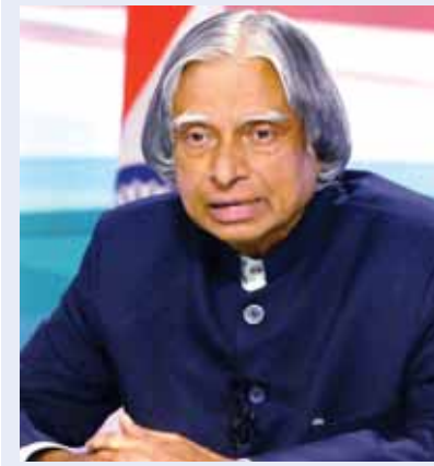
Throughout his life Abdul Kalam professed the scientific, academic as well as spiritual development of the students. He made

numerous speeches and wrote many books addressing the youth; which are listened and read even today by students even across the world. Choosing his birth day as the 'World's Student's Day' was an appropriate decision honoring his works as a scientist and the millions of youths that he inspired and still inspires through his works, achievements, speeches, lectures and books. Students deserve better education standards and we hope it is time to inculcate the best education to students so that they may not wish to go to other countries for education purposes. He believed that students are the future of a nation and they can bring considerable change if well nurtured and educated. He professed education as the only weapon to fight back the demons of poverty, illiteracy, malnutrition etc.