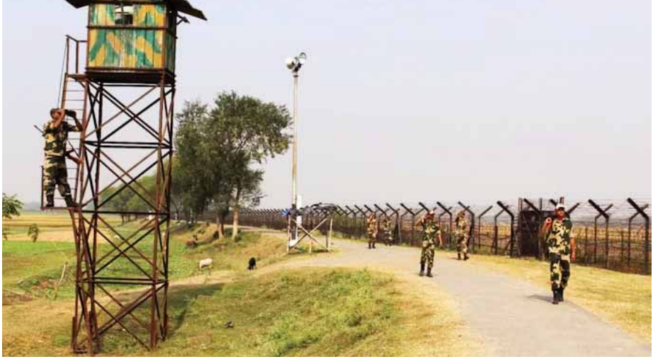
personnel fought back even as a fellow jawan threw a "stun grenade" from a distance to frighten the intruders away. As the infiltrators continued to advance undeterred the woman constable fired a single shot from her rifle scaring the infiltrators who then ran back

A woman personnel of the Border Security Force has successfully beaten back infiltration bid by an armed band of Bangladeshis fighting them single-handedly at the Ranaghat border out-post of the 68th battalion in Nadia district, sources in the paramilitary organisation said. According to sources the lady official in charge of a CCTV control room on July 30 noticed some 14 people walking towards the Indian side of the border. She immediately rushed towards them and directed them to stop and return. However, armed with knives and other lethal weapons they would not listen and charged at her. The valiant BSF