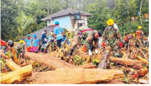
Rescue operation underway after landslides triggered by rain, in Wayanad district, Kerala on Thursday

regarding the dismembered human bodies recovered from the rivers and the landslide-affected regions. There is no information about 240 persons from Mundakkai missing after Tuesday's landslides. Engineers of the Indian Army have almost completed the laying of the Bailey bridge across the Chaliyar river to facilitate rescue operations.