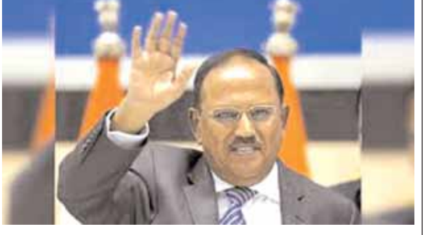
National Security Advisor Ajit Doval (file pic) and the representatives of the Maldives, Mauritius and Sri Lanka signed the Charter and an MoU for the establishment of the Colombo Security Conclave Secretariat

PTI ■ COLOMBO National Security Advisor Ajit Doval and the representatives of the Maldives, Mauritius and Sri Lanka on Friday signed the Charter and an MoU for the establishment of the Colombo Security Conclave Secretariat here to promote regional security by addressing transnational threats and challenges of common concern to the member states. The Colombo Colombo Security Conclave (CSC) brings together National Security Advisors (NSA) and Deputy NSAs from India, Sri Lanka, Maldives and Mauritius. It deals with maritime security, counter-terrorism and cyber security with India bringing to the fore its own strategic concerns in the Indian Ocean and promotes regional security by addressing transnational threats and challenges of common concern to the Member States. "NSA Ajit Doval KC joined reps from Maldives, Mauritius & Sri Lanka in signing the Charter & MoU for the establishment of Colombo Security Conclave (CSC) Secretariat today. A key platform to enhance regional security cooperation, the signing marks a milestone in the CSC roadmap," the Indian High Commission here said in a post on X along with photos from