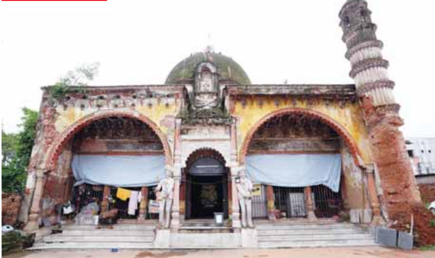
Aukhra Nimbarka Peeth Mahanta Asthal, a 250-year-old Mutt in East Bardhaman

Recently the Mayor of the picturesque Santorini Island in Greece had to declare an emergency as 17000 tourists descended on the island in one day. The beleaguered residents of the island were advised to stay indoors as swarms of tourists took over the hapless location putting immense stress on infrastructure, accommodation and the local environment including the verdant beaches. This has triggered protests by the locals who took out rallies holding placards that read "no more mass tourism."