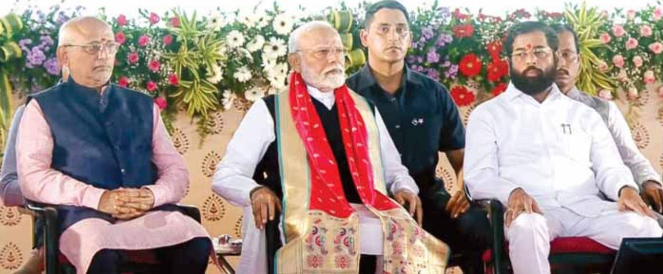
Prime Minister Narendra Modi with Maharashtra Governor CP Radhakrishnan and Chief Minister Eknath Shinde during laying of the foundation stone of Vadhan Port and launching of development works, in Palghar district, on Friday