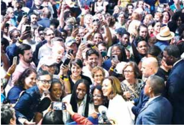
Democratic presidential nominee Vice President Kamala Harris poses for photos at a campaign rally in Savannah on Thursday.

Democratic presidential nominee Kamala Harris has said President Joe Biden called her personally on a Sunday to inform her about his decision to not seek reelection, asserting that he was "very clear" about endorsing her instead. In the first major television interview of her presidential campaign on Thursday, the 59-year-old Vice President said she was with her family when she got the call from Biden, 81. Harris said that she was having bacon with her baby nieces when her phone rang. "And it was Joe Biden. And — and he told me what he had decided to do. And I asked him, 'Are you sure?' And he said, 'Yes.' And that's how I learned about it," she told CNN in a joint interview with her running mate Minnesota