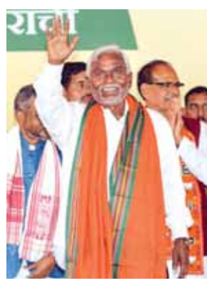
Former Jharkhand chief minister Champai Soren with Union Minister Shivraj Singh Chouhan waves to supporters after joining BJP during a ceremony, in Ranchi, Friday

On a day when Ghatshila OMLA Ramdas Soren replaced him in the Jharkhand Cabinet taking oath as a Minister, former Chief Minister Champai Soren, popularly known as the "Kolhan Tiger", joined the BJP on Friday, marking a significant change in the State's political landscape just ahead of the Assembly elections. Champai along with a large number of his supporters crossed over to the saffron camp in the presence of Union Minister Shivraj Singh Chouhan and Assam Chief Minister Himanta Biswa