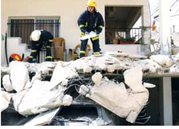
Palestinian civil defense workers clear the rubble from a damaged house following an Israeli military operation in the West Bank refugee camp of Nur Shams, Tulkarem, Friday.