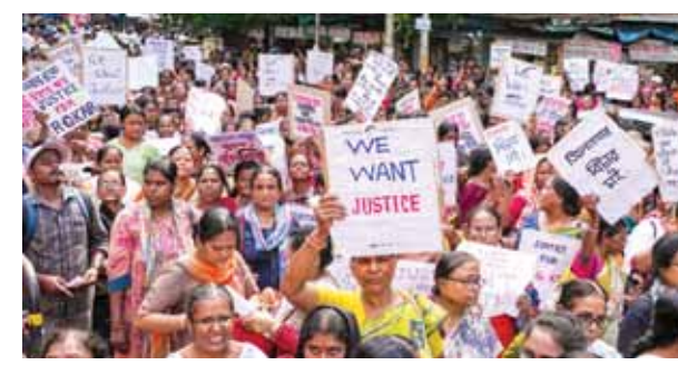
Womens participate in a rally to protest against the alleged rape and murder of a postgraduate trainee doctor, in Kolkata, on Thursday

The mother of the victim said, "They kept us, the parents of the only child who was dead.