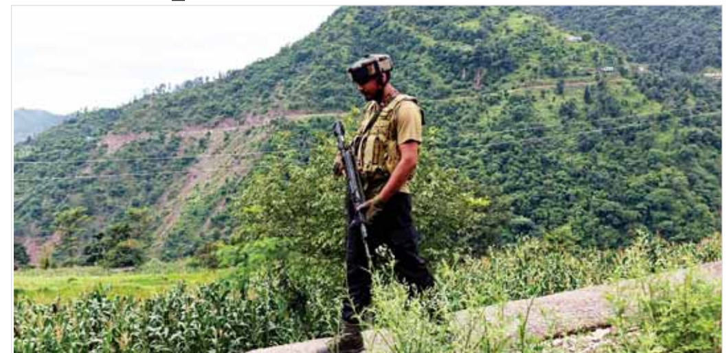
A security personnel keeps vigil during pre-dawn cordon and search operation after reports of suspicious movement, leading to ar exchange of fire, in Rajouri district, on Thursday