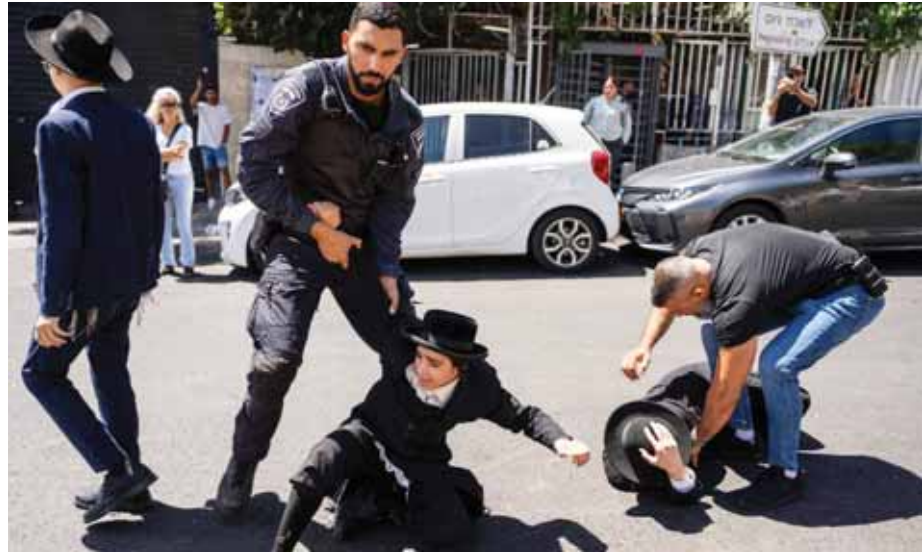
Israeli police officers scuffle with ultra-Orthodox Jewish men during a protest against a potential new draft law which could end their exemptions from military service in Jerusalem, Wednesday.