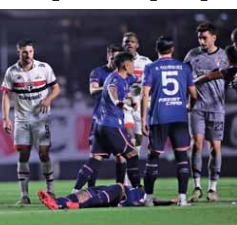
Uruguayan national team players were among those expressing their condolences. "Pain, sadness, it is hard to explain," Inter Miami striker Luis Suárez said. "May he rest