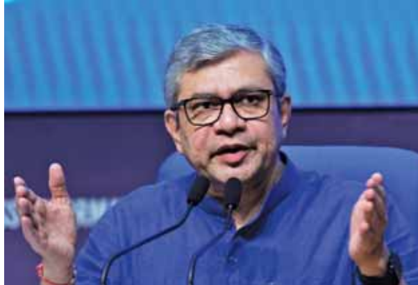
Union Minister Ashwini Vaishnaw briefs the media over Cabinet decisions in New Delhi on Wednesday

In a determined effort to boost domestic industry and create jobs, the Union Cabinet on Wednesday approved establishment of 12 new industrial cities in 10 States with an estimated investment of ₹28,602 crore. More than one million direct jobs will be created in these projects. Spanning 10 States and strategically located along six major corridors, these projects represent a significant leap forward in India's quest for enhanced manufacturing capabilities and rapid economic growth. These industrial areas will be located at Khurpia in Uttarakhand, Rajpura-Patiala in Punjab, Dighi in Maharashtra, Palakkad in Kerala, Agra and Prayagraj in UP, Gaya in Bihar, Zaaheerabad in Telangana, Orvakal and Kopparthi in AP, and Jodhpur-Pali in Rajasthan. The Union Cabinet has approved 12 new project proposals under the National Industrial Corridor Development Programme (NICDP) with an estimated