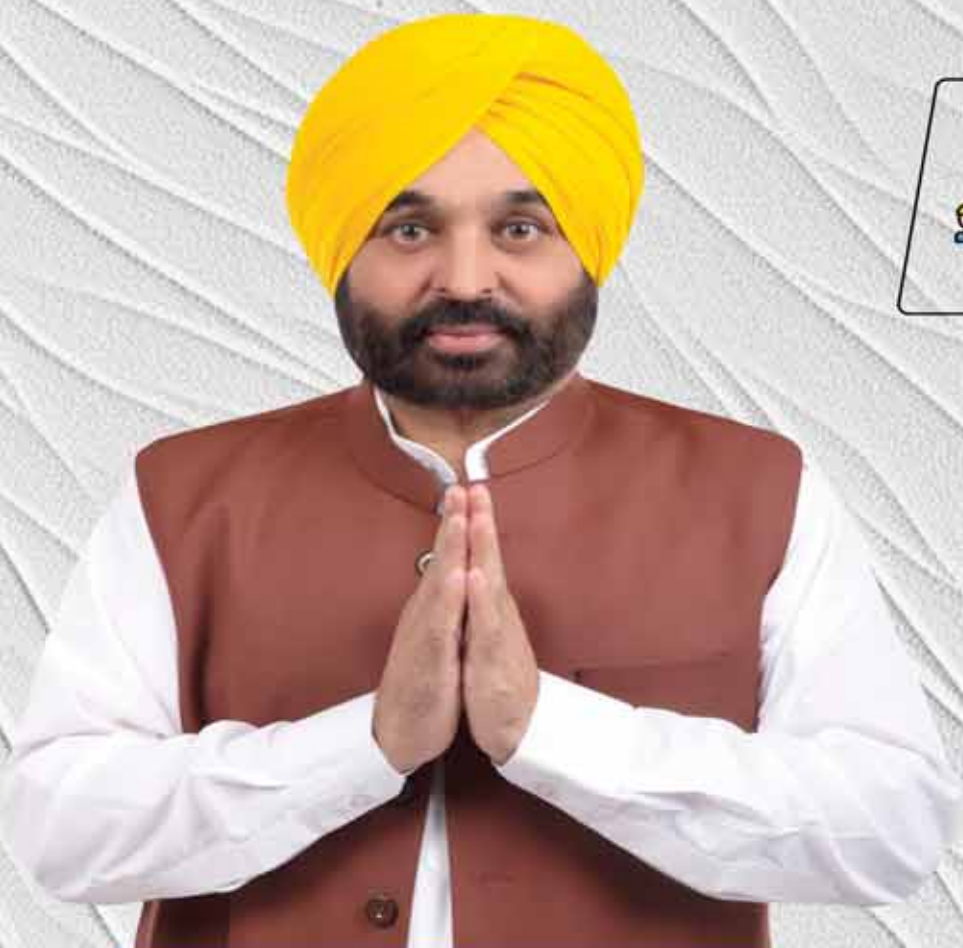
Bhagwant Singh Mann Chief Minister, Punjab

State-Level Competitions October 11 - Nov. 9, 2024