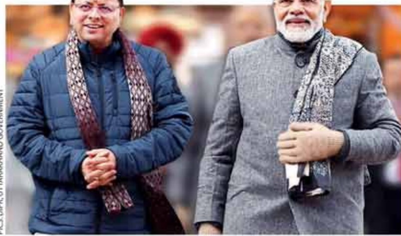
>> Narendra Modi, Prime Minister of India and Pushkar Singh Dhama, CM Uttarakhand

Chief Minister Pushkar Singh Dhama led government, with the vision of bringing uniformity in the society by providing same set of laws regarding marriage, divorce, land, property and inheritance to all people of Uttarakhand - irrespective of their faith - has taken the initiative to implement Uniform Civil Code in the Himalayan state. With CM Dhama announcing to implement UCC before November 9 - the state foundation day - Uttarakhand is on path of becoming the first state of the country, since Independence, to implement UCC. The law that intends to increase social harmony, promote gender justice and empower women, is in compliance with the provisions of Article 44 of the Constitution.