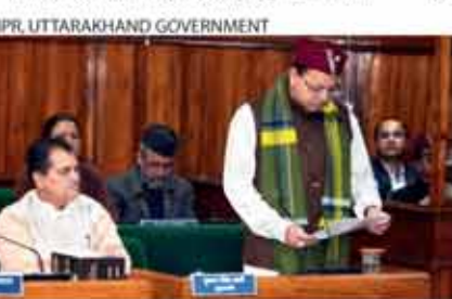
>> CM Pushkar Singh Dhama presiding over a meeting on Anti Copying Law

will facilitate a standardised set of laws, courts can process cases more swiftly, as judges will no longer need to interpret varying personal laws. This will significantly reduce the backlog of cases and ensure timely delivery of justice. For instance, disputes over inheritance and property rights, which