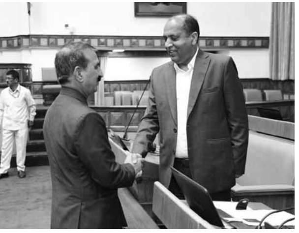
Himachal Chief Minister Sukhvinder Singh Sukhu, meeting the Leader of Opposition Jai Ram Thakur during the first day of the Monsoon Session of Himachal Pradesh Vidhan Sabha at Shimla on Tuesday. The two-week Monsoon session of the Assembly started on a stormy note with the opposition BJP staging a walkout after rejection of its adjournment motion on alleged deteriorating law and order situation in the state.

Punjab. The push came amidst a marked increase in drone activity, with over 120 drones intercepted this year alone, compared to 107 in all of 2023. Currently, the BSF has 20 battalions deployed along the 500-kilometre border, with two dedicated to critical security roles at the Attari check post and the Kartarpur corridor. The proposed battalion, comprising about 800-900 personnel, aimed at enhancing surveillance and counter-drone capabilities. With the majority of drones now arriving via drones, the BSF is also focusing on improving intelligence operations and community engagement. The force is innovating patrol methods and constructing infrastructure, such as culverts over rivers, to prevent illegal crossings and smuggling.