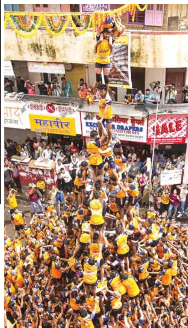
Devotees form a human pyramid to break the 'dahi handi', an earthen pot filled with curd, as part of Janmashtami celebrations, at Dadar, Mumbai, on Tuesday