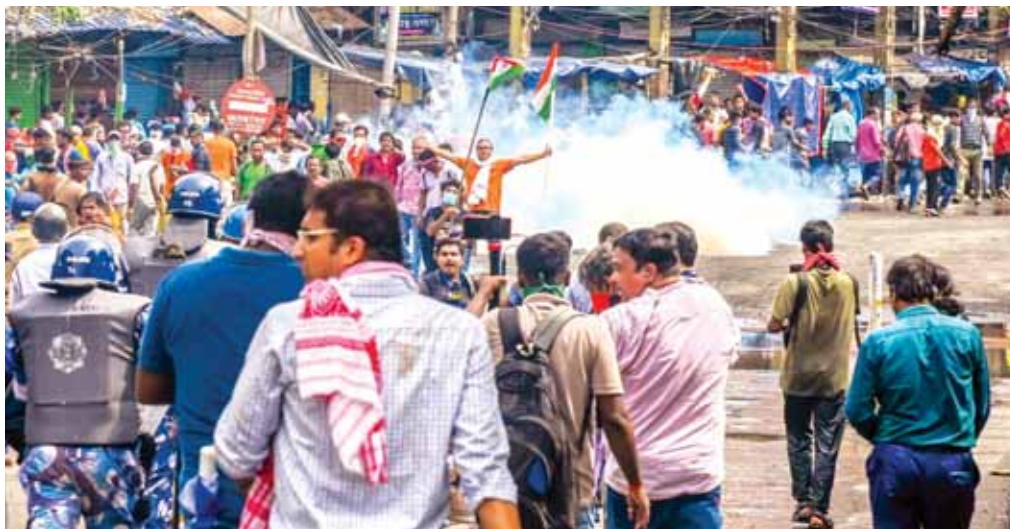
Tear gas shells being used by security personnel to disperse students during their protest march towards West Bengal Secretariat over the alleged sexual assault and murder of a trainee doctor, in Kolkata, on Tuesday

At various places people profusely bleeding from head were seen being carried away by their co-agitators to the hospitals. Similarly the policemen who often got isolated were also attacked. At Babu Ghat a crowd of agitators badly beat up two policemen with lathis, rods, bricks and even shoes. Some even spit on them while