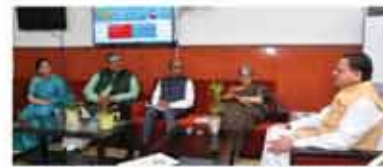
>> CM Pushkar Singh Dhama in discussion with UCC Panel

In a diverse state like Uttarakhand, where differ-