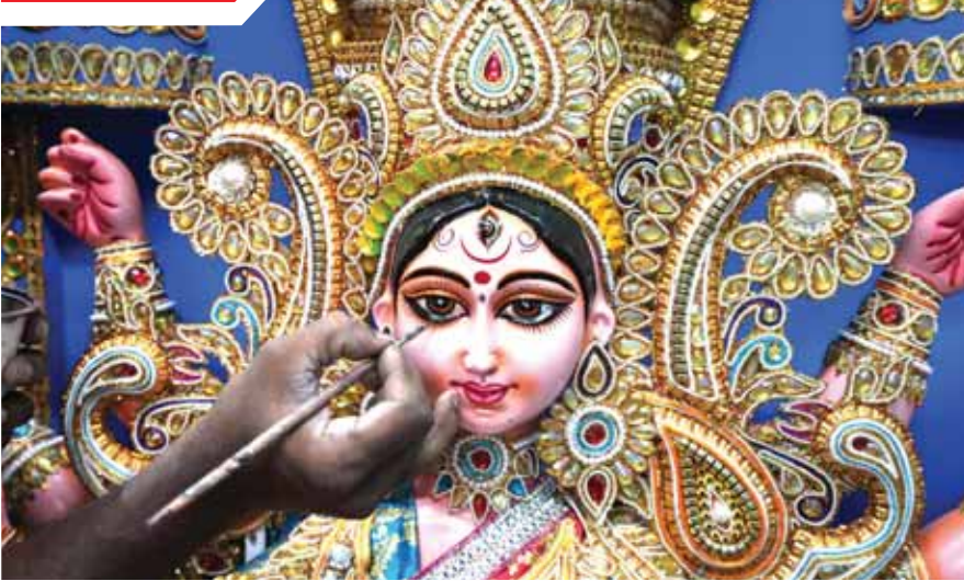
A painter gives final touches to the Goddess Durga's idol ahead of Durga pooja, in Kolkata