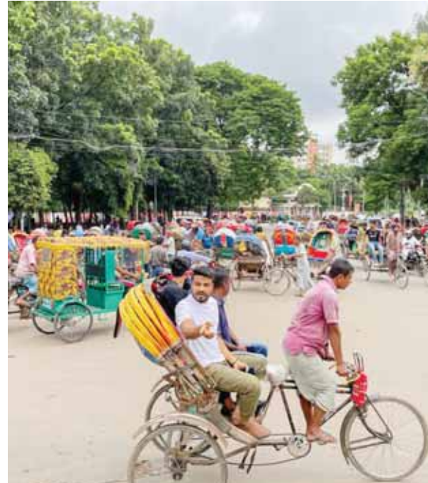
A man gestures as he rides a rickshaw going past Raju Memorial opposite the Teacher Student Centre (TSC) of the Dhaka University