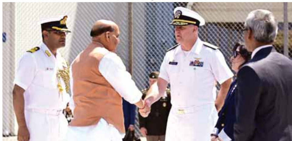
Union Defence Minister Rajnath Singh with others during a visit to the Naval Surface Warfare Centre, in Carderock, Maryland, USA PTI