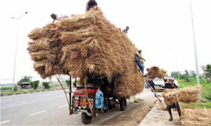
Workers load heaps of straw on an autorickshaw, in Bardhaman.