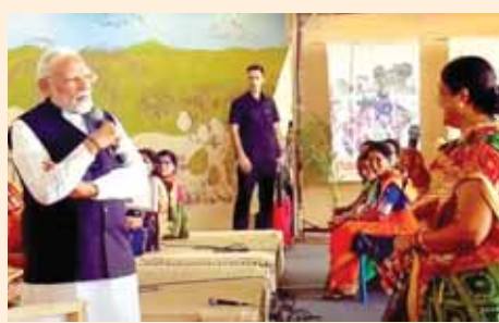
Prime Minister Narendra Modi during an interaction with Lakhpati Didis, in Jalgaon, on Sunday