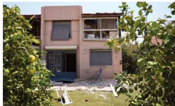
A damaged house is seen following an attack from Lebanon, in Acre, north Israel, on Sunday