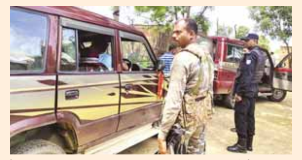
Security personnel outside the residence of a man allegedly linked to Al Qaeda, in Lohardaga, on Thursday. Seven people allegedly linked to Al Qaeda were detained by Jharkhand Anti-Terrorist Squad in raids in different parts of the State on Thursday

11.30 pm on August 9 after post-mortem and the FIR is recorded at 11.45 pm. This is extremely disturbing," the bench, also comprising Justice JB Pardiwala and Manoj Misra, said. Questioning the sequence and timing of the legal formalities conducted by police, Justice Pardiwala said, "The entire procedure followed by your State (West Bengal) is something which I have not come across in the 30 years of my professional life. "The first thing is, is it true that the UD (unnatural death) was recorded at 10.30 hours (10.30 am)? Second, who is this assistant superintendent non-medical (person), her conduct is also very doubtful. Why did she act in this manner?" It directed the Kolkata Police officer, who registered the first entry about the incident that shocked the country, to appear in the next hearing and disclose the time of the entry. The court also observed that there seemed to be an attempt to pass off the murder as a suicide. Meanwhile, the Central Bureau of Investigation (CBI) while sharing a status report on the matter claimed that the crime scene was altered and tampered with which has hindered the further probe in the case. The CBI also informed the court that the FIR was lodged after and murder of a woman doctor at R G Kar Medical College and Hospital in Kolkata.