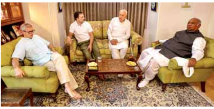
Congress president Mallikarjun Kharge with party leader Rahul Gandhi meets J&K National Conference president Farooq Abdullah and vice president Omar Abdullah, in Srinagar, on Thursday

Former alliance partners Congress and National Conference on Thursday decided to 'unitedly' contest the upcoming Assembly polls by forging a pre-poll alliance in Jammu and Kashmir. By finally stitching the deal, the National Conference has also put to rest all the speculations about the possibility of the post-poll alliance by the Kashmir-based mainstream regional parties with the ruling dispensation in New Delhi. The alliance partners have decided to contest all 90 seats as per the terms and conditions of the pre-poll alliance. The deal was struck between the two parties at the residence of Dr Farooq Abdullah in Srinagar. Omar Abdullah also attended the crucial meeting. Leader of the Opposition in Lok Sabha Rahul Gandhi, Congress chief Mallikarjun Kharge after addressing the workers meeting at a private hotel in Srinagar visited the Gupkar Road residence of Dr Abdullah where they held a closed-door meeting with the top brass of the National Conference discussing the contours of the pre-poll alliance. Soon after the meeting, the National Conference president Dr Farooq formally announced that the pre-poll alliance with Congress is final, and will be approved by this evening.