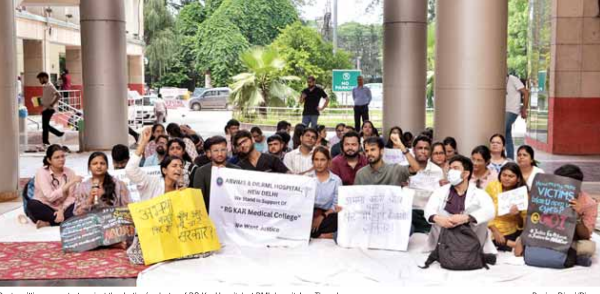
Doctor sitting on protest against the death of a doctor of RG Kar Hospital, at RML hospital on Thursday

11.30 pm on August 9 after post-mortem and the FIR is recorded at 11.45 pm. This is extremely disturbing," the bench, also comprising Justice JB Pardiwala and Manoj Misra, said. Questioning the sequence and timing of the legal formalities conducted by police, Justice Pardiwala said, "The entire procedure followed by your State (West Bengal) is something which I have not come across in the 30 years of my professional life. "The first thing is, is it true that the UD (unnatural death) was recorded at 10.30 hours (10.30 am)? Second, who is this assistant superintendent non-medical (person), her conduct is also very doubtful. Why did she act in this manner?" It directed the Kolkata Police officer, who registered the first entry about the incident that shocked the country, to appear in the next hearing and disclose the time of the entry. The court also observed that there seemed to be an attempt to pass off the murder as a suicide. Meanwhile, the Central Bureau of Investigation (CBI) while sharing a status report on the matter claimed that the crime scene was altered and tampered with which has hindered the further probe in the case. The CBI also informed the court that the FIR was lodged after and murder of a woman doctor at R G Kar Medical College and Hospital in Kolkata.