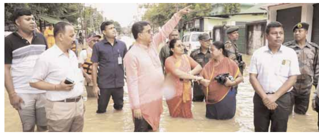
Tripura Chief Minister Manik Saha inspects a flood-affected area after heavy rains, on the outskirts of Agartala, on Thursday

India on Thursday described as factually incorrect reports floating in Bangladesh that the current flood situation in certain parts of the country has been caused by the opening of the floodgates of the dam on the Gumti river in Tripura. The Ministry of External Affairs (MEA) said floods in the rivers flowing through both the countries are a "shared" problem inflicting sufferings on the people on both sides, and require close mutual cooperation for resolution. "We have seen concerns being expressed in Bangladesh that the current situation of flood in districts on the eastern borders of Bangladesh has been caused by opening of the Dumbur Dam upstream of the Gumti river in Tripura. This is