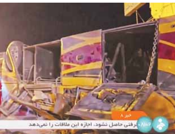
This image taken from a video released by Iranian state television shows the aftermath of a bus crash near Taft, Iran, early Wednesday. A bus carrying Shiite pilgrims from Pakistan to Iraq crashed in central Iran, killing multiple people, an official said Wednesday.