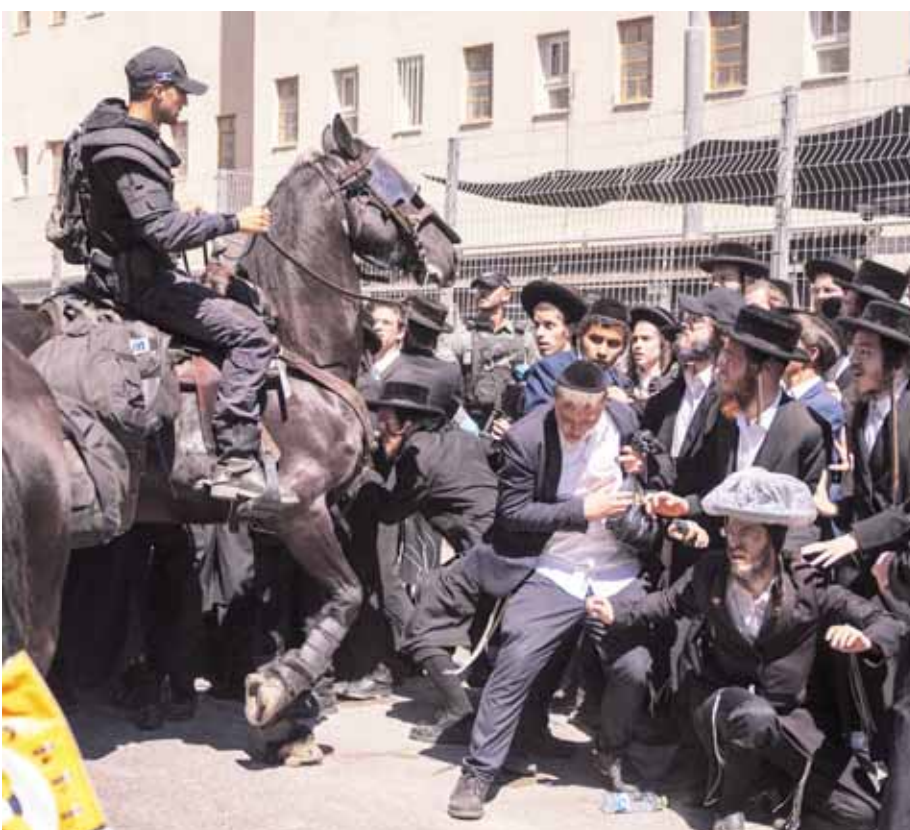
Israeli police officers scuffle with ultra-Orthodox Jewish men during a protest against a potential new draft law which could end their exemptions from military service in Jerusalem, Wednesday.

of Aden. A Liberian-flagged oil tanker came under a particularly intense series of attacks, beginning August 8, likely carried out by the rebels. A similar attack happened Aug. 13 as well. As Iran threatens to retaliate against Israel over the assassination of Hamas leader Ismail Haniyeh in Tehran, the US military told the USS Abraham Lincoln aircraft carrier strike group to sail more quickly to the area. America also has ordered the USS Georgia guided missile submarine into the Mideast, while the USS Theodore Roosevelt aircraft carrier strike group was in the Gulf of Oman. Additional F-22 fighter jets have flown into the region and the USS Wasp, a large amphibious assault ship carrying F-35 fighter jets, is in the Mediterranean Sea.