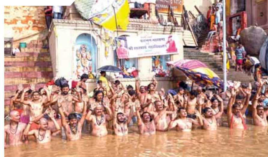
People perform Shrawani Purnima rituals while taking bath in the Ganga river, in Varanasi