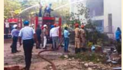
Firefighters douse a fire which broke out following an explosion in a reactor unit of pharmaceutical company Escientia, in Anakapalle, Andhra Pradesh, on Wednesday.