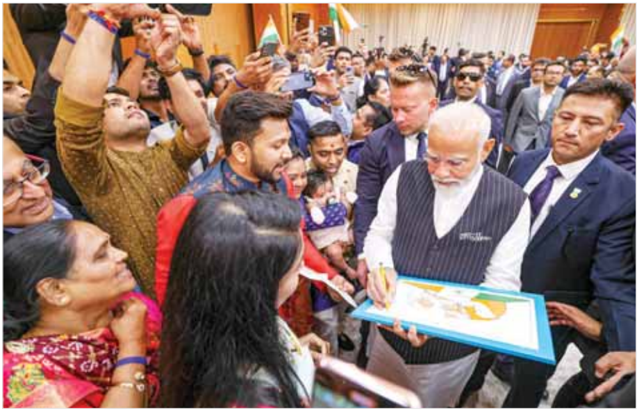
Prime Minister Narendra Modi gives his autograph on a portrait presented to him by the Indian community members upon his arrival at a hotel, in Warsaw, Poland, on Wednesday.

P Prime Minister Narendra Modi on Wednesday said he was looking forward to sharing perspectives with President Volodymyr Zelenskyy on a peaceful resolution of the Ukraine conflict. The Prime Minister's comments came on Wednesday shortly before he embarked on a two-nation trip to Poland and Ukraine. Modi on Wednesday said his maiden visit to Poland will add momentum to the bilateral friendship and benefit the people of the two countries as he arrived here on the first leg of his two-nation visit during which he will also travel to the Ukrainian capital Kyiv. Modi, who will meet Poland's President Andrzej Sebastian Duda and hold bilateral talks with Prime Minister Donald Tusk, said he was looking forward to the various programmes in the Polish capital here. "Landed in Poland. Looking forward to the various programmes here. This visit will add momentum to the India-Poland friendship and benefit the people of our nations," Modi said in a post on X soon after his arrival at the Warsaw military airport here. On the first leg of the visit, Modi is visiting Polish capital city of Warsaw on August 21