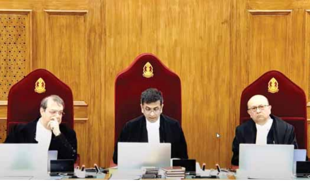
A bench comprising Chief Justice of India (CJI) DY Chandrachud, Justice JB Pardiwala and Justice Manoj Misra during hearing on a suo moto case related to the alleged sexual assault and murder of a postgraduate trainee doctor in Kolkata, at Supreme Court in New Delhi on Tuesday

A Bench of Chief Justice of India (CJI) DY Chandrachud, Justices JB Pardiwala and Manoj Misra was hearing matters related to the incident after it took suo motu cognisance of the incident, which has triggered a nationwide strike by doctors and other health workers. The SC passed the order saying