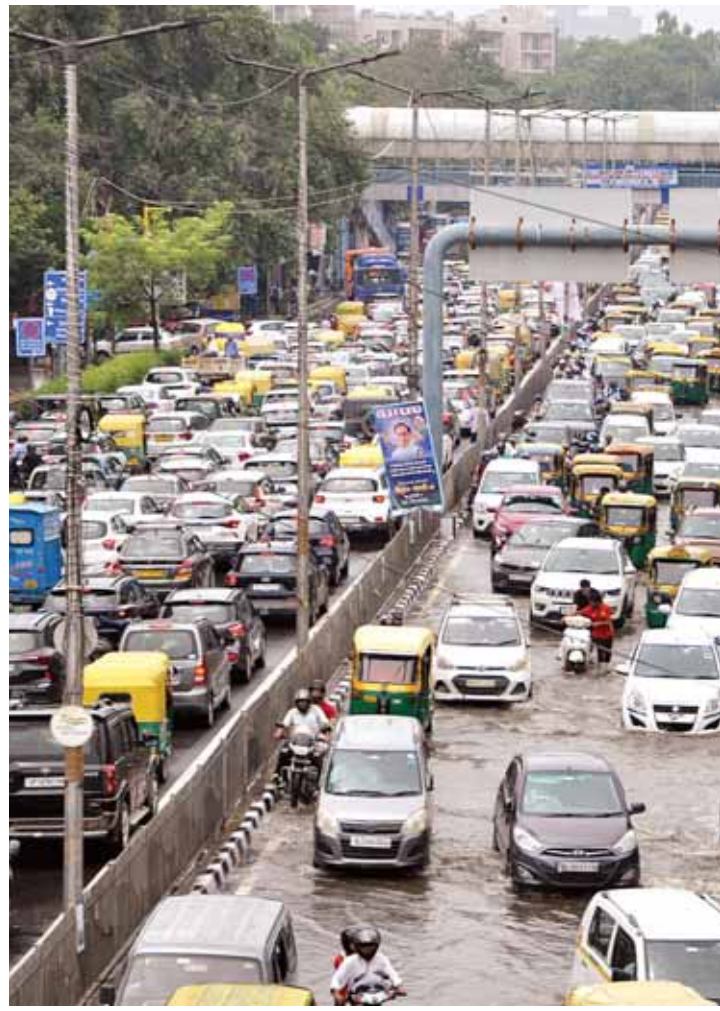
A traffic jam, waterlogged road amid monsoon rain, at ITO, New Delhi on Tuesday