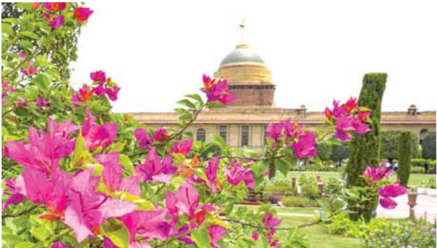
Flowers in full bloom in Amrit Udyan at Rashtrapati Bhawan, New Delhi