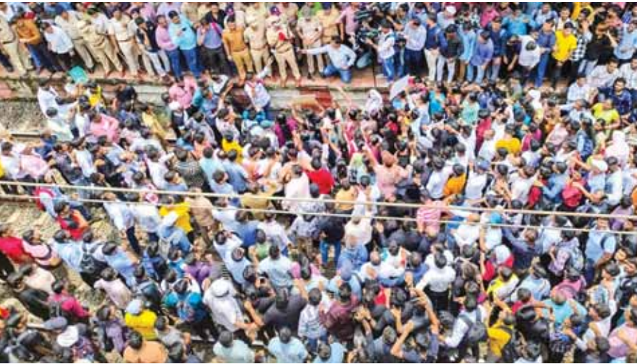
Police speak with protesters on Tuesday who blocked railway tracks at Badlapur station in Thane district after the alleged sexual assault of two four-year-old girls by the school sweeper in the washroom