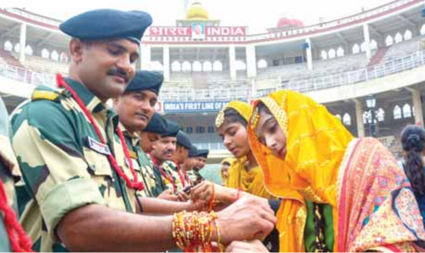
Women tie 'rakhi' on wrists of BSF personnel on the occasion of Rakshabandhan at Attari-Wagah Border, Amritsar