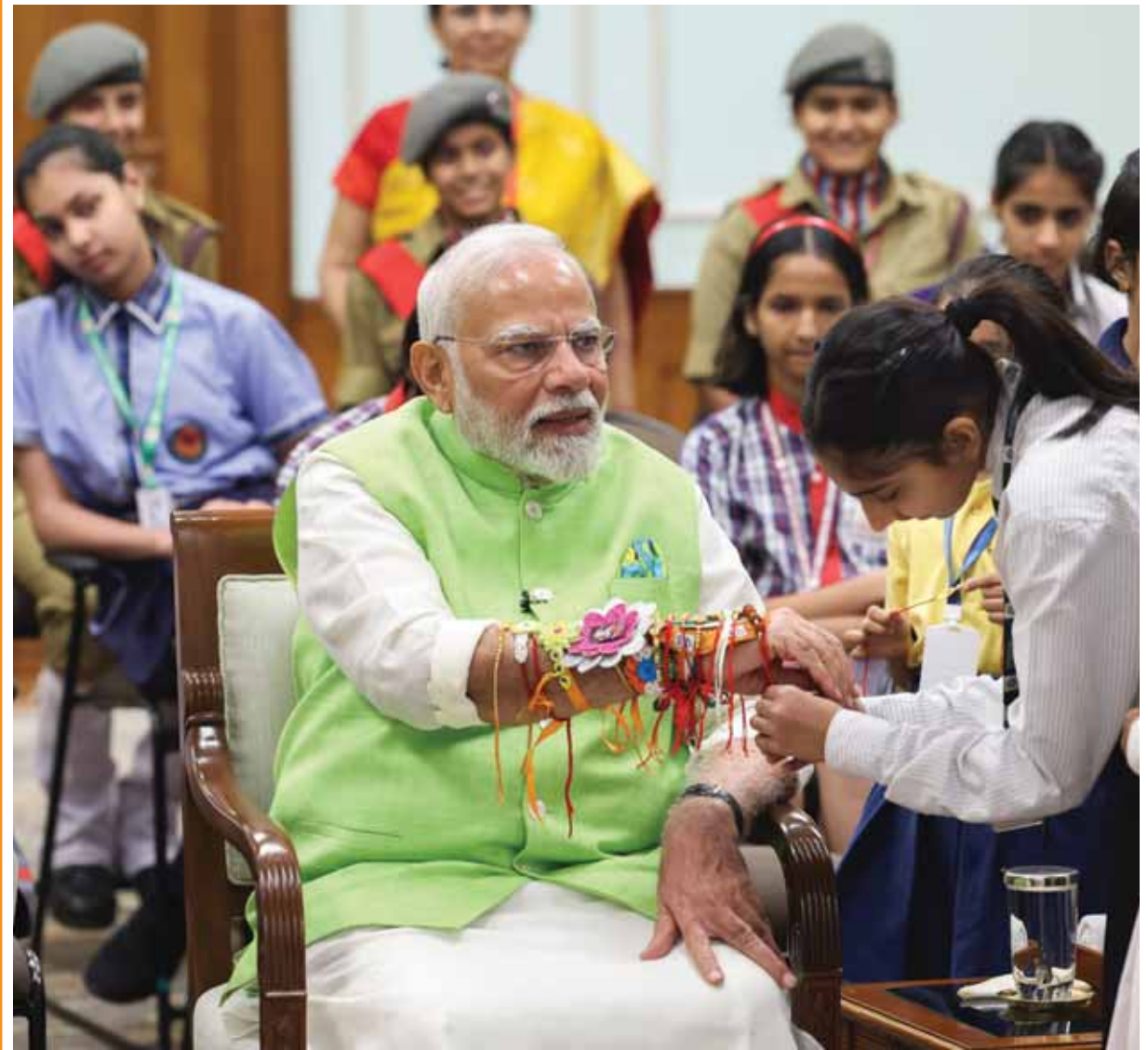
Prime Minister Narendra Modi during Raksha Bandhan celebration with schoolchildren, in New Delhi, on Monday