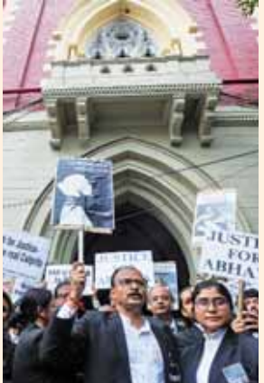
Lawyers of Calcutta High Court stage a protest against alleged sexual assault and murder of a postgraduate trainee doctor, in Kolkata, on Monday