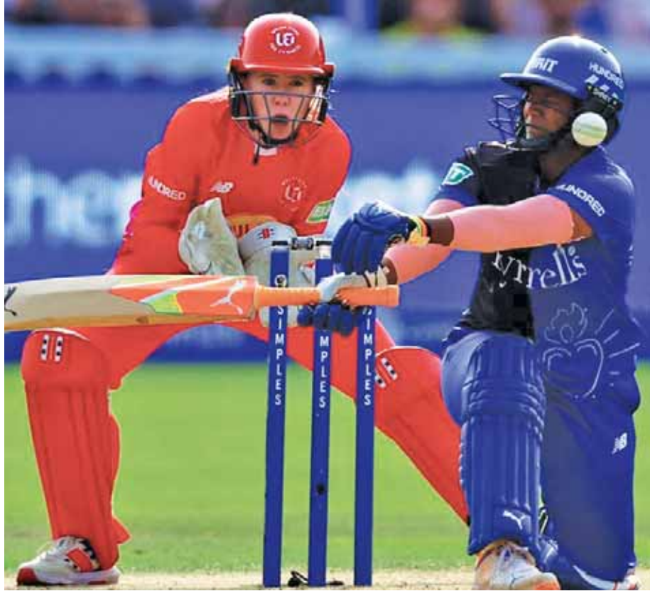
In reply, Georgia Redmayne anchored the chase with a 32-ball 34. Heather Knight (24) and Danielle Gibson (22) also

PTI ■ LONDON India all-rounder Deepti Sharma played a crucial role with both bat and ball as London Spirit lifted their maiden Women's Hundred title, beating Welsh Fire by four wickets in the final at the Lord's here. Deepti snapped a wicket giving away 23 runs and then smashed a run-a-ball 16, including the winning six off Hayley Matthews, as the Indian and England's Charlie Dean jumped into each other's arms in celebration. Two years ago, Deepti had controversially dismissed Dean after running her out at the non-striker's end during the third ODI against England in 2022, triggering a debate over the spirit of the game. It was ecstasy for Deepti and despair for Dean that day but here the two were on the same side, engineering the maiden victory after chasing down a victory target of 116 in 98 balls. Besides Deepti, Eva Gray (2/26) and Sarah Glenn (2/17) snapped two wickets each, while Tera Norris (1/18) also chipped in with a wicket to restrict Welsh Fire to 115 for 8 in stipulated 100 balls, which was mainly built on the 41-ball 54 by Australia's Jess Jonassen.