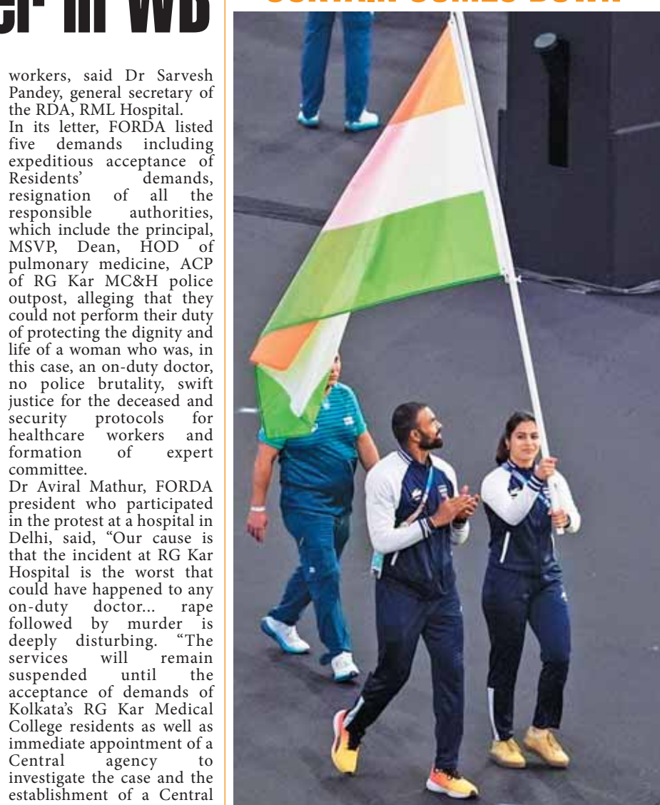
India's flag-bearers shooter Manu Bhaker and men's hockey team goalkeeper PR Srejeesh and others during the closing ceremony of the 2024 Summer Olympics at

A postgraduate student of the department of chest medicine was in the wee hours of Friday found dead in a semi-nude condition inside the seminar hall of the hospital.