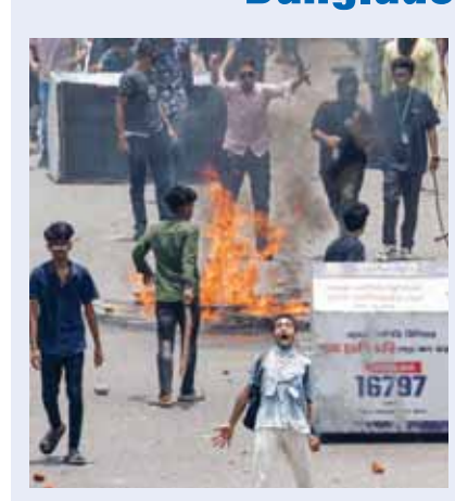
his is in response to the news article "Bangladesh: Uncertainty and Chaos Grip the Nation" (August 10). The recent vio-