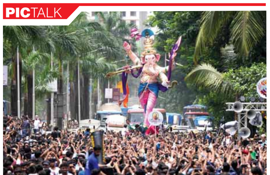
Devotees carry a Lord Ganesh idol for the Ganesh Chaturthi festival, in Mumbai

at the mercy of the weather gods. It is not rocket science to find the root cause of the problem and even fix it. Surely, the authorities would know that but the execution plan is missing. Despite being a metropolitan hub, Delhi's drainage system is outdated and poorly maintained. Besides, rapid and often haphazard urban development has led to the encroachment of natural water bodies and green spaces. These areas, which once absorbed excess rainwater, have been replaced by concrete structures, exacerbating the problem of water runoff. There is an urgent need to remove those encroachments and upgrade the drainage system. But unfortunately, urban planning in Delhi often happens in silos, with little coordination between different departments. This lack of an integrated approach has led to a situation where roads are built without adequate drainage. Delhi needs a multifaceted approach that addresses both the immediate challenges and long-term vulnerabilities: Utilising smart city technologies, such as real-time monitoring of drainage systems and predictive weather modelling, can help in better preparedness and response to heavy rains. While heavy rains are a natural phenomenon, the resulting waterlogging and disruption are largely man-made problems. To tackle this issue, concrete measures and decisive actions must be taken immediately.