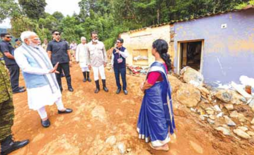
Prime Minister Narendra Modi interacts with officials during inspection of the landslide-affected areas, in Wayanad, on Saturday. MoS Suresh Gopi is also seen; the PM (R) interacts with a child survivor at AWS Hospital in Wayanad