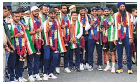
Paris Olympic Bronze medallist Indian Hockey players pose for photos on their arrival at the Indra Gandhi International Airport, in New Delhi, on Saturday