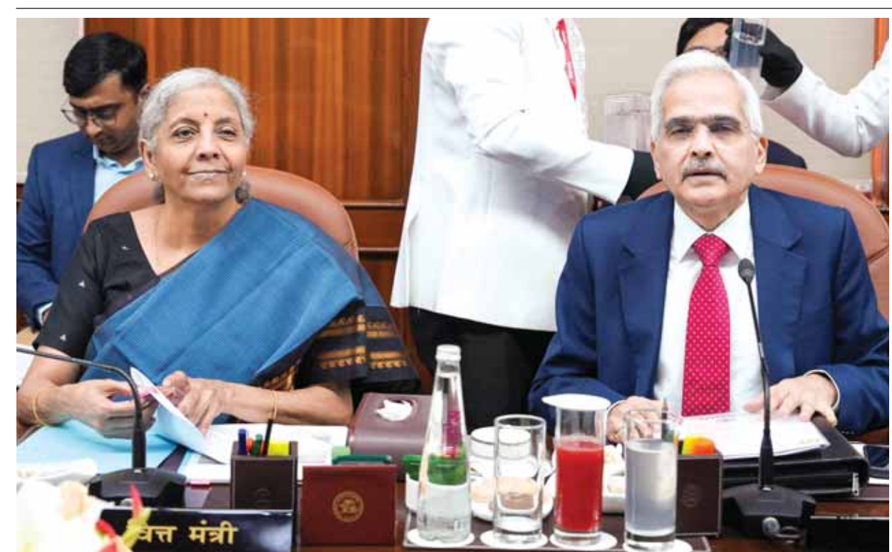
Union Finance Minister Nirmala Sitharaman with RBI Governor Shaktikanta Das during the Central Board of Directors of the Reserve Bank of India in the customary post-Budget meeting, at Reserve Bank of India in New Delhi, on Saturday

Water treatment player VA Tech WABAG Ltd has secured a repeat order of Rs 415 crore from the Chennai Metropolitan Water Supply and Sewerage Board, the company said on Saturday. The order is towards the Operation and Maintenance of 110 million litres per day Sea Water Reverse Osmosis (SWRO) Desalination Plant at Nemmeli in Chennai for a period of 7 years, city-based VA Tech WABAG Ltd said. VA Tech WABAG had bagged an Operation and Maintenance contract from the Chennai Metropolitan Water Supply and Sewerage Board (CMWSSB) and it was completed in 2021. In a BSE filing today, the company said, "CMWSSB floated a public tender for the Operation and Maintenance of the plant and WABAG secured this repeat order for Operating and Maintaining the plant for another 7 years."