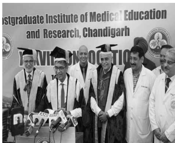
Postgraduate Institute of Medical Education and Research, Chandigarh

Delivering his Convocation Address to the hall packed to its capacity, the Chief Justice of India urged the young doctors to anchor their medical careers in empathy and ethics. "Empathy and ethics are not mere abstract concepts; they are the bedrock of your medical journey," he stated. He advised, "As you step into the world as healthcare professionals, remember that your technical skills are only part of