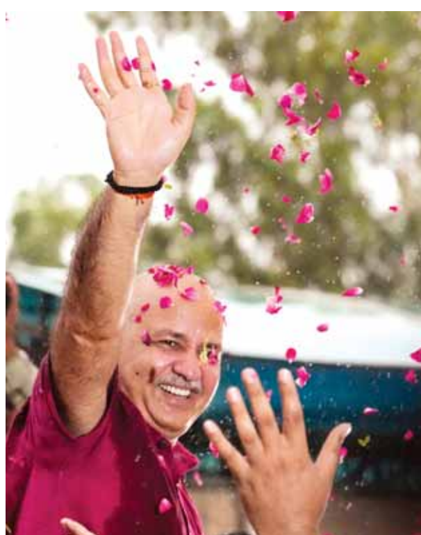
AAP leader Manish Sisodia waves to supporters after being released from Tihar jail following his bail granted by the Supreme Court in the corruption and money laundering cases linked to the alleged Delhi excise policy scam, in New Delhi, on Friday.