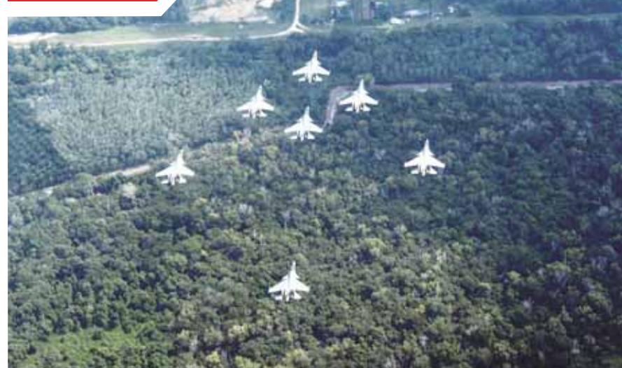
Military aircrafts during the multinational air exercise 'Tarang Shakti 2024', in Sullur