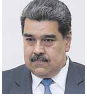
Telecommunications Commission, which has decided to remove the social network X, formerly known as Twitter, from circulation in Venezuela for 10 days so that they can present their documents." Maduro did not provide more details about the process taken against X.

President Nicolas Maduro said he has ordered a 10-day block on access to X in Venezuela, accusing the owner Elon Musk of using the social network to promote hatred after the country's disputed presidential election.