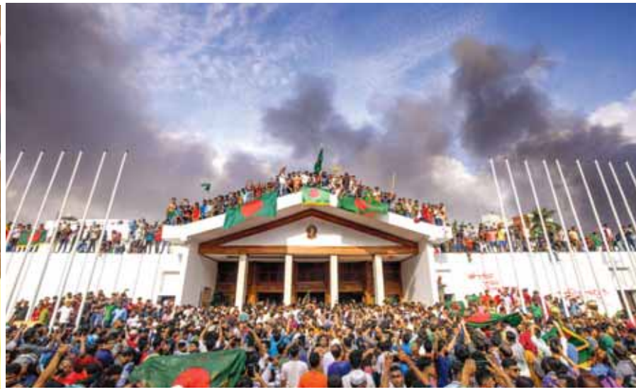
External Affairs Minister S Jaishankar speaks in the Lok Sabha on Tuesday (l); people gather around the residence of Bangladeshi Prime Minister in Dhaka, Bangladesh