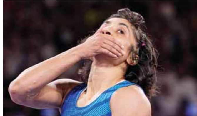
Vinesh Phogat reacts after the round of 16 of the women's freestyle 50kg wrestling match against Japan's Yui Susaki, at Champ-de-Mars Arena, during the 2024 Summer Olympics, on Tuesday