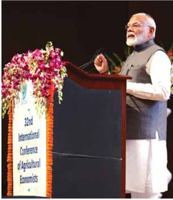
Prime Minister Narendra Modi speaking at the inauguration of the 32nd International Conference of Agricultural Economists (ICAE) at the National Agricultural Science Centre (NASC) Complex, in New Delhi on Saturday.

"There was a time when India's food security was a concern for the world. Now, India is working to provide solutions for global food security and global nutritional security," he said at the conference, attended by about 1,000 delegates from around 70 countries. Therefore, Modi said, India's experience is valuable for discussions on food system transformation and will benefit the global south. The Prime Minister reiterated India's commitment to global welfare as a 'Vishwa Bandhu'.