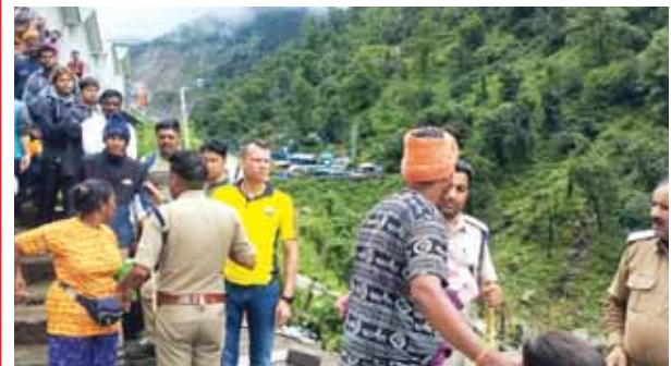
Officials during a rescue operation for stranded Kedarnath pilgrims, in Rudraprayag district.