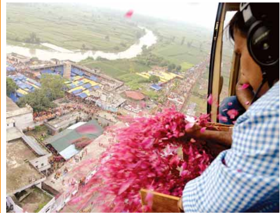
A helicopter showers flower petals on 'Kanwariyas', at Pura Mahadev Temple in Baghat