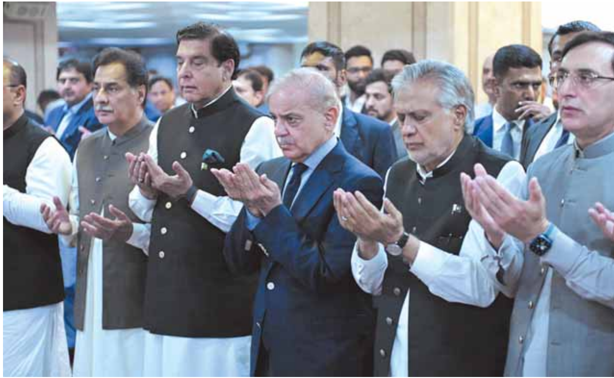
In this photo released by Pakistan's Prime Minister Office, Prime Minister Shehbaz Sharif, centre, and Parliamentarians pray after the absentee funeral prayers for killed Hamas leader Ismail Haniyeh, in Islamabad, on Friday

Jailed former Pakistan prime minister Imran Khan has approved the formation of a "grand opposition alliance" by expanding the existing platform, Tehreek Tahafuz-e-Ayine-Pakistan, to act as a powerful anti-government movement, a senior party leader has said. Former National Assembly speaker Asad Qaiser, who addressed reporters alongside the party's secretary-general Omar Ayub Khan outside Rawalpindi's Adiala Jail where the 71-year-old former cricketer-turned-politician is lodged since last August, said that the Pakistan Tehreek-e-Insaf (PTI) has decided to expand the opposition alliance in a meeting with Imran Khan on Thursday, Geo News reported. Qaiser announced that the former ruling party would gather all opposition parties to run a powerful anti-government movement. He said that the party's forthcoming power show in Khyber Pakhtunkhwa Swabi was aimed at raising a "strong voice" for the release of the PTI founder and other detained leaders. "This country will only be governed in accordance with the law and the Constitution," Qaiser emphasised. During his address, Qaiser also rebuked the incumbent Pakistan Muslim League-Nawaz-led coalition govern-