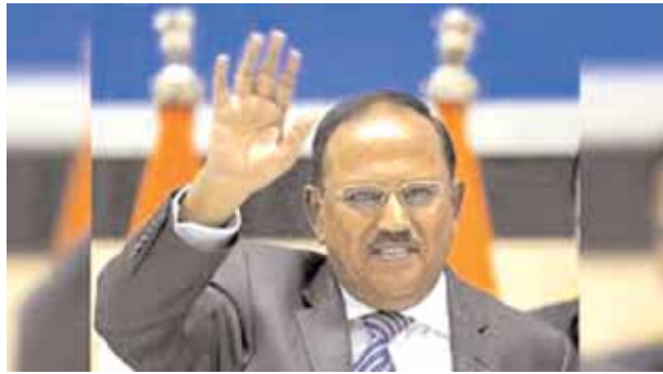
National Security Advisor Ajit Doval (file pic) and the representatives of the Maldives, Mauritius and Sri Lanka signed the Charter and an MoU for the establishment of the Colombo Security Conclave Secretariat