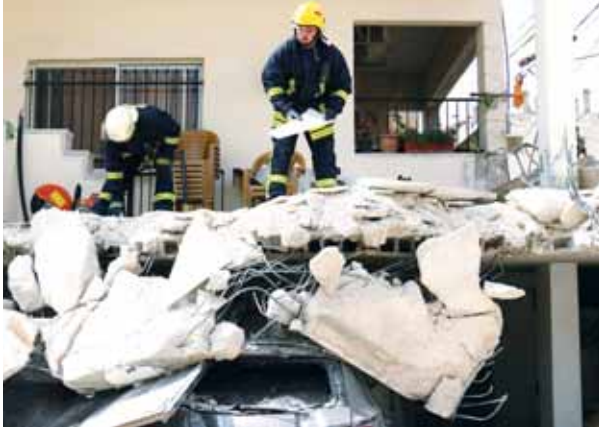
Palestinian civil defense workers clear the rubble from a damaged house following an Israeli military operation in the West Bank refugee camp of Nur Shams, Tulkarem, Friday.

"The convoy, which was coordinated by Anera and approved by Israeli authorities, included an Anera employee who was fortunately unharmed,"