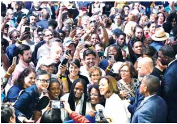
Democratic presidential nominee Vice President Kamala Harris poses for photos at a campaign rally in Savannah on Thursday.

Democratic presidential nominee Kamala Harris has said President Joe Biden called her personally on a Sunday to inform her about his decision to not seek reelection, asserting that he was "very clear" about endorsing her instead. In the first major television interview of her presidential campaign on Thursday, the 59-year-old Vice President said she was with her family when she got the call from Biden, 81. Harris said that she was having bacon with her baby nieces when her phone rang. "And it was Joe Biden. And — and he told me what he had decided to do. And I asked him, 'Are you sure?' And he said, 'Yes.' And that's how I learned about it," she told CNN in a joint interview with her running mate Minnesota