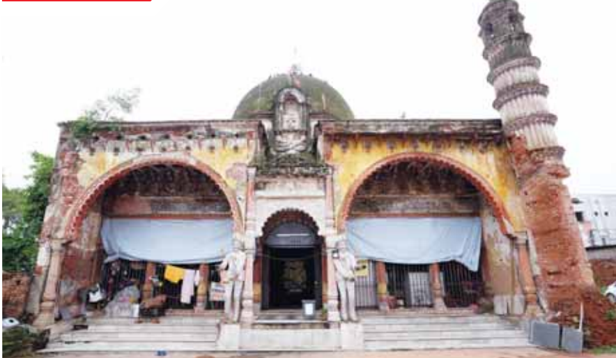
Aukhra Nimbarka Peeth Mahanta Asthal, a 250-year-old Mutt in East Bardhaman