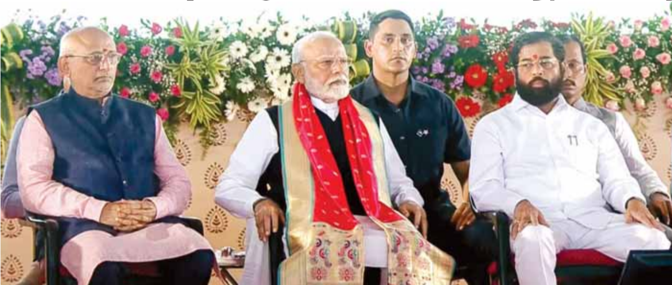
Prime Minister Narendra Modi with Maharashtra Governor CP Radhakrishnan and Chief Minister Eknath Shinde during laying of the foundation stone of Vadhvan Port and launching of development works, in Palghar district, on Friday