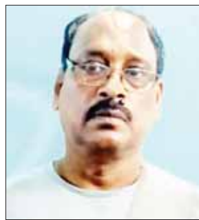
Sethy at Kanan Vihar, Phase-II, Patia, Chandrasekharpur, Bhubaneswar.

The searches were underway at the following places: o A four-storied building of