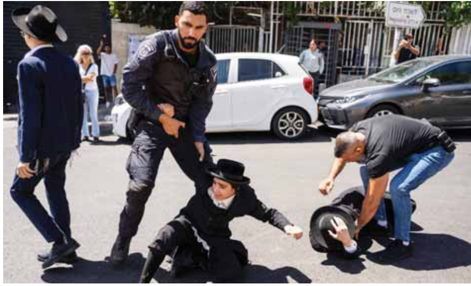
Israeli police officers scuffle with ultra-Orthodox Jewish men during a protest against a potential new draft law which could end their exemptions from military service in Jerusalem, Wednesday.