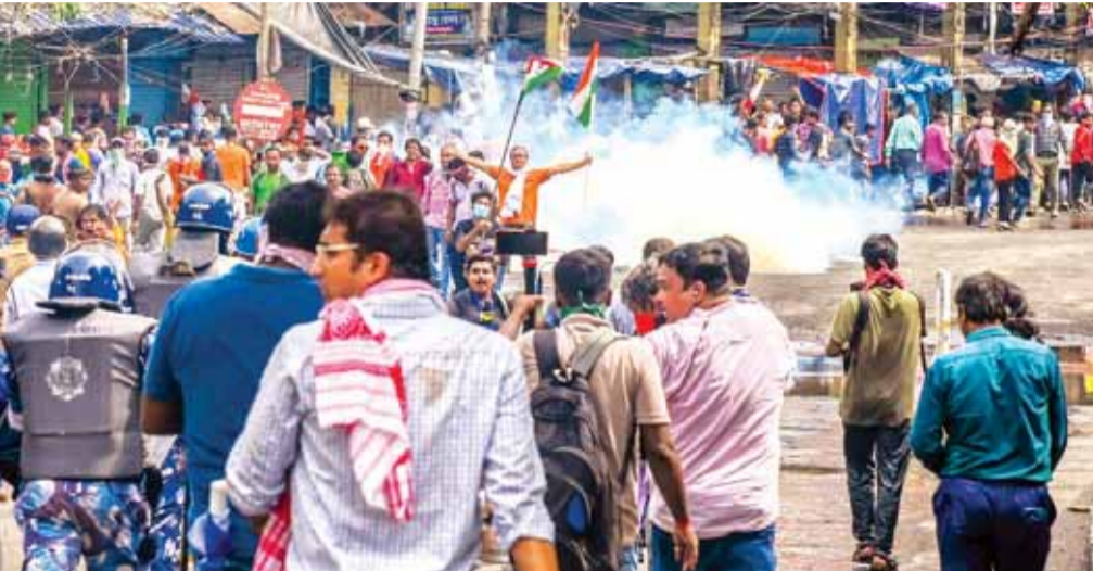
Tear gas shells being used by security personnel to disperse students during their protest march towards West Bengal Secretariat over the alleged sexual assault and murder of a trainee doctor, in Kolkata, on Tuesday

Many people, including policemen, were injured in pitched battles intermittently fought at various locations of Kolkata and Howrah between the men in uniform and students protesting against the rape and murder of the lady doctor at a medical college in Kolkata. Several protesters were taken into custody. The students under the banner of a relatively obscure Paschim Banga Chhatra Samaj — with apparent blessings of the Opposition BJP — marched towards the State Secretariat Nabanna to demand the resignation of Chief Minister Mamata Banerjee when clashes took place. Initial jostling turned into skirmishes with the police repeatedly bursting tear gas, charging water jets and resorting to lathicharge as the charged up agitators that included many women refused to relent and turned aggressive. The pitched battles continued for more than five hours giving the police a harrowing time, sources in the administration said, adding additional combat forces and RAF had to be called in from the neighbouring districts. At various places people profusely bleeding from head were seen being carried away by their co-agitators to the hospitals. Similarly the policemen who often got isolated were also attacked. At Babu Ghat a crowd of agitators badly beat up two policemen with lathis, rods, bricks and even shoes. Some even spit on them while