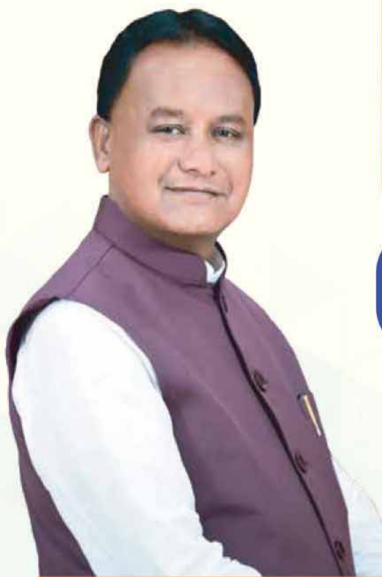
ମାନ୍ୟବର ମୁଖ୍ୟମନ୍ତ୍ରୀ ଶ୍ରୀ ମୋହନ ଚରଣ ମାଝୀ