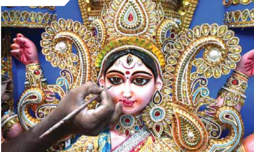
A painter gives final touches to the Goddess Durga's idol ahead of Durga puja, in Kolkata