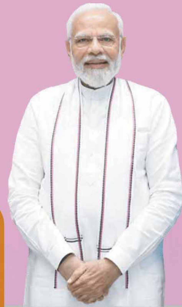
ମାନ୍ୟବର ପ୍ରଧାନମନ୍ତ୍ରୀ ଶ୍ରୀ ନରେନ୍ଦ୍ର ମୋଦୀ