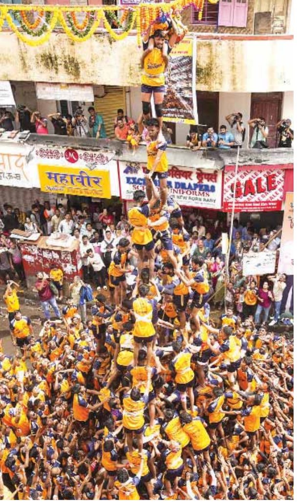
Devotees form a human pyramid to break the 'dahi handi', an earthen pot filled with curd, as part of Janmashtami celebrations, at Dadar, Mumbai, on Tuesday

storm with lightning may also occur in Baleswar, Bhadrak, Jajpur, Kendrapada, Cuttack, Jagatsinghpur, Puri, Khordha and Nayagarh districts, said the Regional Office of the IMD here. On Thursday, heavy to very heavy rainfall (7 to 20 cm) along with thunderstorm or lightning is likely in Malkangiri, Koraput, Nabarangpur and Rayagada districts. Heavy rainfall accompanied by thunderstorm and lightning may also occur in Ganjam, Gajapati, Kalahandi, Kandhamal, Balangir, Nuapada, Nayagarh, Khodha and Puri, said the IMD issuing an Orange warning. On Friday, isolated heavy to very heavy rainfall (7 to 20 cm) with isolated extremely heavy rainfall (20cm) has been sounded for Malkangiri and Koraput. There is also a Yellow warning of heavy to very heavy rainfall (7 to 20 cm) for Nabarangpur, Kalahandi and Rayagada. Heavy rainfall (7 to 11 cm) may also occur in Nuapada, Balangir, Kandhamal, Ganjam, Gajapati, Puri, Khodha and Nayagarh. On Saturday, heavy to very heavy rainfall may occur in Nabarangpur, Malkangiri and Koraput districts along with heavy rainfall in Rayagada, Gajapati, Kalahandi, Nuapada, Balangir and Ganjam.