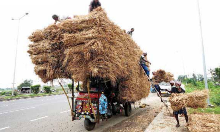
Workers load heaps of straw on an autorickshaw, in Bardhaman.