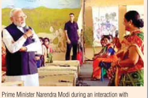
Prime Minister Narendra Modi during an interaction with Lakhpati Didis, in Jalgaon, on Sunday