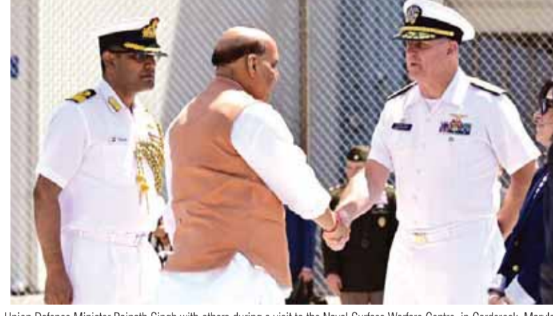
Union Defence Minister Rajnath Singh with others during a visit to the Naval Surface Warfare Centre, in Carderock, Maryland, USA