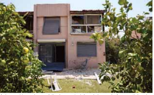
A damaged house is seen following an attack from Lebanon, in Acre, north Israel, on Sunday