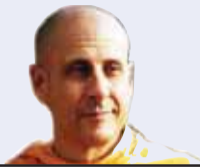
RADHANATH SWAMI MAHARAJ

Understanding and managing stress effectively is essential for a healthier life