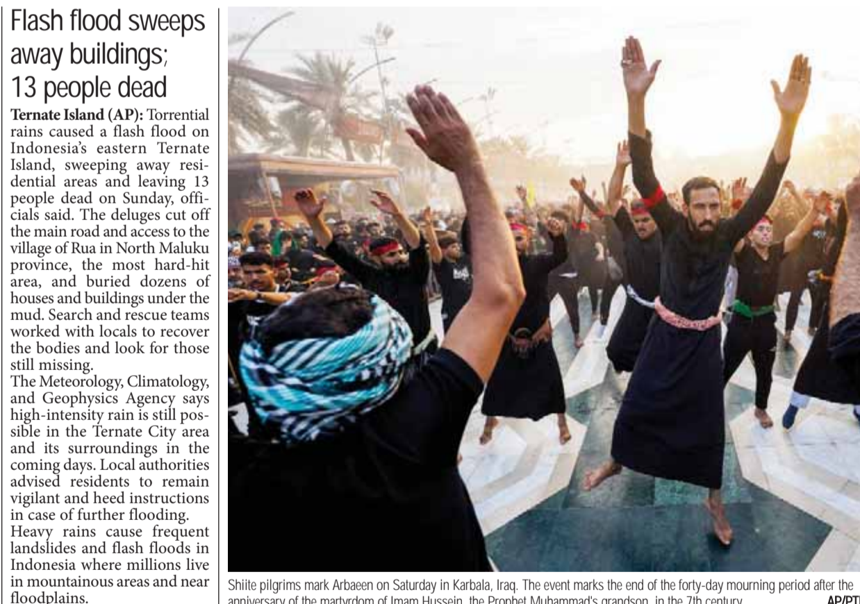
Shiite pilgrims mark Arb'een on Saturday in Karbala, Iraq. The event marks the end of the forty-day mourning period after the anniversary of the martyrdom of Imam Hussein, the Prophet Muhammad's grandson, in the 7th century

Torrential rains caused a flash flood on Indonesia's eastern Ternate Island, sweeping away residential areas and leaving 13 people dead on Sunday, officials said. The deluges cut off the main road and access to the village of Rua in North Maluku province, the most hard-hit area, and buried dozens of houses and buildings under the mud. Search and rescue teams worked with locals to recover the bodies and look for those still missing. The Meteorology, Climatology, and Geophysics Agency says high-intensity rain is still possible in the Ternate City area and its surroundings in the coming days. Local authorities advised residents to remain vigilant and heed instructions in case of further flooding. Heavy rains cause frequent landslides and flash floods in Indonesia where millions live in mountainous areas and near floodplains.