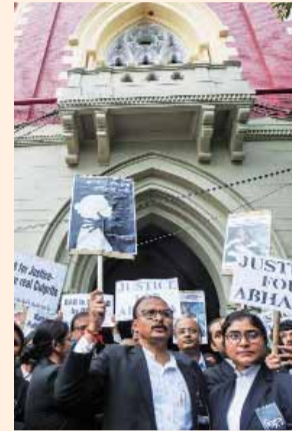
Lawyers of Calcutta High Court stage a protest against alleged sexual assault and murder of a postgraduate trainee doctor, in Kolkata, on Monday