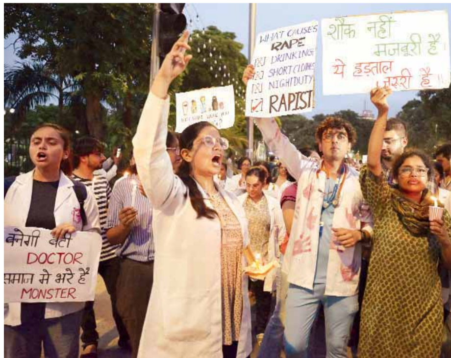
Members of various Resident Doctors' Associations protest during a candle march against the alleged rape and murder of a trainee doctor at Kolkata's RG Kar Medical College and Hospital, at Connaught Place, in New Delhi, on Sunday

"The nation looks to the judiciary as the ultimate guardian of justice, the last