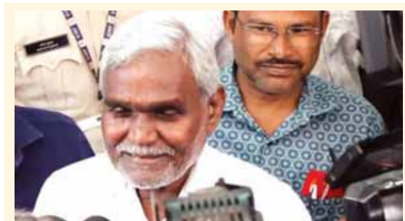
Former Jharkhand Chief Minister Champai Soren speaks with the media upon his arrival at Delhi airport on Sunday

The officials also have asked the former principal of the college as to why the common wall between the bathroom and the seminar hall was pulled down after the incident and why the washbasins and such other things were replaced in a hurry.