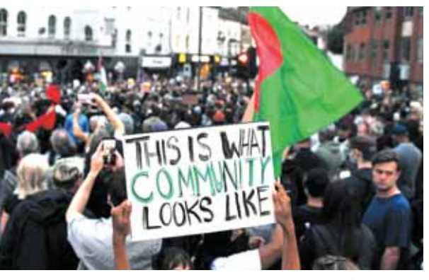
revealed that dawn raids were carried out early on Thursday morning to arrest suspected violent offenders from the past few days. "What I want to make really clear is those we've arrested aren't protesters, patriots or decent citizens. They're thugs and criminals. Around 70 per cent have previous convictions for weapon possession, violence, drugs and other serious offences. Some have football banning orders. These are violent people taking to the streets under the guise of protest to engage in disorder," he said. London Mayor Sadiq Khan thanked people who peacefully stood "united against racism and Islamophobia", as well as the "heroic police force" for working round the clock to

PTI ■ LONDON A massive turnout of anti-racism counter-protesters swarmed the streets of London and other UK cities in an effort to outnumber the far-right violent mobs causing mayhem over the past week, described by Scotland Yard as a "show of unity from communities". Fears of violence at several planned extremist rallies targeting immigration lawyers and agencies across London and other cities on Wednesday evening abated as thousands of specialist police officers patrolled the streets and counter-protesters waving placards reading "Smash Fascism & Racism" and "Stop the far right" turned out in hoards for peace marches. The UK government, however, cautioned that there is intelligence that more far-right action could take place in the next few days even as there was relief that violent disorder was averted overnight. "Last night more than 1,000 officers were deployed across the capital ready to respond to any scenes of disorder. Their efforts and the strength of unity demonstrated by London's communities resulted in a largely peaceful evening," said Metropolitan Police chief Mark Rowley, who