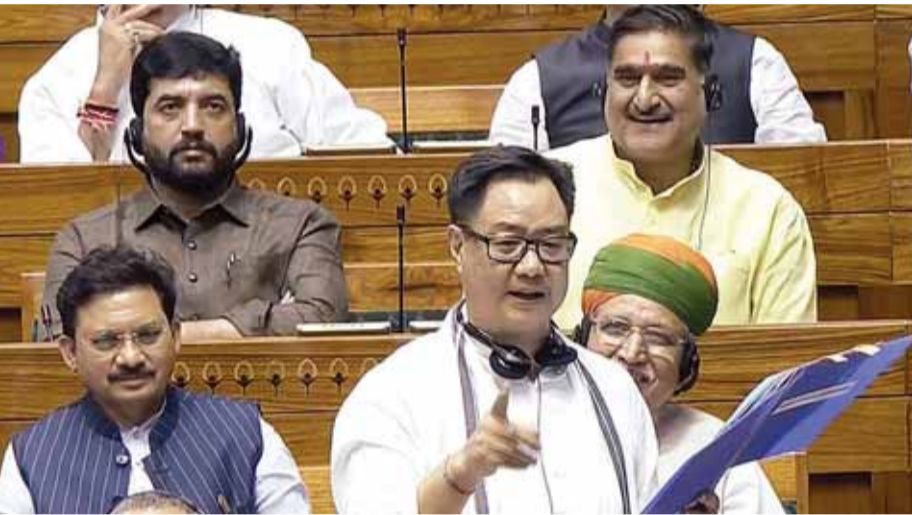
Union Minister Kiren Rijiju speaks in the Lok Sabha during the Monsoon Session of Parliament, in New Delhi, on Thursday