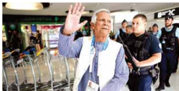
Nobel laureate Muhammad Yunus returns to Bangladesh from Paris to take charge of interim Government