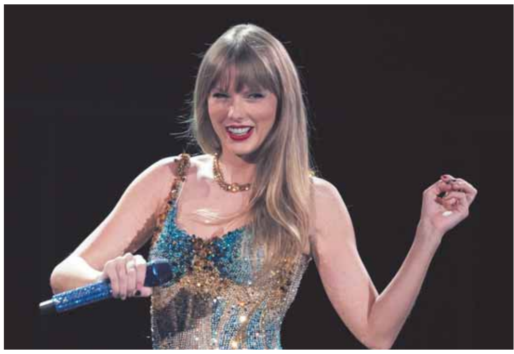
Thursday, Friday and Saturday at the Ernst Happel Stadium, which sat empty Thursday morning aside from media filming outside. Security officials and the organisers of the concerts, Barracuda Music, were in close contact about whether to cancel the three concerts, but in the end it was the organizer who made the call.