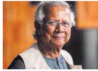
Stating that the work by Yunus, globally recognised as 'The Father of Microfinance' has not just inspired similar projects in Philippines, Indonesia and Pakistan but their respective founders too received the Ramon Magsaysay Award. The 2006 Nobel Peace Prize was awarded for his work in poverty alleviation and the empowerment of poor women through Grameen Bank where Yunus has 'successfully melded capitalism with social responsibility' through the microcredit institution. Born in pre-Independence India in 1940 in Chittagong, Yunus first studied at Dhaka University in Bangladesh, which was then East Pakistan; went as a Fulbright