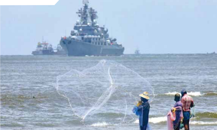
Fishermen cast their nets in the Arabian sea, at the Kochi coast PTI