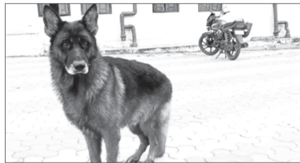
the Odisha Police K9 squad deployed with Brahmapur police named "Storm" along with a team comprising one inspector, two sub-inspectors and a trainer of the K9 dog left for