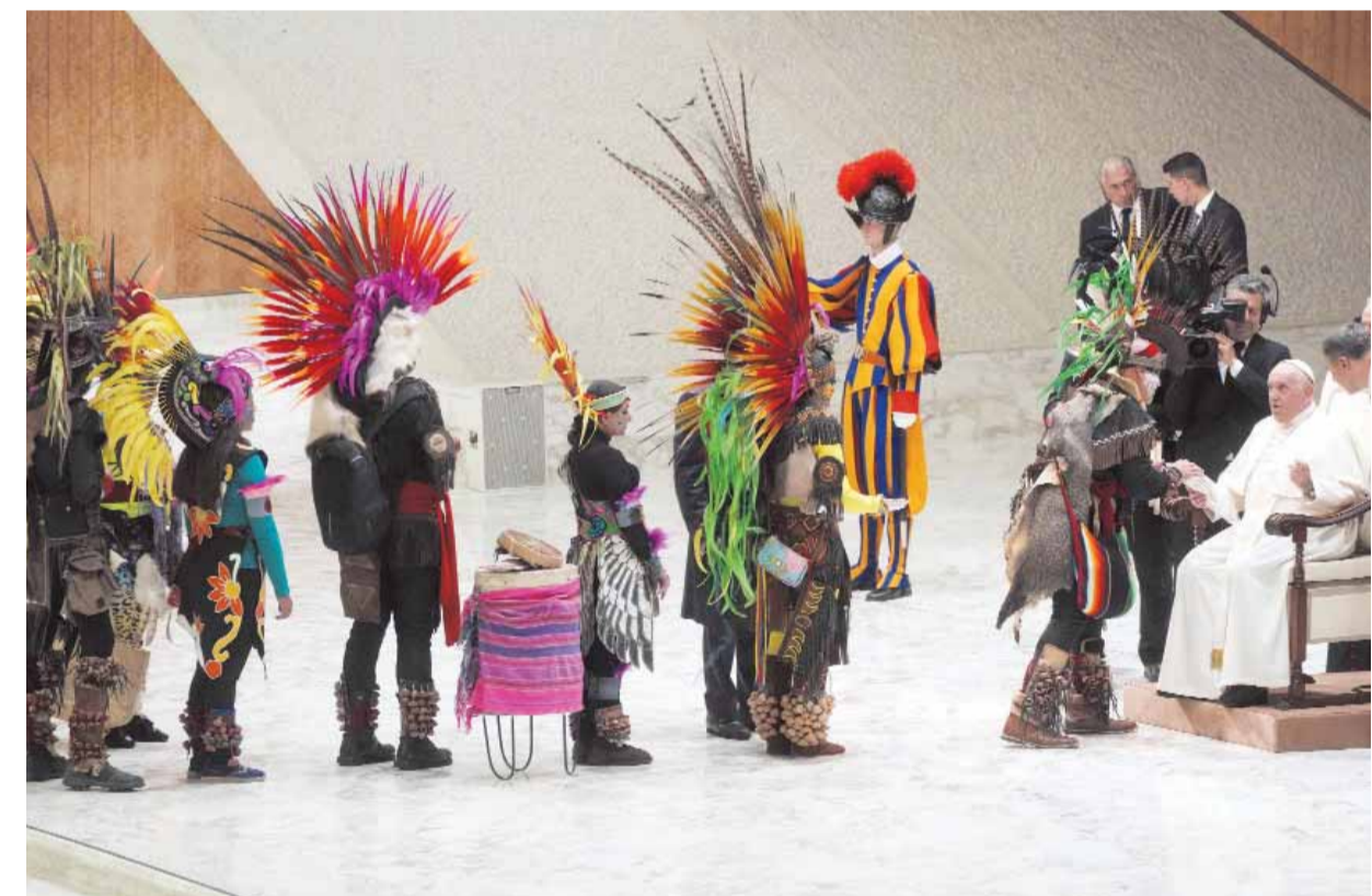
A group of Mexican faithful wearing traditional costumes meet with Pope Francis attends the weekly general audience in the Paul VI hall at the Vatican on Wednesday.

service to and from the space station, after the shuttles retired in 2011. NASA signed contracts worth billions with both companies in order to have a backup in case one of them got sidelined by an accident. SpaceX launched its first crew in 2020; the upcoming flight will be its 10th astronaut flight for NASA. It's also sent a few private crews into orbit. Boeing has had to overcome multiple Starliner problems over the years. The company had to launch an empty Starliner twice before committing to a crew, repeating the initial flight test because of bad software and other issues. The delays have cost the company more than $1 billion.