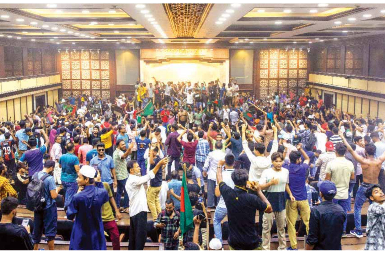
People in Dhaka celebrate the downfall of the Sheikh Hasina-led Bangladesh Government

PIONEER NEWS SERVICE ■ NEW DELHI The Vishva Hindu Parishad (VHP) on Tuesday urged the government to take "every possible" step to ensure the safety of Hindus, Sikhs and other minorities in Bangladesh, claiming that "fundamentalists" are targeting them in several districts of the neighbouring country. Addressing a press conference,