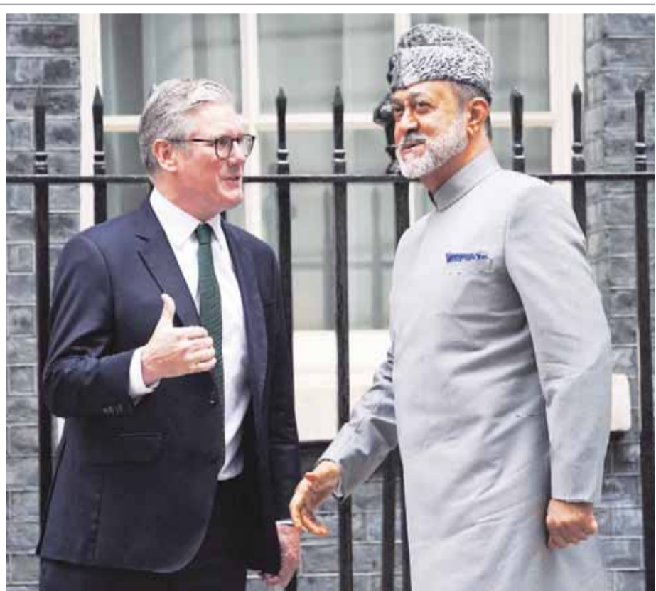
Britain's Prime Minister Keir Starmer welcomes Sultan Haitham bin Tariq Al Said, the Sultan of Oman to 10 Downing Street in London on Tuesday.

"Because of security concerns, US Embassy personnel in Bangladesh are subject to some movement and travel restrictions. The US government may have limited ability to provide emergency services to US citizens in Bangladesh due to these travel restrictions, a lack of infrastructure, and limited host government emergency response resources," it added.