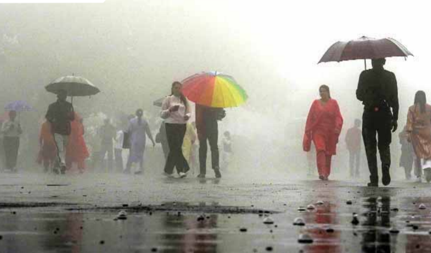
People walk to their work as torrential rains lash Shimla