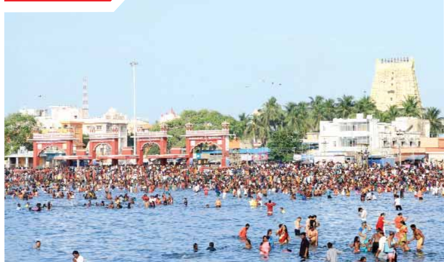
People take a dip before performing rituals on the occasion of 'Aadi Amavasai', in Rameshwaram