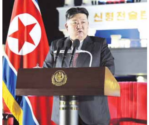
In this photo provided by the North Korean government, Kim Jong Un speaks during a ceremony to mark the delivery of 250 nuclear-capable missile launchers to frontline military units, in Pyongyang, North Korea, on Sunday

North Korea marked the delivery of 250 nuclear-capable missile launchers to frontline military units at a ceremony where leader Kim Jong Un called for a ceaseless expansion of his military's nuclear program to counter perceived US threats, state media said on Monday. Concerns about Kim's nuclear program have grown as he has demonstrated an intent to deploy battlefield nuclear weapons along the North's border with South Korea and authorised his military to respond with preemptive nuclear strikes if it perceives the leadership as under threat. North Korea's official Korean Central News Agency said the launchers were freshly produced by the county's munitions factories and designed to fire "tactical" ballistic missiles, a term that describes systems capable of delivering lower-yield nuclear weapons. Kim said at Sunday's event in Pyongyang the new launchers would give his frontline units "overwhelming" firepower over South and make the operation of tactical nuclear weapons more practical and efficient. State media photos showed lines of army-green launcher trucks packing a large street with seemingly thousands of spectators attending the event, which included fireworks. North Korea has been expanding its lineup of mobile short-