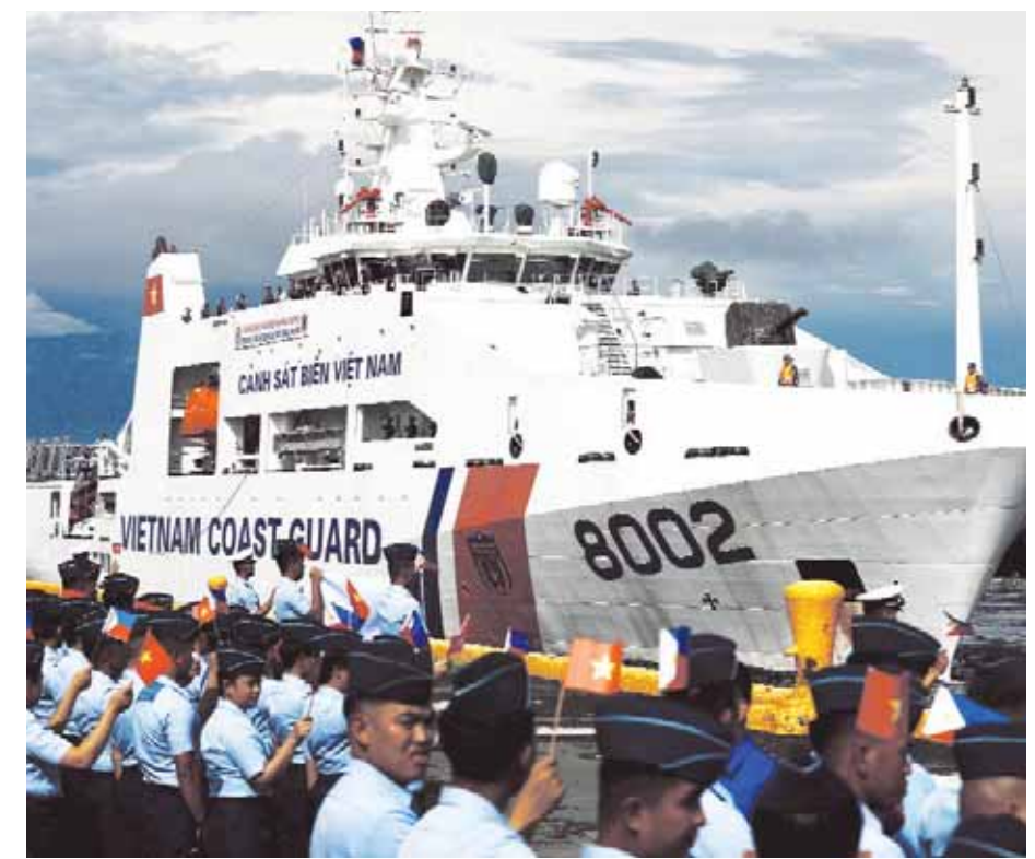
Manila : Philippine Coast Guard personnel wave flags as the Vietnam Coast Guard CSB-8002 patrol ship makes a port call at the Port of Manila, Philippines, 05 August 2024. Philippine and Vietnam coastguards will conduct joint maritime exercises in the disputed South China sea to foster mutual understanding and enhanced cooperation between the two nations