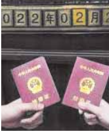
China's population reported its first decline in six decades in 2022 after the birth rate hit a new low, resulting in decades of the child policy pursued vigorously by the ruling Communist Party of China (CPC) to control population growth, with experts predicting a steeper decline in the coming years.

registrations since 2014 was attributed to a decrease in the young population, the gender imbalance with more men than women among the marriageable population, the postponement of the age of first marriage, high costs of getting married, and changing attitudes toward marriage. He said the continued decline in the number of marriage registrations in 2024 indicates that the number of new-borns will go downward again in 2025. Due to factors such as the decrease in the young population and low child-birth intentions, the declining trend in China's birth rate, in the long run, will be difficult to fundamentally change unless substantial childbirth support policies are implemented in the future to address this challenge, the report quoted him as saying. China's population continued to decline as the overall population fell by 20.8 lakh last year to 140.97 crore, down from 141.18 crore in 2022, as India overtook China to become the most populous country in the world in 2023, according to official data released early