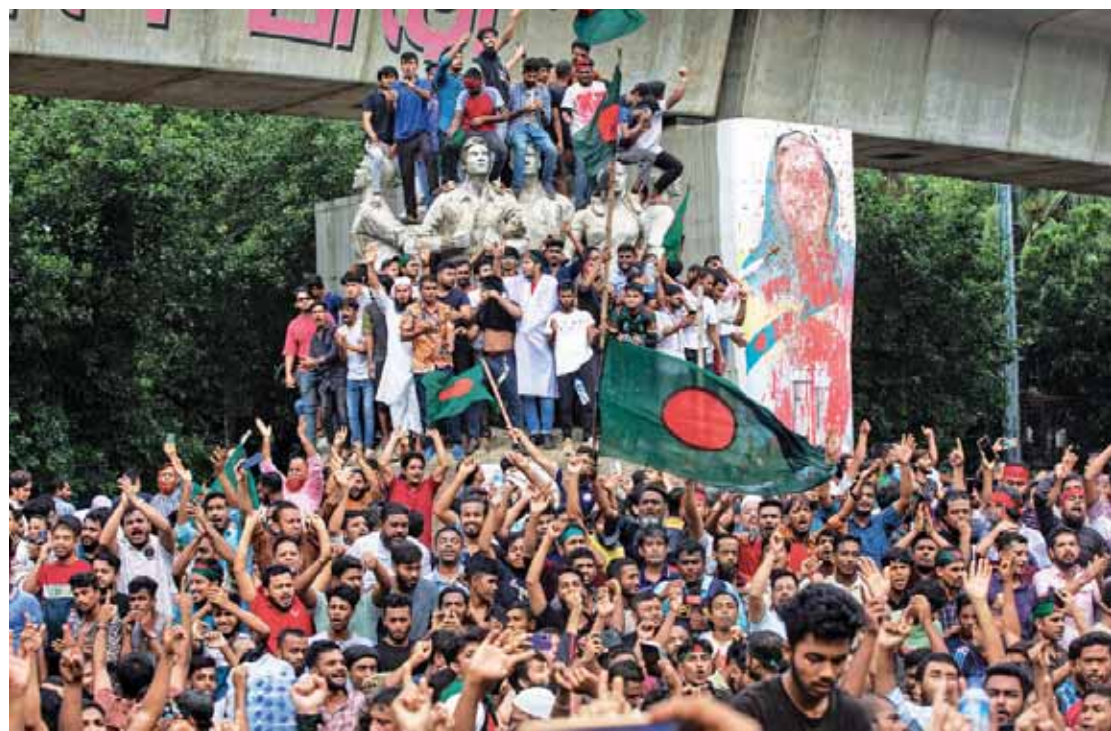
Protesters climb a public monument as they celebrate after getting the news of Prime Minister Sheikh Hasina's resignation, in Dhaka, Bangladesh. (Right top) Sheikh Hasina