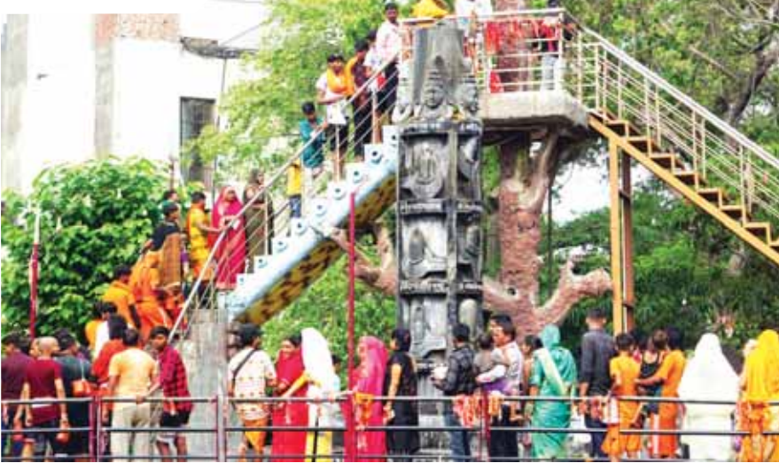
Devotees stand in queue to offer prayers on the occasion of Shivratri, in New Delhi