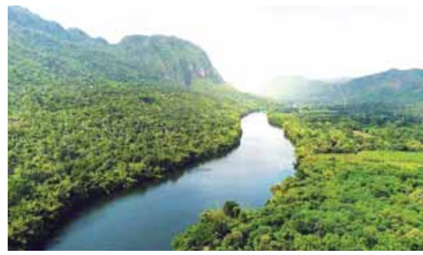
This ambitious project also aims to offer new opportunities for local communities and wildlife as CPSUs will manage water bodies within leasehold areas, while District Collectors will handle the water bodies

Mines, G Kishan Reddy after releasing comprehensive guidelines for the programme said that effectively utilizing mine water addresses the ecological impacts of mining by transforming a potential challenge into an opportunity for positive change. "This innovative approach includes various strategies, such as empowering self-help groups (SHGs) to operate floating restaurants on water-filled mine-pits. These floating restaurants provide new economic opportunities for local communities while enhancing local tourism," he added.