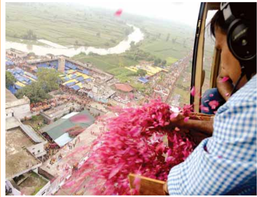
A helicopter showers flower petals on 'Kanwariyas', at Pura Mahadev Temple in Baghpatt