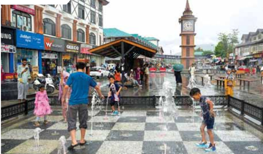
Children play at fountains near Lal Chowk on a rainy day in Srinagar