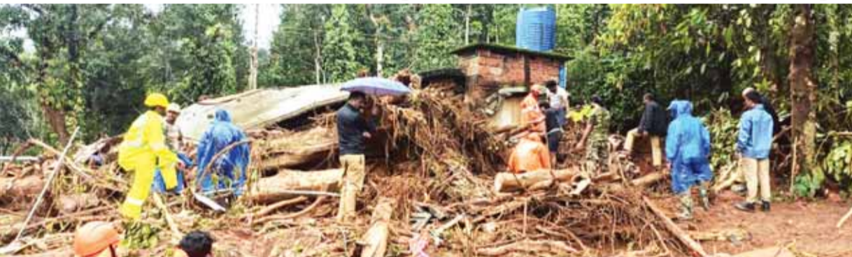
Rescue operation underway following landslides triggered by heavy rain in the hilly areas of Wayanad district, on Wednesday