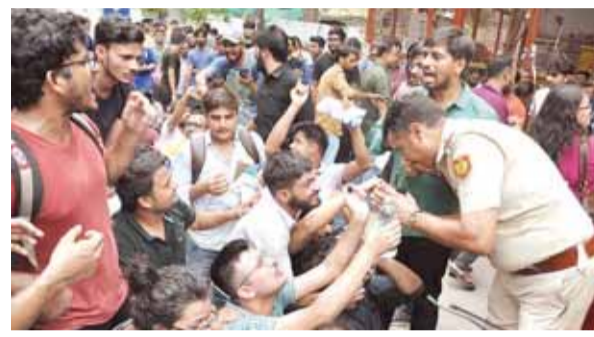
A police personnel interacts with students during a protest over the deaths of three civil services aspirants due to drowning at a coaching centre in Old Rajinder Nagar area, in New Delhi, on Wednesday