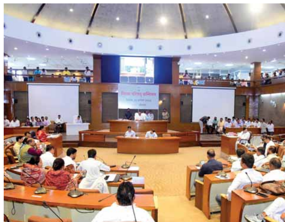
A general view of the BMC council meeting in Bhopal on Friday.

lection is being done in the name of parking in New Market. Action should be taken." During the meeting, uproar was witnessed as BJP Mandal President was alleged to have been involved in illegal collections.