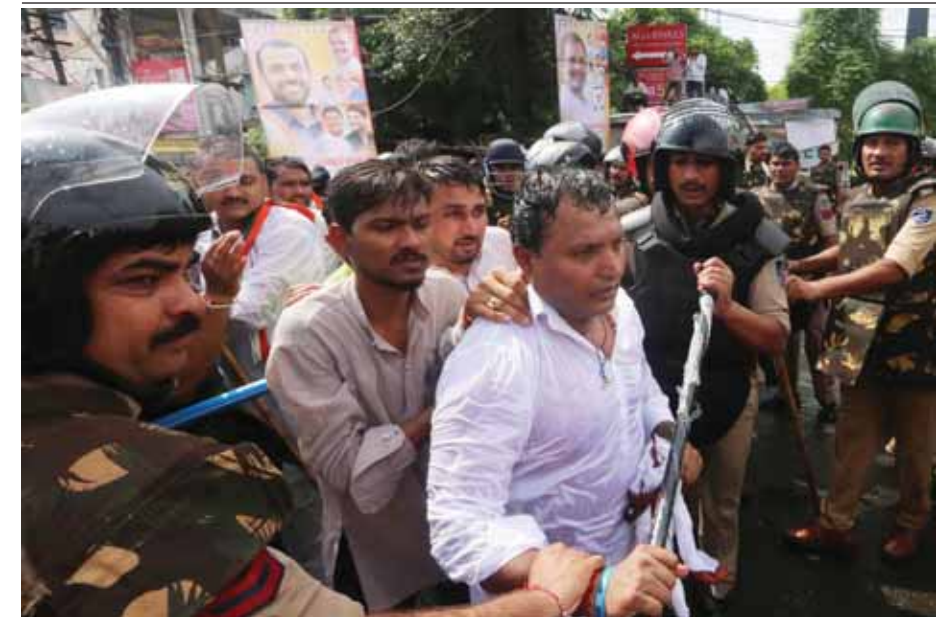
Police detain Youth Congress National President Srinivas BV during a demonstration of Madhya Pradesh Youth Congress activists against increasing unemployment and other issues, in Bhopal on Friday.