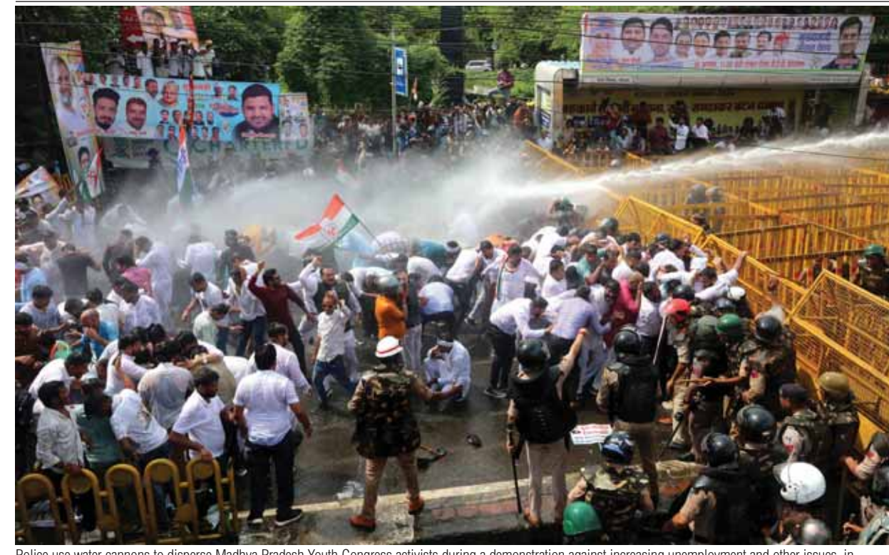
Police use water cannons to disperse Madhya Pradesh Youth Congress activists during a demonstration against increasing unemployment and other issues, in Bhopal on Friday.

forming well in the future. In the program, RNTU Sports Achievers Award was given to the players studying at Rabindranath Tagore University. In this, Vivek Sagar from Hockey Men's Team was given an amount of Rs 5 lakh for bringing laurels to the country at the international level.