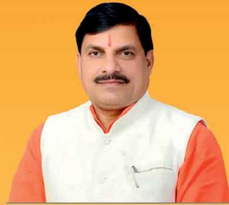
डॉ. मोहन यादव, मुख्यमंत्री