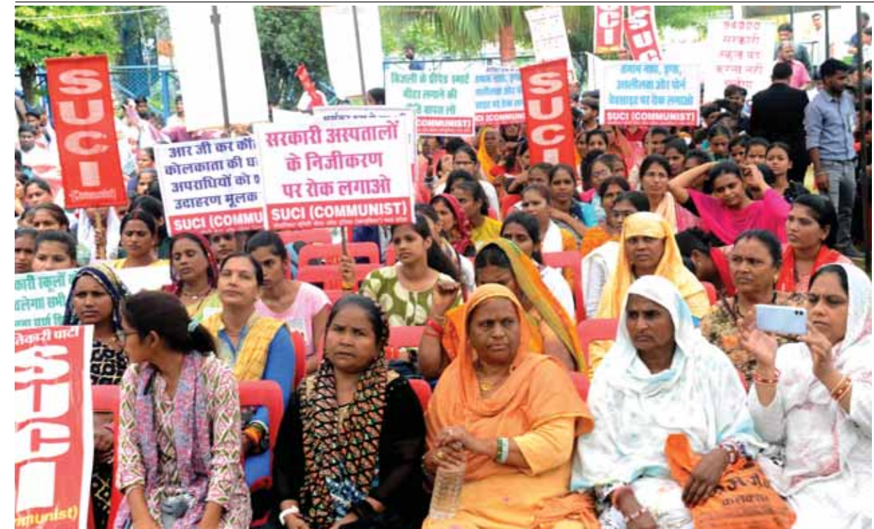
Social Unity Center of India (SUCI) activists stage a protest against the anti-public policies of the State Government, at Neelam Park in Bhopal on Thursday.