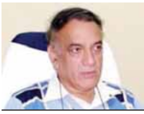
V K BAHUGUNA

The prosperity and progress of a nation hinge on the efficiency of its governance, particularly in upholding the rule of law by those in top constitutional, administrative, and judicial positions. This also involves the transparency and accountability of regulatory regimes across various sectors of law and economy. In our modern era, characterized by freedom, equality, and democracy, many developing countries have emerged from the shadows of colonialism. Despite independence, the remnants of colonialism persist in governance and social structures, and former colonial powers often carry a lingering sense of superiority. This is evident in their interventions in other countries, where they create