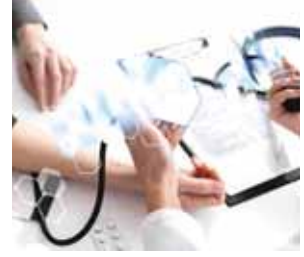
Namoo Gange Trust's features stalls by several State and Central Government Ministries, as well as private

He also emphasised the importance of medicinal plants and announced the Government's goal to raise awareness about their benefits and encourage widespread plantation to make India self-reliant in this sector. After the inauguration, he visited several stalls, including the National Medicinal Plants Board's exhibit, where he gathered insights on various medicinal herbs. The mega expo which is a brain child of