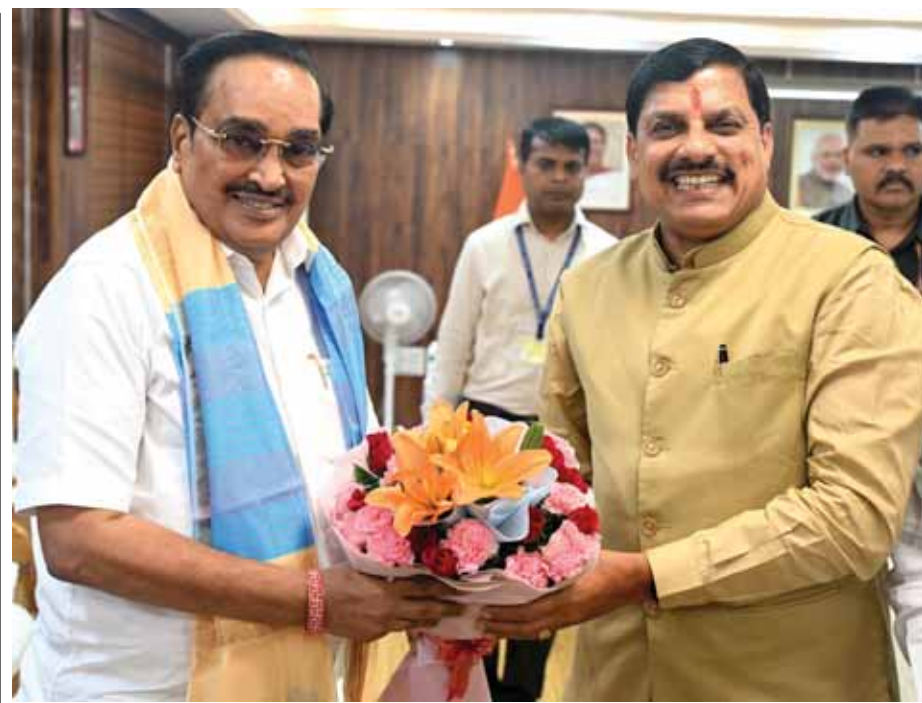
Madhya Pradesh Chief Minister Mohan Yadav with Union Minister for Jal Shakti CR Patil during a meeting in New Delhi on Thursday.

the time limit. The Chief Secretary also directed to continuously monitor the rain situation and arrange relief camps as needed. She said that all departments should be coordinated and prepared to deal with possible disasters. The Chief Secretary said that investment promotion centers have been launched in all the districts of the Gwalior-Chambal division by Chief Minister Dr. Mohan Yadav in Gwalior. In the remaining districts also, centers should be started on a priority basis and nodal officers should be appointed. The Chief Secretary instructed the Collectors to complete the prescribed process of converting Vangrams into Rajasva Grams on priority. She instructed to provide benefits of Kisan Samman Nidhi to the eligible farmers and run a campaign to make Kisan Credit Cards.