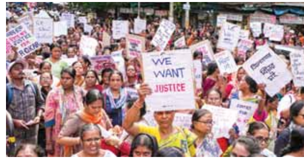
Womens participate in a rally to protest against the alleged rape and murder of a postgraduate trainee doctor, in Kolkata, on Thursday

Police that the place of occurrence had been safely cordoned off because when we reached the place we found no such cordon," said parents of the doctor who was allegedly raped and murdered in the night of August 8, adding, "not only we were kept waiting for more than three hours before we could see the body of our daughter... but also when we reached there we were told by the staff at that hospital that authorities were inspecting the area before which we could not be let in." The mother of the victim said, "They kept us, the parents of