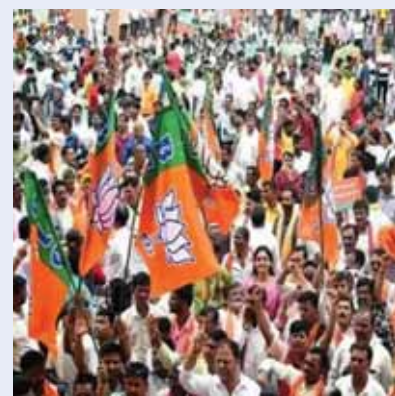
Haryana BJP's State Election Management Committee has logically put forward the view that there is a weekend holiday before the assembly election date on October

1 and there are some holidays after that. INLD has also agreed to postpone the assembly elections. Opposition parties are hell-bent on condemning every aspect of the ruling party. Chief Election Commissioner Rajiv Kumar has expressed concern over low voting percentage where people use long weekend holidays on the day of polling. Shifting the election dates will definitely help in increasing the voting percentage. Earlier also, the dates of elections were changed in Rajasthan, Mizoram and Arunachal Pradesh. Therefore, the change of date is not important but the change of mind of voters will be more meaningful. The election Commission is a statutory independent body and should remain firm on its stand rather than bowing to the political pressure which often times is self serving than for the public good. Yugal Kishore Sharma | Faridabad