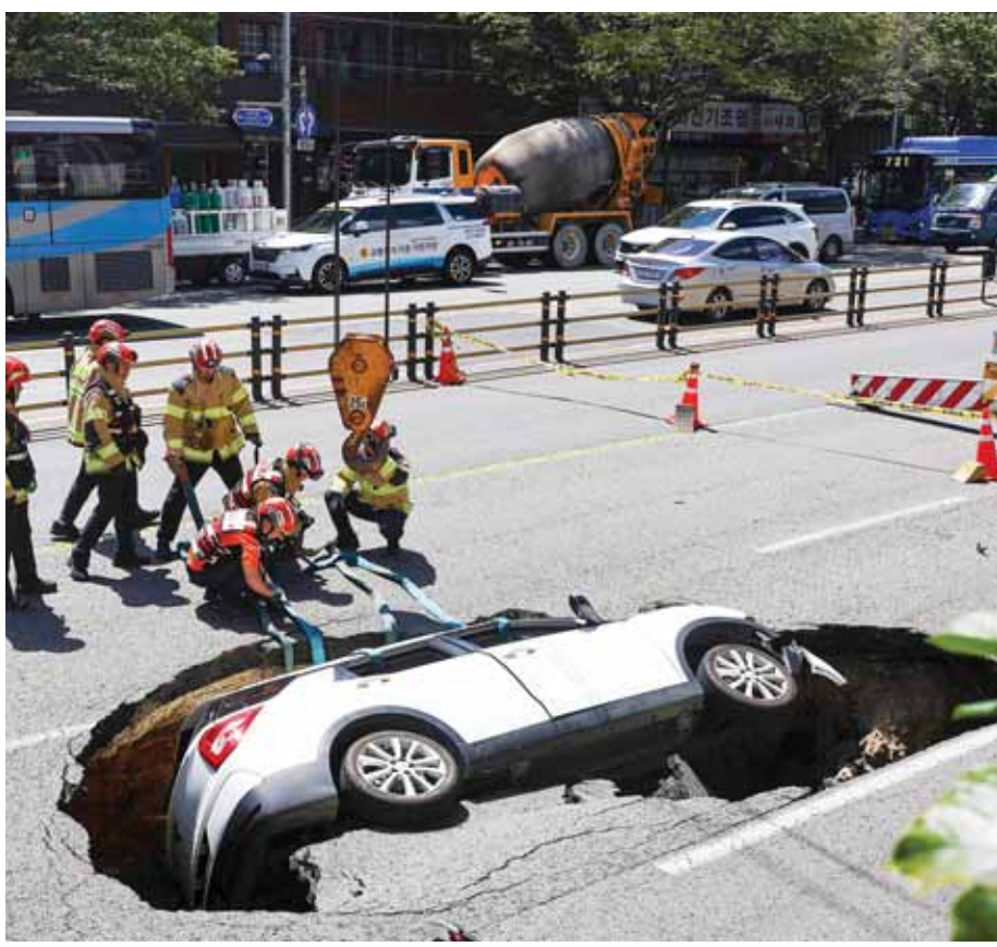
South Korean firefighters prepare to lift a vehicle that fell into a sinkhole on a street in Seoul on Thursday.

Speaking alongside Ukrainian Foreign Minister Dmytro Kuleba, Borrell condemned Russia's attacks on civilians and civilian infrastructure. "Russia wants to bomb a European country into full capitulation," he said. Kuleba said that Ukraine's backers would only have themselves to blame if Russia wins. "The success of Russia depends on one thing: on the preparedness of partners to make bold decisions. If decisions are taken, Ukraine is successful on the ground. If they are not taken, then do not complain on Ukraine, complain on yourself," he said. Kuleba insisted that Ukraine only wants to attack "legitimate military targets" inside Russia. "If we are supplied a sufficient amount of missiles, if we are allowed to strike, we will significantly decrease the capacity of Russia to inflict damage on our critical infrastructure and we will improve the situation of our forces on the ground," he said.