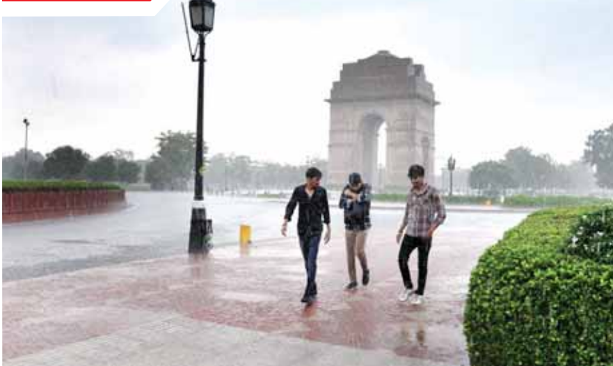
Visitors at India Gate enjoy the rains in New Delhi