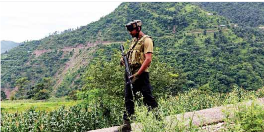
A security personnel keeps vigil during pre-dawn cordon and search operation after reports of suspicious movement, leading to an exchange of fire, in Rajouri district, on Thursday