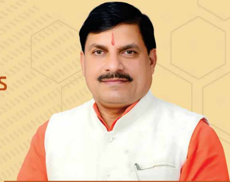
Dr. Mohan Yadav Chief Minister