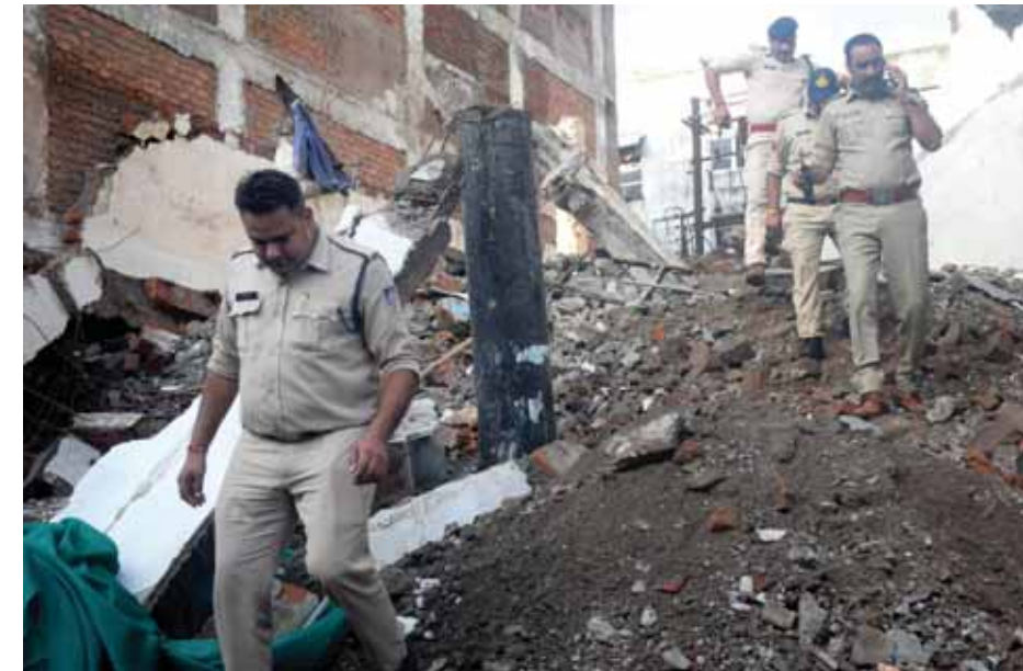
Police investigate the site after a building collapsed while workers were dismantling its portion in MP Nagar zone-2, in Bhopal on Tuesday. Two workers were injured in the incident.