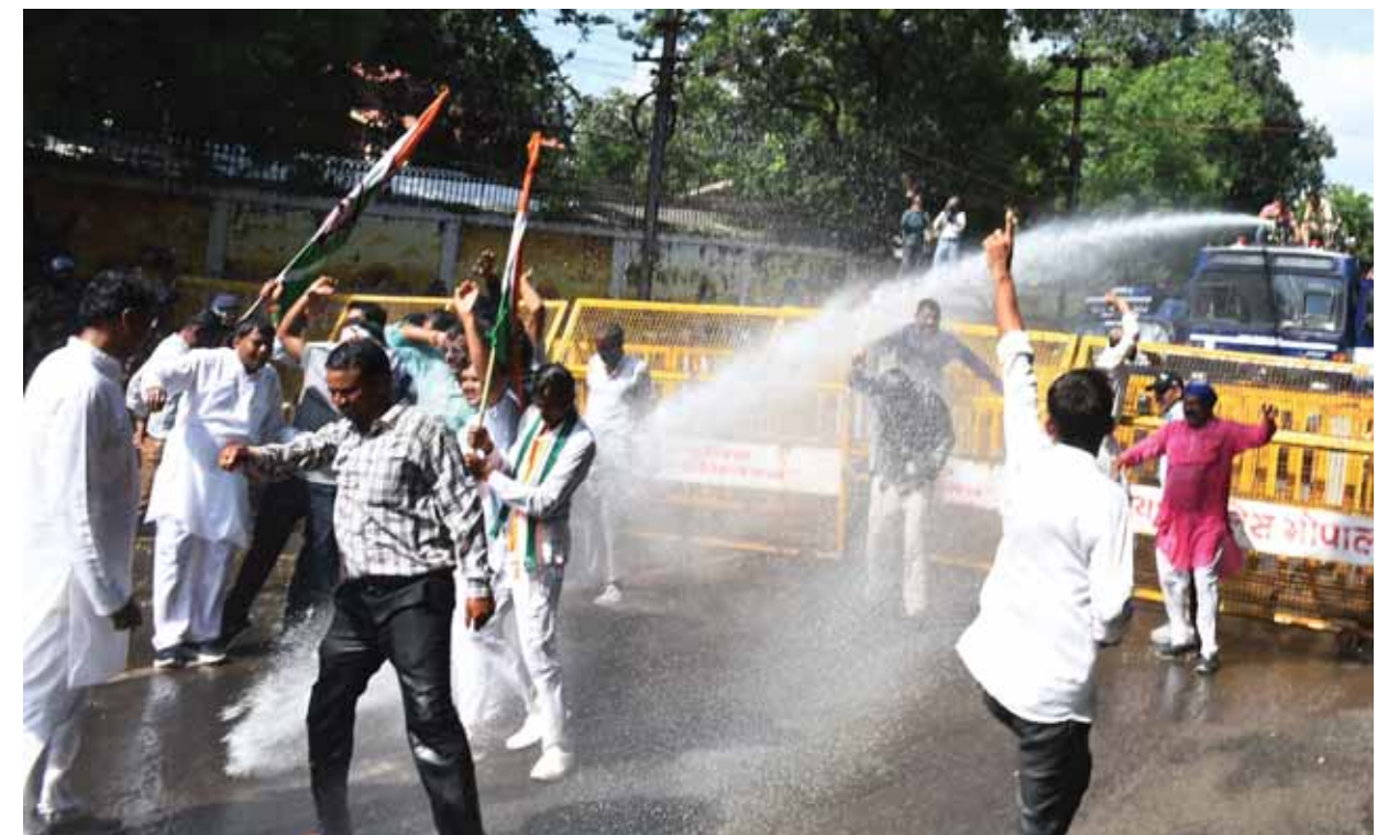
Police use water cannons to disperse Congress SC ST cell workers during a demonstration protesting against the injustice, discrimination and exploitation of Dalits in the BJP led state Government regime, in Bhopal on Tuesday.

industry group is commendable. Its production in the country will reduce our dependence on other countries and increase our self-reliance. He expressed the hope that this industry group will establish more units of non-woven fabric in the state. Chief Minister Yadav also invited TWE-OBT to set-up employment-based units like carpet manufacturing in Madhya Pradesh. Bhopal MP Alok Sharma said that, under Chief Minister Yadav's leadership, industrial activities are growing across the state. The Berasia area of Bhopal, traditionally known for its agricultural focus, is now emerging as an industrial center. Berasia MLA Vishnu Khatri also addressed at the event. Additionally, Jörg Artmeier and Rudra Chatterjee from the Group provided details about their organization's activities.