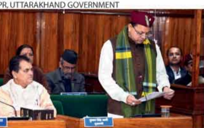
>> CM Pushkar Singh Dhama presiding over a meeting on Anti Copying Law

will facilitate quicker resolution of legal disputes. With a standardised set of laws, courts can process cases more swiftly, as judges will no longer need to interpret varying personal laws. This will significantly reduce the backlog of cases and ensure timely delivery of justice. For instance, disputes over inheritance and property rights, which