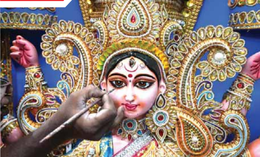
A painter gives final touches to the Goddess Durga's idol ahead of Durga puja, in Kolkata