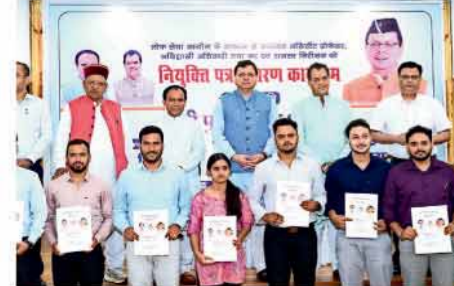
>> CM Dhama distributing appointment letters