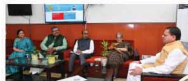
>> CM Pushkar Singh Dhama in discussion with UCC Panel

In a diverse state like Uttarakhand, where differ-