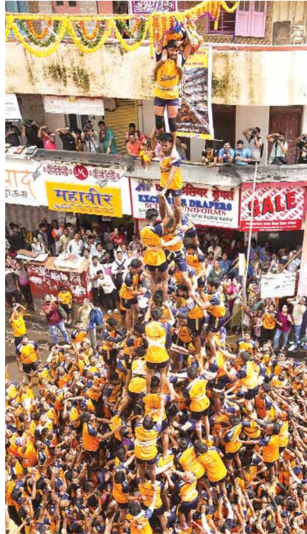
Devotees form a human pyramid to break the 'dahi handi', an earthen pot filled with curd, as part of Janmashtami celebrations, at Dadar, Mumbai, on Tuesday