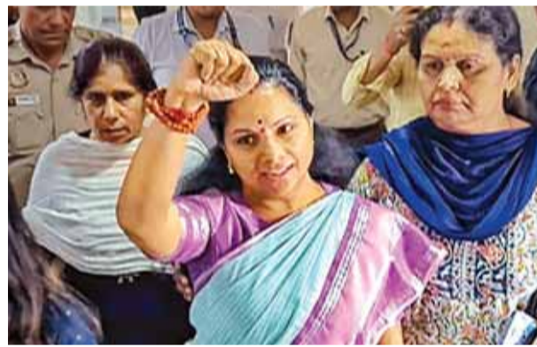
Bharat Rashttra Samithi (BRS) leader Kalvakuntla Kavitha

The controversy over casting couch in the Malayalam film industry took an interesting turn on Tuesday as Mohan Lal, popularly known as the superstar and South Indian Amitabh Bachchan, quit as president of Association of Malayalam Movie Artists (AMMA), the apex body of film stars. All office bearers, including the executive committee members of AMMA, too, submitted their resignation along with Lal as the industry