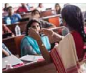
Students in a classroom.