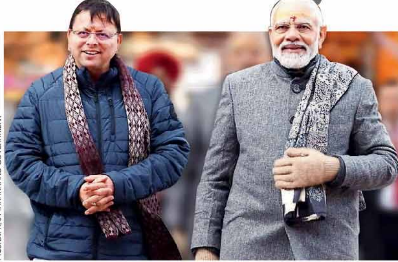
>> Narendra Modi, Prime Minister of India and Pushkar Singh Dhama, CM Uttarakhand

Chief Minister Pushkar Singh Dhama led government, with the vision of bringing uniformity in the society by providing same set of laws regarding marriage, divorce, land, property and inheritance to all people of Uttarakhand - irrespective of their faith - has taken the initiative to implement Uniform Civil Code in the Himalayan state. With CM Dhama announcing to implement UCC before November 9 - the state foundation day - Uttarakhand is on path of becoming the first state of the country, since Independence, to implement UCC. The law that intends to increase social harmony, promote gender justice and empower women, is in compliance with the provisions of Article 44 of the Constitution.