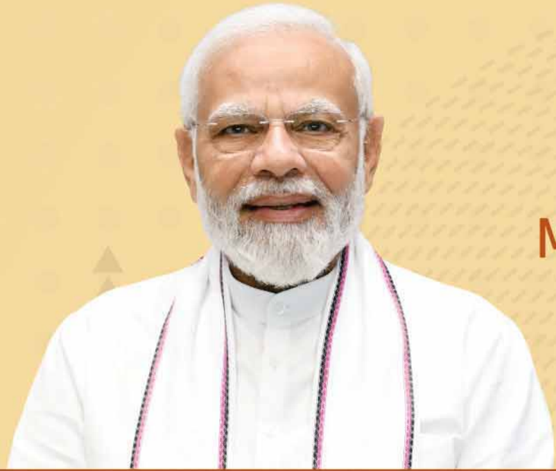
Narendra Modi Prime Minister

Madhya Pradesh Unfolds New Opportunities for Industries