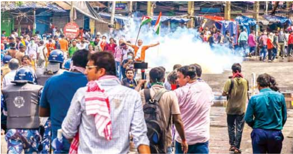
Tear gas shells being used by security personnel to disperse students during their protest march towards West Bengal Secretariat over the alleged sexual assault and murder of a trainee doctor, in Kolkata, on Tuesday

At various places people profusely bleeding from head were seen being carried away by their co-agitators to the hospitals. Similarly the policemen who often got isolated were also attacked. At Babu Ghat a crowd of agitators badly beat up two policemen with lathis, rods, bricks and even shoes. Some even spit on them while