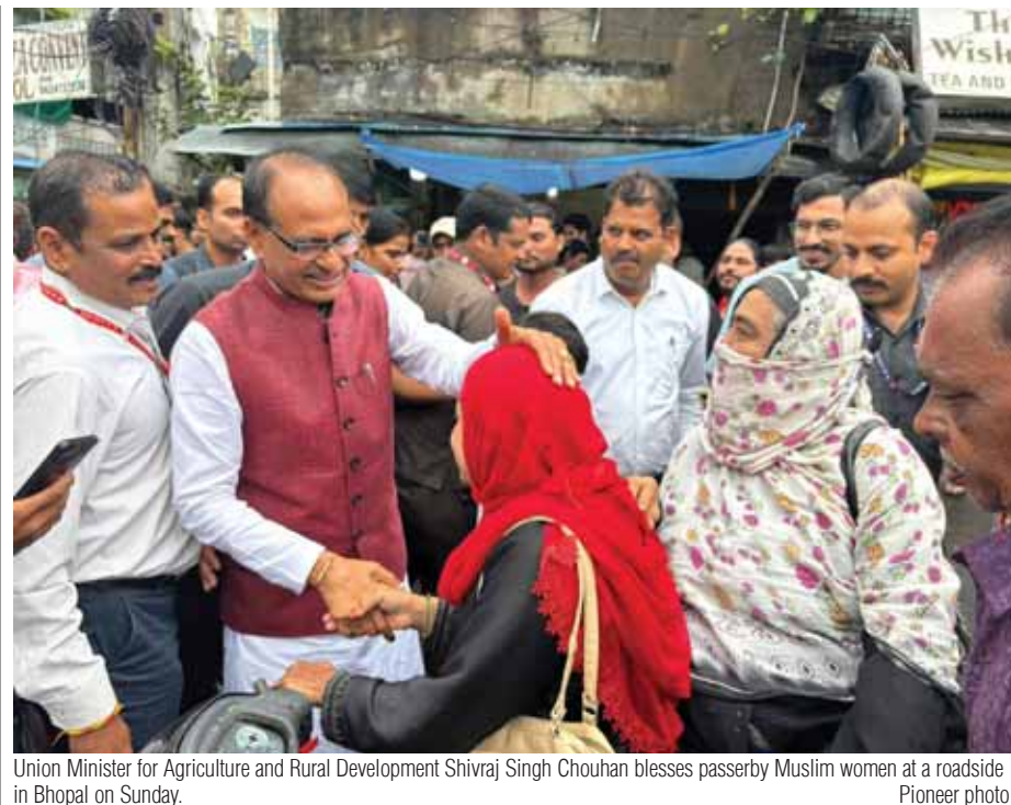
Union Minister for Agriculture and Rural Development Shivraj Singh Chouhan blesses passerby Muslim women at a roadside in Bhopal on Sunday.