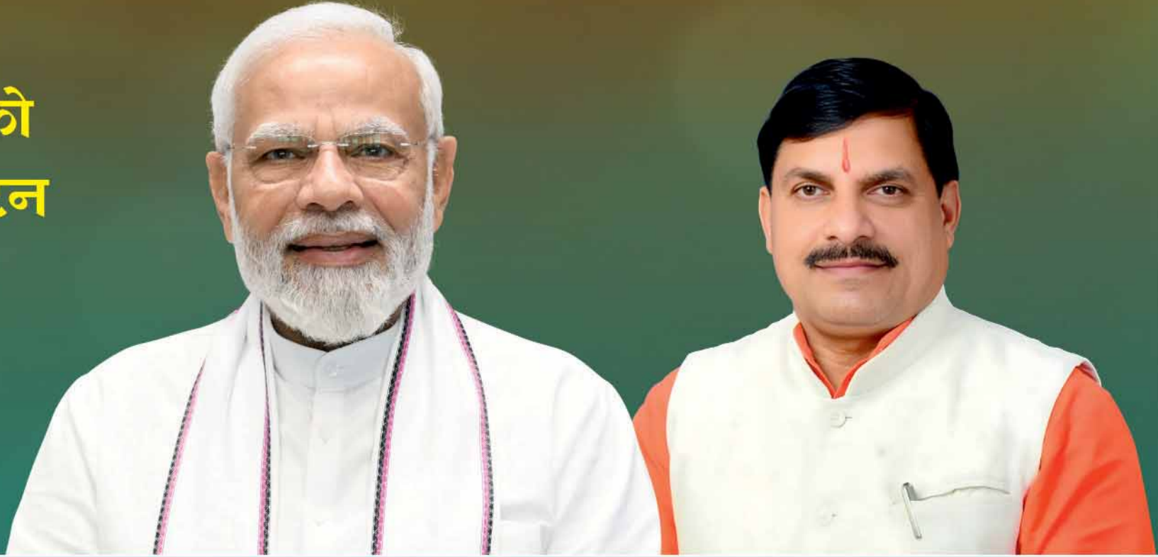
नरेन्द्र मोदी, प्रधानमंत्री