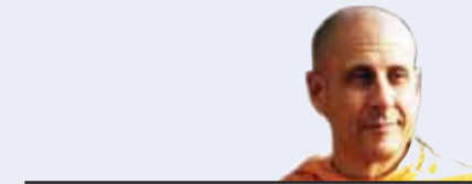
RADHANATH SWAMI MAHARAJ