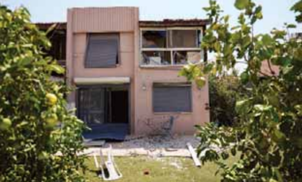
A damaged house is seen following an attack from Lebanon, in Acre, north Israel, on Sunday