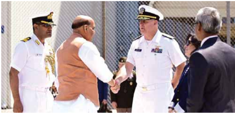
Union Defence Minister Rajnath Singh with others during a visit to the Naval Surface Warfare Centre, in Carderock, Maryland, USA