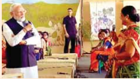
Prime Minister Narendra Modi during an interaction with Lakhpati Didis, in Jalgaon, on Sunday