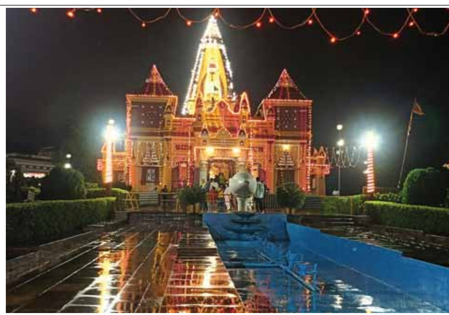
Laxmi Narayan Birla Temple decorated with lighting on the eve of Janmashtami festival in Bhopal on Sunday.