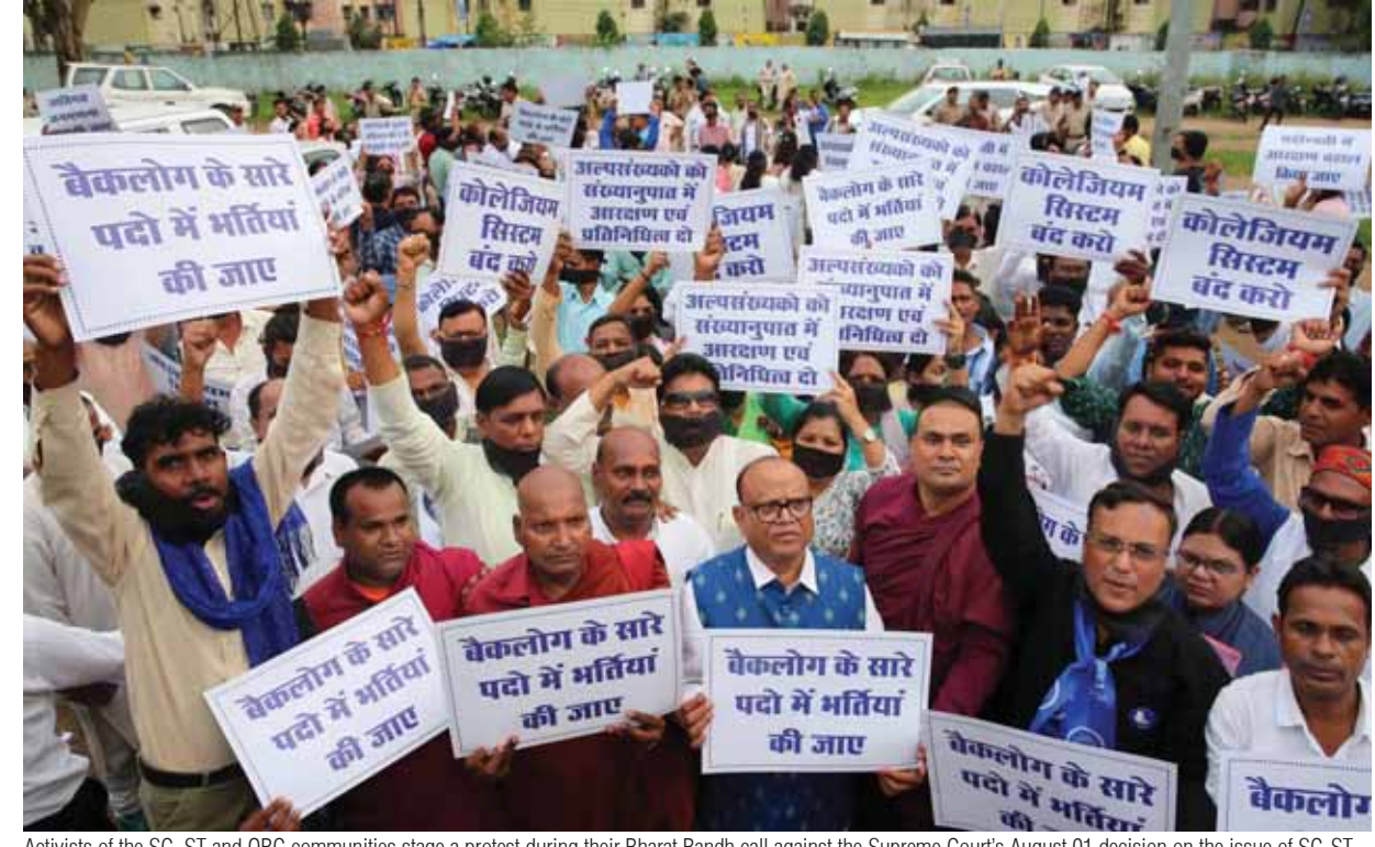
Activists of the SC, ST and OBC communities stage a protest during their Bharat Bandh call against the Supreme Court's August 01 decision on the issue of SC-ST reservation, in Bhopal on Wednesday.