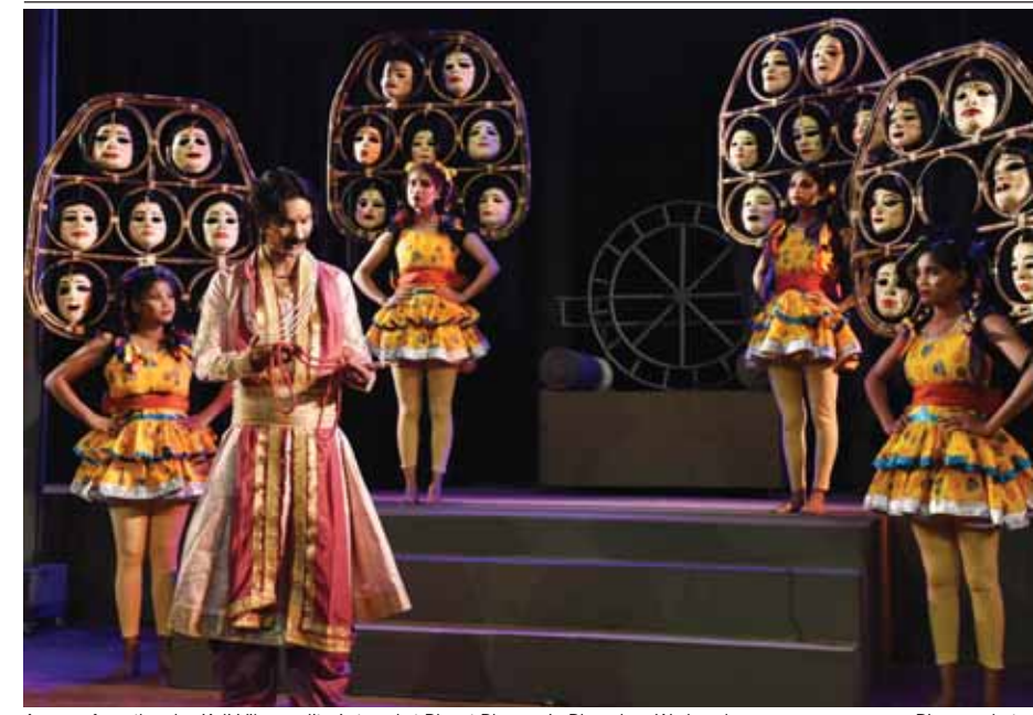
A scene from the play 'Adi Vikramaditya' staged at Bharat Bhawan in Bhopal on Wednesday.