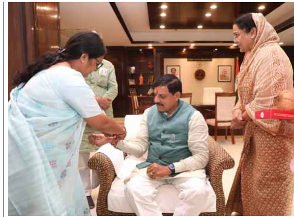
Union Minister of State for Women and Child Development Savitri Thakur and BJP MP Sandhya Rai tie rakhi to Madhya Pradesh Chief Minister Mohan Yadav at State Mantralaya in Bhopal on Wednesday.

resume their duties immediately so that patient care services are normalized. According to a release from the Office of the Director, AIIMS, "The undersigned along with the entire AIIMS family stands behind the cause of the safety of all healthcare professionals at AIIMS New Delhi & across the Country. However, as doctors, our supreme duty is also to ensure that the patients visiting our portals do not go unattended." Members of Resident Doctors' Association from major hospitals in Delhi, along with the Federation of Resident Doctors' Associations (FORDA) and the Federation of All India Medical Associations (FAIMA), have been on an indefinite strike.