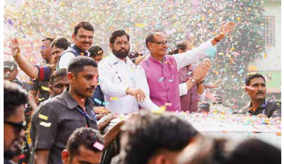
Union Minister for Agriculture and Rural Development Shivraj Singh Chouhan with Maharashtra Chief Minister Eknath Shinde and Deputy Chief Minister Devendra Fadnis in a rally during Krishna Mahotsav at Parli Vajinath, Beed district Maharashtra on Wednesday.