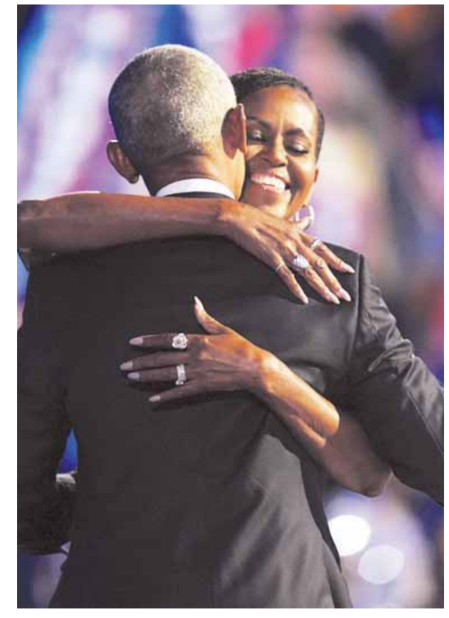
Former President Barack Obama hugs former first lady Michelle Obama as he is introduced during the Democratic National Convention Tuesday, in Chicago.

Underlining that point, Pezeshkian immediately posted an image online with him standing next to Iran's judiciary chief, a Shiite cleric, and the country's parliament speaker, a hard-liner he once faced in the election. "Consensus for Iran," he wrote in the caption. Among those in Pezeshkian's new Cabinet is Abbas Araghchi, 61, a career diplomat who will be Iran's new foreign minister. Araghchi was a member of the Iranian negotiating team that reached a nuclear deal with world powers in 2015 that capped Tehran's nuclear programme in return for the lifting of sanctions. In 2018, then-President Donald Trump pulled the US out of the deal and imposed more sanctions on Iran. Pezeshkian said during his presidential campaign that he would try to revive the nuclear deal. The candidate who received the most support from lawmakers was the country's new defence minister, Aziz Nasirzadeh, who received 281 votes out of 288 present lawmakers.