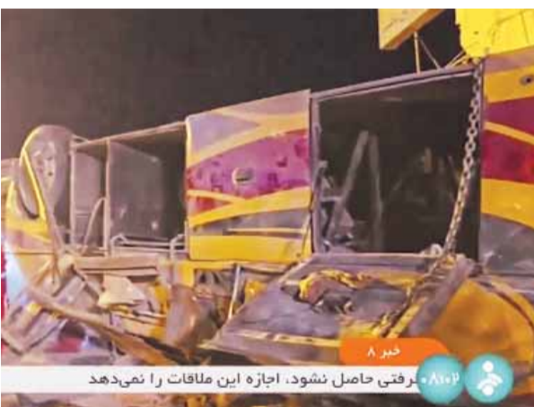
This image taken from a video released by Iranian state television shows the aftermath of a bus crash near Taft, Iran, early Wednesday. A bus carrying Shiite pilgrims from Pakistan to Iraq crashed in central Iran, killing multiple people, an official said Wednesday.