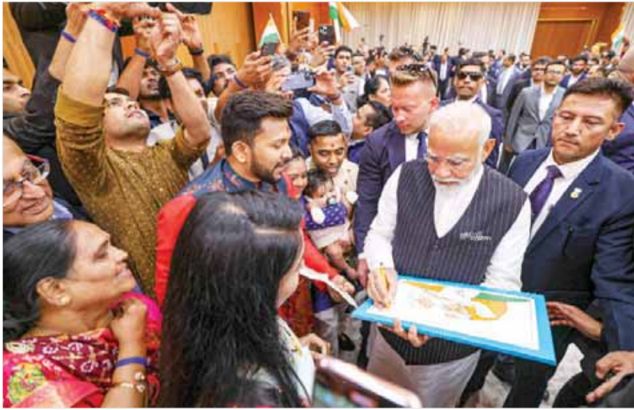
Prime Minister Narendra Modi gives his autograph on a portrait presented to him by the Indian community members upon his arrival at a hotel, in Warsaw, Poland, on Wednesday.

Prime Minister Narendra Modi on Wednesday said he was looking forward to sharing perspectives with President Volodymyr Zelenskyy on a peaceful resolution of the Ukraine conflict. The Prime Minister's comments came on Wednesday shortly before he embarked on a two-nation trip to Poland and Ukraine. Modi on Wednesday said his maiden visit to Poland will add momentum to the bilateral friendship and benefit the people of the two countries as he arrived here on the first leg of his two-nation visit during which he will also travel to the Ukrainian capital Kyiv. Modi, who will meet Poland's President Andrzej Sebastian Duda and hold bilateral talks with Prime Minister Donald Tusk, said he was looking forward to the various programmes in the Polish capital here. "Landed in Poland. Looking forward to the various programmes here. This visit will add momentum to the India-Poland friendship and benefit the people of our nations," Modi said in a post on X soon after his arrival at the Warsaw military airport here. On the first leg of the visit, Modi is visiting Polish capital city of Warsaw on August 21