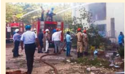
Firefighters douse a fire which broke out following an explosion in a reactor pharma unit of pharmaceutical company Escientia, in Anakapalle, Andhra Pradesh, on Wednesday.

Assembly on Tuesday, nearly two months after she left Congress. She represented the Tosham seat in the Haryana Assembly. The by-poll for the lone Rajya Sabha seat in Haryana was necessitated after Congress leader Deepender Singh Hooda was elected to the Lok Sabha from Rohtak. His Rajya Sabha term was to end in April 2026. In Jaipur, Union Minister Ravneet Singh Bittu filed his nomination as a BJP candidate for the Rajya Sabha by-poll from Rajasthan. He was accompanied by Chief Minister Bhajanlal Sharma, Deputy Chief Ministers Premchand Bairwa and Diya Kumari, and Parliamentary Affairs Minister Jogaram Patel. Before submitting his nomination paper, Bittu, during a meeting of the BJP Legislature Party, expressed gratitude for his selection as the Rajya Sabha candidate from Rajasthan. Rajasthan has a total of 10 Rajya seats, one of which is vacant.