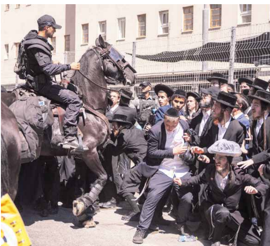
Israeli police officers scuffle with ultra-Orthodox Jewish men during a protest against a potential new draft law which could end their exemptions from military service in Jerusalem, Wednesday.

of Aden. A Liberian-flagged oil tanker came under a particularly intense series of attacks, beginning August 8, likely carried out by the rebels. A similar attack happened Aug. 13 as well. As Iran threatens to retaliate against Israel over the assassination of Hamas leader Ismail Haniyeh in Tehran, the US military told the USS Abraham Lincoln aircraft carrier strike group to sail more quickly to the area. America also has ordered the USS Georgia guided missile submarine into the Mideast, while the USS Theodore Roosevelt aircraft carrier strike group was in the Gulf of Oman. Additional F-22 fighter jets have flown into the region and the USS Wasp, a large amphibious assault ship carrying F-35 fighter jets, is in the Mediterranean Sea.