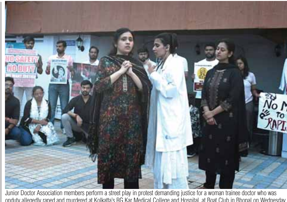
Junior Doctor Association members perform a street play in protest demanding justice for a woman trainee doctor who was on duty allegedly raped and murdered at Kolkatta's RG Kar Medical College and Hospital, at Boat Club in Bhopal on Wednesday.