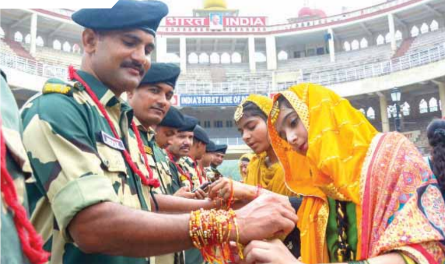
Women tie 'rakhi' on wrists of BSF personnel on the occasion of Rakshabandhan at Attari-Wagah Border, Amritsar