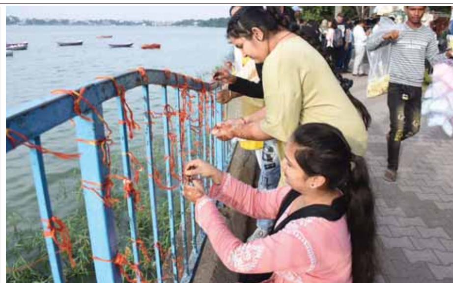
People tie Raksha Sutra at the banks of Upper Lake (Bhoj Wetland's Ramsar Site) for the conservation of Lake on the occasion of Raksha Bandhan festival in Bhopal on Monday.