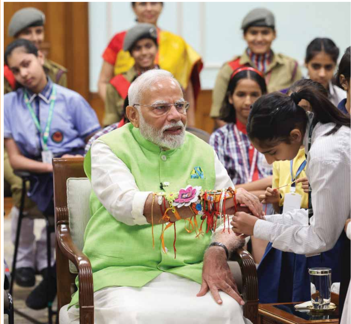
Prime Minister Narendra Modi during Raksha Bandhan celebration with schoolchildren, in New Delhi, on Monday