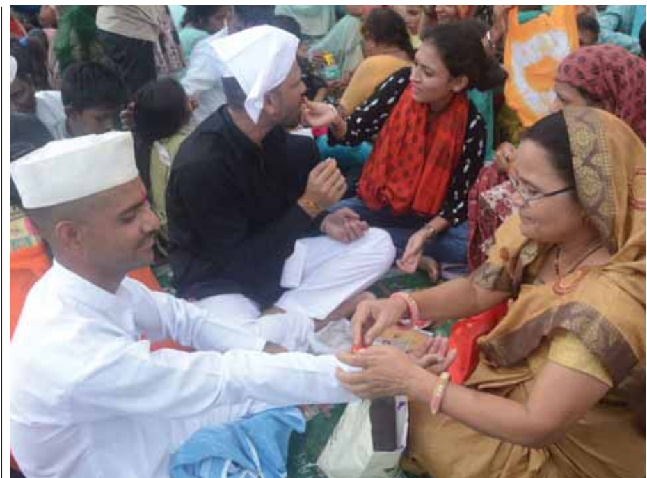
Women tie Rakhis to their jailed brother inmates inside Central Jail on the occasion of Raksha Bandhan festival in Bhopal on Monday.