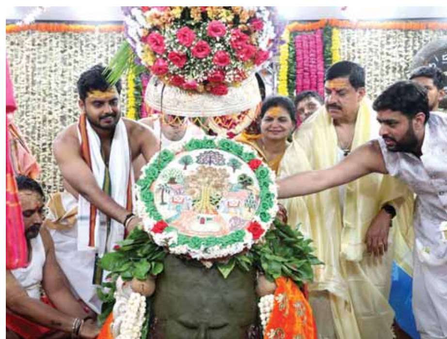
Madhya Pradesh Chief Minister Mohan Yadav presents a huge Rakhi to Lord Mahakal on the last Monday during the holy month of Shravan and on the occasion of Raksha Bandhan festival in Ujjain, Madhya Pradesh on Monday.