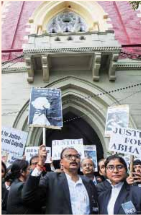
Lawyers of Calcutta High Court stage a protest against alleged sexual assault and murder of a postgraduate trainee doctor, in Kolkata, on Monday