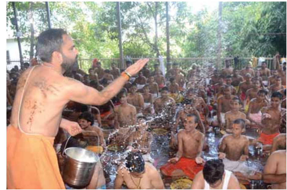
Brahmins perform Shrivani Upkarma rituals on the occasion of Raksha Bandhan festival at Gufa Mandir in Bhopal on Monday.