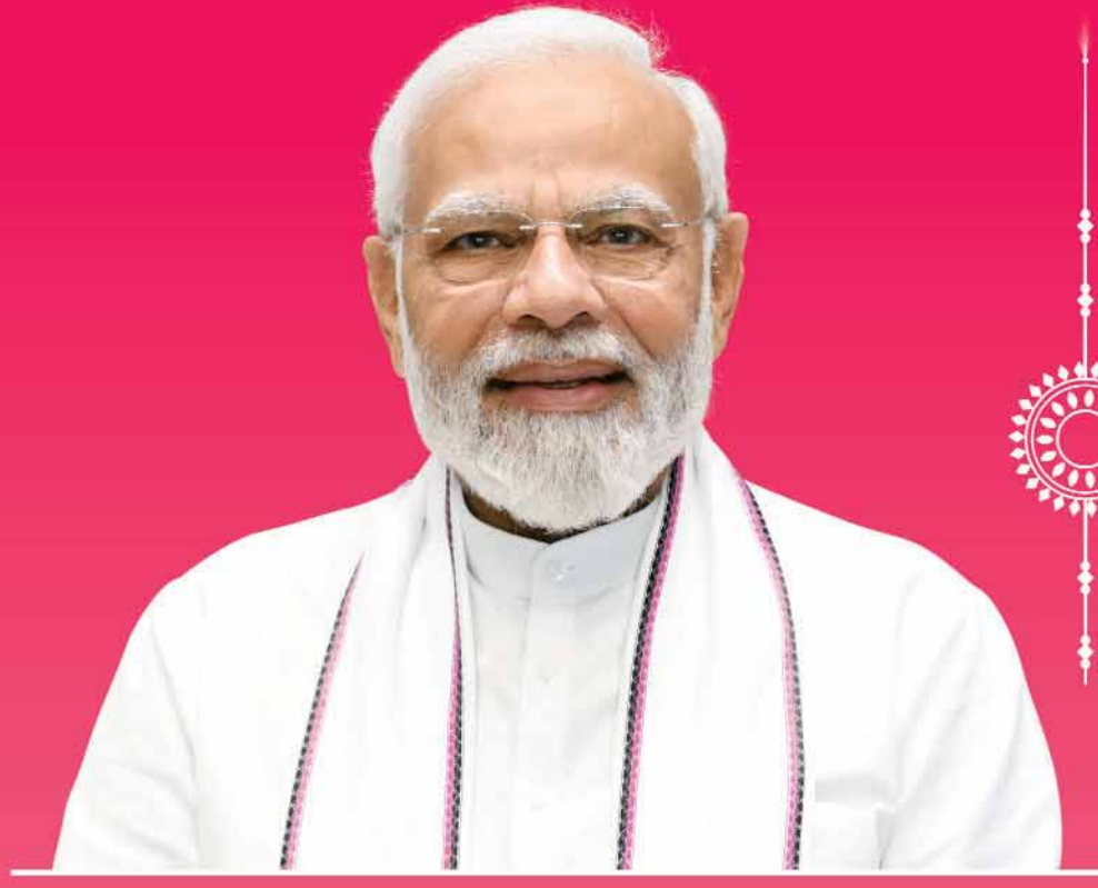
नरेन्द्र मोदी, प्रधानमंत्री

रक्षाबंधन के पावन पर्व पर हर बहन को सुरव, समृद्धि और आत्मसम्मान से परिपूर्ण जीवन की हार्दिक शुभकामनाएं - भैया मोहन यादव मुख्यमंत्री, मध्यप्रदेश