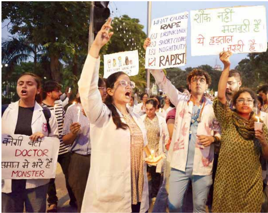
Members of various Resident Doctors' Associations protest during a candle march against the alleged rape and murder of a trainee doctor at Kolkata's RG Kar Medical College and Hospital, at Connaught Place, in New Delhi, on Sunday