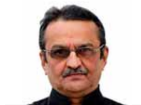
B K JHA

The recent barbaric act of violence, rape, and murder against a resident lady doctor in Kolkata has sent shockwaves across the nation. This incident, coupled with the growing number of attacks on medical professionals, calls for an urgent need for a safe operating environment for those who dedicate their lives to saving others.