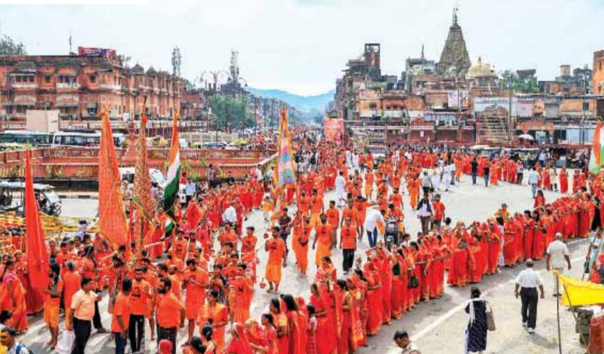
Women devotees carry holy water in the 'Kalash Yatra' in Jaipur