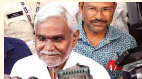
Former Jharkhand Chief Minister Champai Soren speaks with the media upon his arrival at Delhi airport on Sunday

reluctance to perform night shifts at the hospital. "Clearly, she was under pressure for some reason or was privy to something she should not have known," one family member speculated, questioning why the victim would tear out 4-5 pages from her personal diary. On Sunday, the CBI summoned several security staff members and a subaltern police officer for questioning. However, investigators have yet to determine why hospital authorities delayed informing the police by two hours after discovering the body or why students and staff were instructed not to go to the third floor, where the seminar room — and the victim's body — was found early on the morning of August 9. The officials also have asked the former principal of the college as to why the common wall between the bathroom and the seminar hall was pulled down after the incident and why the washbasins and such other things were replaced in a hurry.