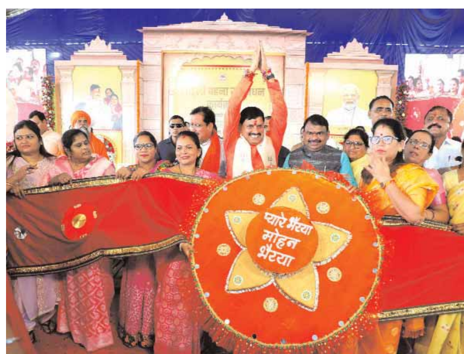
Madhya Pradesh Chief Minister Mohan Yadav during Rakshabandhan festival celebration programme in Ujjain, Madhya Pradesh on Sunday.