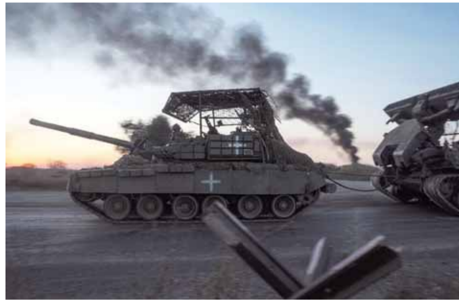
Ukrainian servicemen ride atop on a tank after returning from Russia near the Russian-Ukrainian border in Sumy region, Ukraine, on Saturday, August 17, 2024.

country since World War II, which took the Kremlin by surprise and saw scores of villages and hundreds of prisoners fall into Ukrainian hands. The Ukrainians drove deep into the Kursk region in several directions, facing little resistance and sowing chaos and panic. Ukraine's Commander in Chief, Gen. Oleksandr Syrskiy claimed last week that his forces had advanced across 1,000 square kilometers (390 square miles) of the Kursk region, although it was not possible to independently verify what exactly Ukrainian forces effectively control. But the strikes on bridges, apparently aimed to stymie a Russian counterpush in Kursk, could mean that Kyiv intends to seek a foothold in the region — or at least signal to Moscow that it plans to do so. Analysts say that although Ukraine could try to consolidate its gains within Russia, it would be a risky maneuver given Kyiv's limited resources, because supply lines extending deep into Kursk would be vulnerable to Russian strikes. The incursion has already