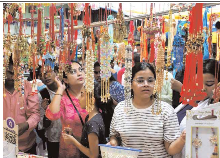
Women buying Rakhis on the eve of Rakshabandhan festival in Bhopal on Sunday.

the vehicle was stolen. During interrogation, the accused told the police that they used to do recce of dhabas, farm houses and farms in the outskirts of Bhopal during the day. They used to steal these vehicles at night. They used to sell these stolen vehicles to the villagers of Raisen and Vidisha districts at low prices. The accused said that generally police do less checking in rural areas. Villagers used to travel mostly in the fields, houses and villages. Due to which there is less fear of vehicles getting caught. Police have seized 29 two wheelers on the information given by the accused.