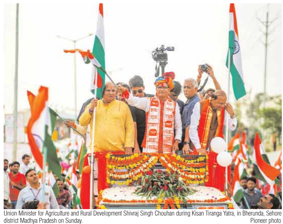
Union Minister for Agriculture and Rural Development Shivraj Singh Chouhan during Kisan Tiranga Yatra, in Bherunda, Sehore district Madhya Pradesh on Sunday.

material progress, we exploited it and that is why we are facing problems like climate change and global warming. That is why I felt that I will plant a tree every day. We release carbon dioxide and trees give us oxygen. So make arrangements for as much as we need to live. The Union Minister on Sunday participated in the Tiranga Yatra here and interacted with the people. During his visit, people welcomed Shivraj in every village. Wherever Shivraj's convoy passed, sisters tied rakhi to Shivraj and blessed him. Youngsters showered flowers on him and elders blessed him by placing their hands on his head. Nephews and nieces expressed their happiness by hugging their uncle. During this, Chouhan said that such a flood of love of sisters surged in the village that I cannot describe it.