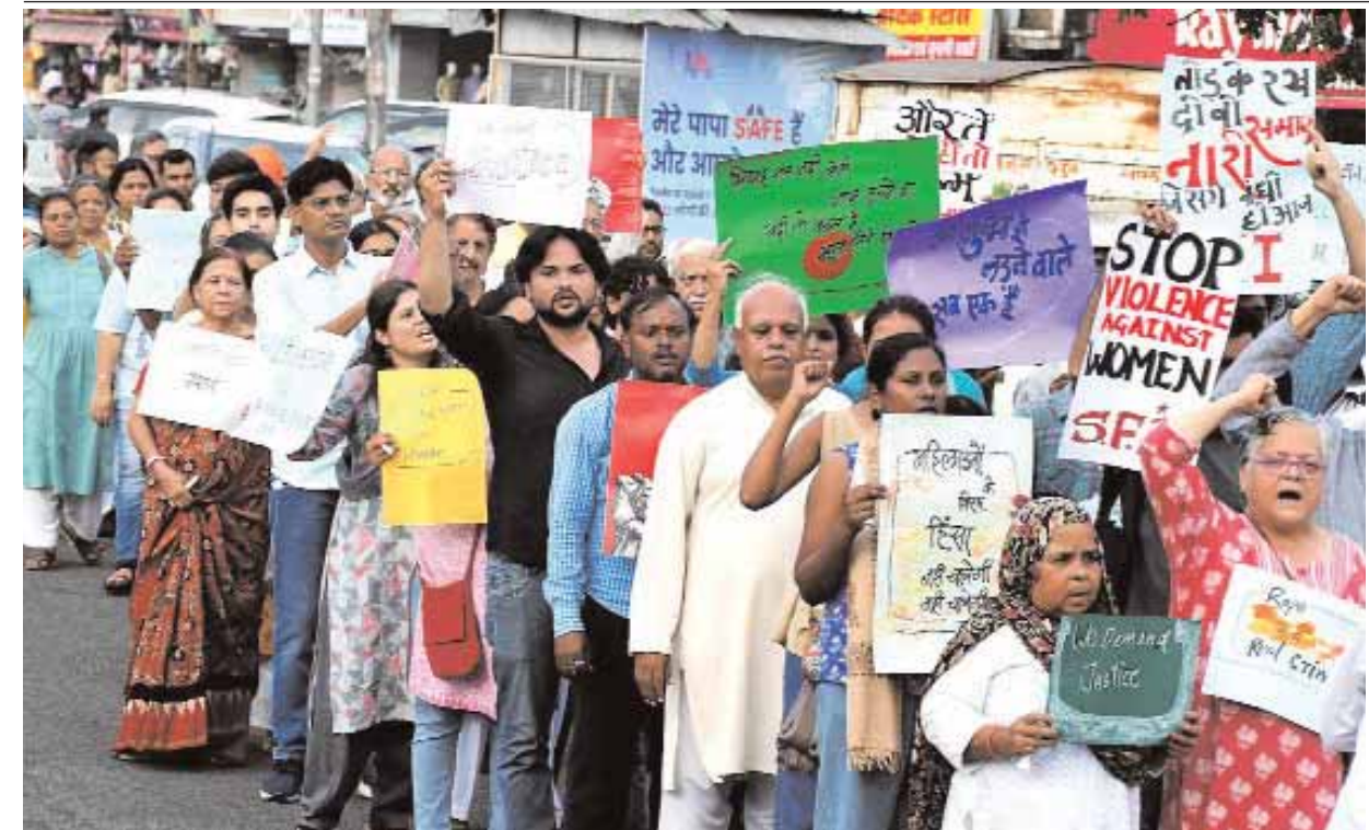
Members of various cultural and social organisations stage a protest demanding justice for a woman trainee doctor who was on duty allegedly raped and murdered at Kolkatta's RG Kar Medical College and Hospital, at Roshanpura square in Bhopal on Sunday.