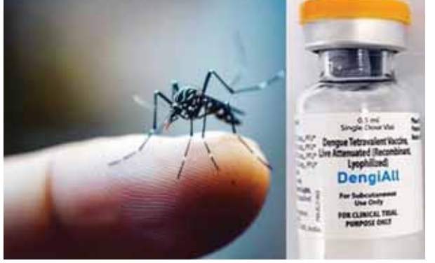
effective vaccine lies in the need to address all four serotypes of the dengue virus, which circulate extensively

of the collaboration between ICMR and Panacea Biotec for the development of the dengue vaccine, Nadda noted that "Through this partnership, we are not only taking a step towards ensuring the health and well-being of our people but also reinforcing our vision of Atmanirbhar Bharat in the healthcare sector." India faces a significant challenge with dengue, having no antiviral treatments or licensed vaccines available. The complexity of developing an