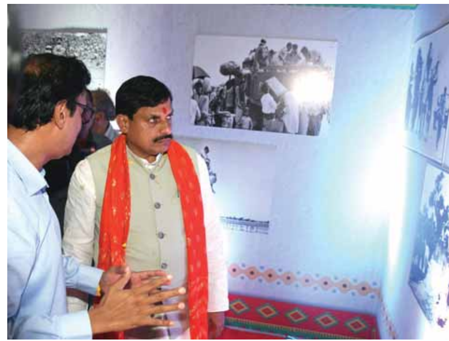
Madhya Pradesh Chief Minister Mohan Yadav goes through an exhibition on Partition Horror Remembrance Day celebration programme at Government Sarojini Naidu College for Women in Bhopal on Wednesday.

who initiated Ganesh Utsav, Pandit Madan Mohan Malviya, Chandrashekhar Azad, and Bhagat Singh, who helped establish Banaras Hindu University, were sidelined. The political party committed to preventing the country's division failed to uphold its pledge, leading to the swift creation of the principle of partition, which was approved by Lord Mountbatten. This resulted in the nation enduring the horrors of partition, including widespread violence and genocide. Nationalist Muslims were disrespected, and the country's disregard for its cultural unity led to tragic outcomes, including brutal train massacres, widespread abuse of women, and the division of Punjab and Sindh, with the latter's name still reflected in the national anthem.