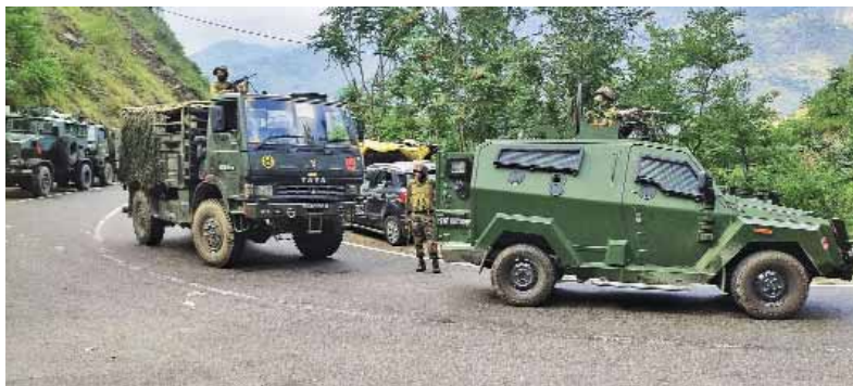
Army personnel keep vigil near the site of an encounter between security forces and terrorists, in Doda district of Jammu and Kashmir, on Wednesday