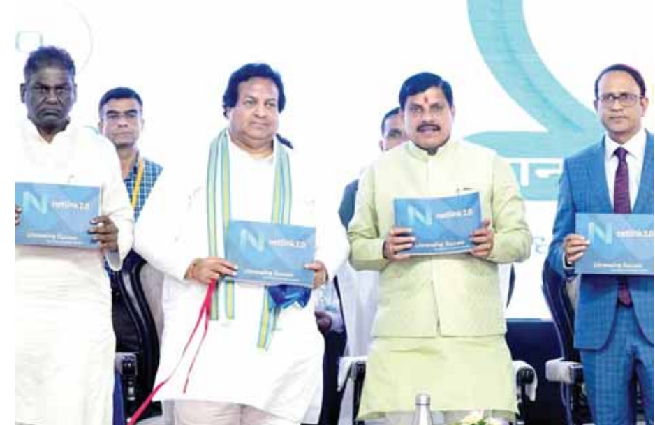
Madhya Pradesh Chief Minister Mohan Yadav releases a magazine at the Netlink campus in Mandideep, Raisen district on Wednesday.