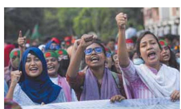
Students shout slogans during a protest demanding the trial of former Prime Minister Sheikh Hasina in Dhaka on Tuesday.