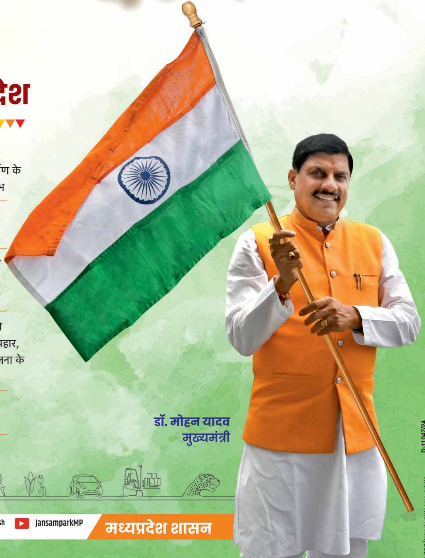
डॉ. मोहन यादव मुख्यमंत्री

मुख्यमंत्री किसान कल्याण योजना में 83 लाख से अधिक किसानों को ₹14254 करोड़ की सहायता