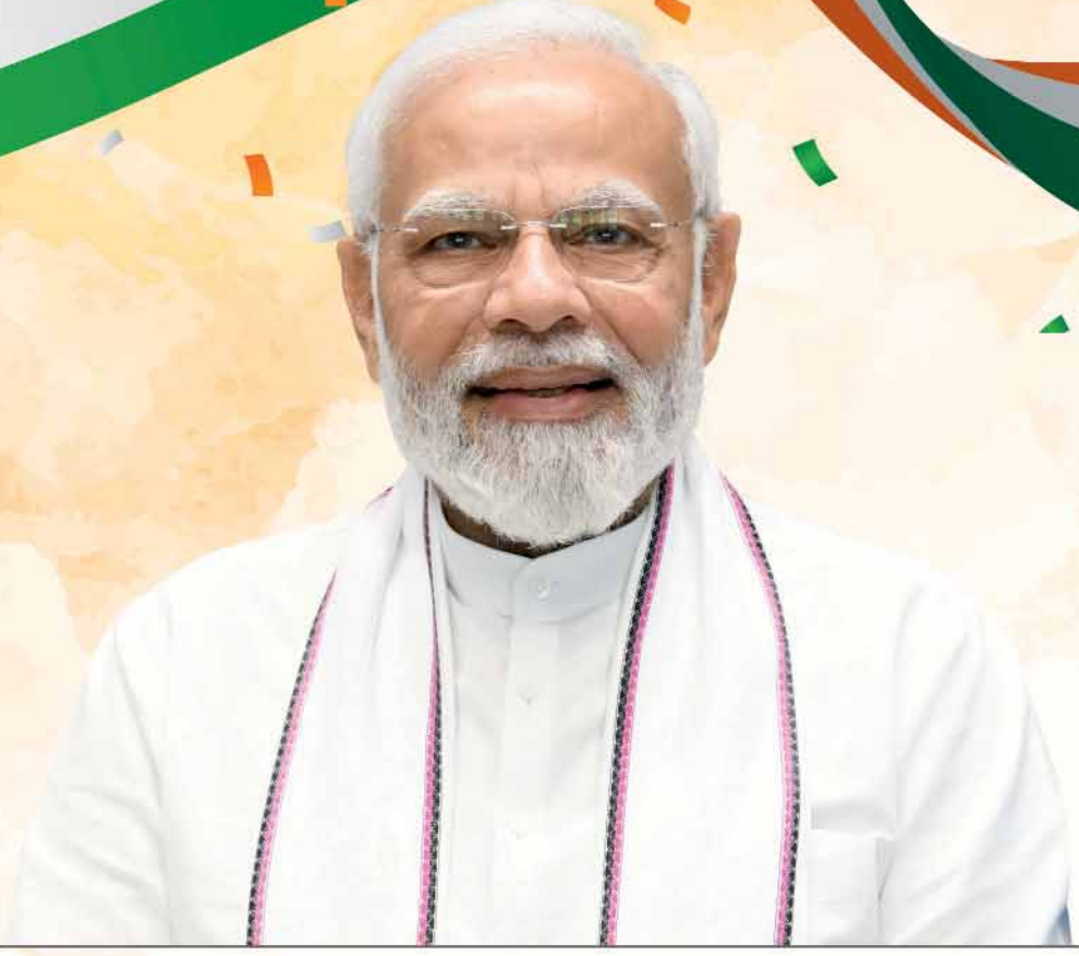
नरेन्द्र मोदी, प्रधानमंत्री

78 वें स्वतंत्रता दिवस की हार्दिक शुभकामनाएं