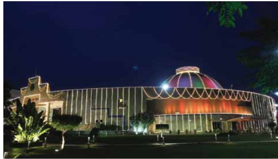
Madhya Pradesh State Assembly illuminated with lighting on the eve of Independence Day in Bhopal on Wednesday.