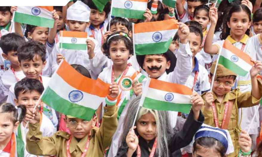
Young students participate in a programme on the eve of Independence Day at a school, in Moradabad, PI