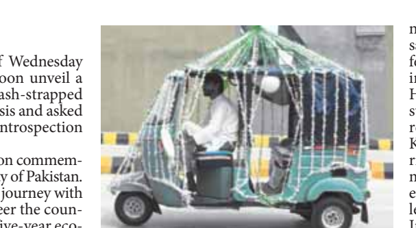
A driver decorates his rickshaw with national flag colors to celebrate the country's 78th Independence Day from British rule in Peshawar on Wednesday.

PTI n ISLAMABAD Prime Minister Shehbaz Sharif Wednesday announced that he would soon unveil a new five-year plan to bring cash-strapped Pakistan out of the economic crisis and asked countrymen to undertake self-inspection to correct mistakes of the past. Sharif's remarks came as the nation commemorated the 78th Independence Day of Pakistan. The Prime Minister said a "fresh journey with new zeal should be started to steer the country out of existing crises" and a five-year economic programme will soon be launched. He said that there is a need for self-introspection to correct mistakes of the past. The nation would hear good news regarding the reduction in electricity prices in the next few days, Radio Pakistan quoted him as saying at the main ceremony held in Islamabad. Turning to issues being faced by the country, Sharif pledged to work hard till the last drop of his blood to reduce inflation and electricity prices and revamp Pakistan's battered economy. He said the reduction in inflation and electricity bills is vital for the development of agriculture and industry, enhancing exports and providing solace to domestic power consumers. Sharif also urged the youth to focus on their studies, training, and skills and avoid becoming prey to the forces of chaos, anarchy and