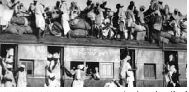
PIONEER NEWS SERVICE | NEW DELHI

Development Authority Act of 1992 vide its judgment dated March 22, 1993. Section 89 of the Mineral Area Development Authority Act empowered the State Government of then undivided Bihar to levy tax on not only mineral-bearing land but also land used for commercial or industrial purposes. CJI Chandrachud assured Dwivedi that he will issue directions on the administrative side for urgent listing of the matter. During the hearing on July 31, the Centre and mining companies have opposed the demand of States for refund of royalty collected since 1989. The July 25 verdict had overruled a 1989 judgement and subsequent decisions of the apex Court, which held that only the Centre has power to impose royalty on minerals and mineral bearing land. Some Opposition-ruled mineral rich States then sought refund of royalty levied by the Centre and taxes from the mining companies since the 1989 verdict. The matter of refund was heard on July 31 and order was reserved.