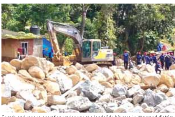
Search and rescue operation underway at a landslide-hit area in Wayanad district, Sunday

away because of the snapping of the chain link by the floodwaters has jolted people in five districts of Kerala. Tungbhadra dam built in 1953 and Mullaperiyar in Kerala, built 130 years ago have a lot of similarities. Both are built with a combination of surki, mortar, mud and limestone making them the last surviving non-cement dams in India. The Mullaperiyar dam, constructed across River Periyar in Kerala with the sole purpose of providing drinking and irrigation water to the four districts in Tamil Nadu has become a modern day water bomb. People living in the districts of Idukki, P a t h a n a m t h i t t a, Alappuzha, Kottayam and Ernakulam would be drowned in the deluge that would occur