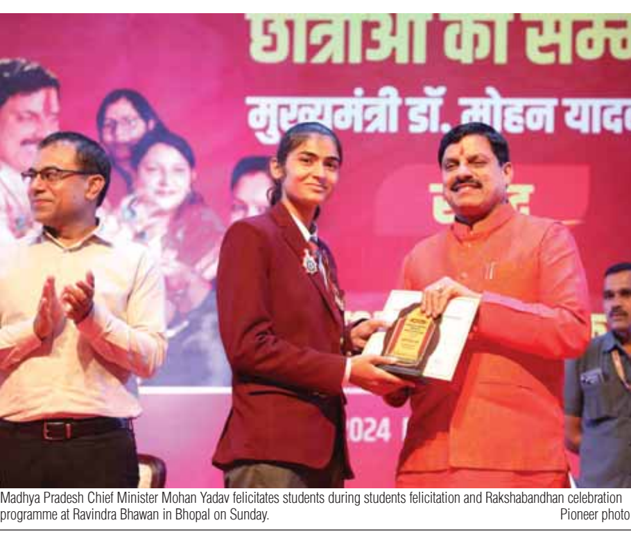
Madhya Pradesh Chief Minister Mohan Yadav felicitates students during students felicitation and Rakshabandhan celebration programme at Ravindra Bhawan in Bhopal on Sunday.