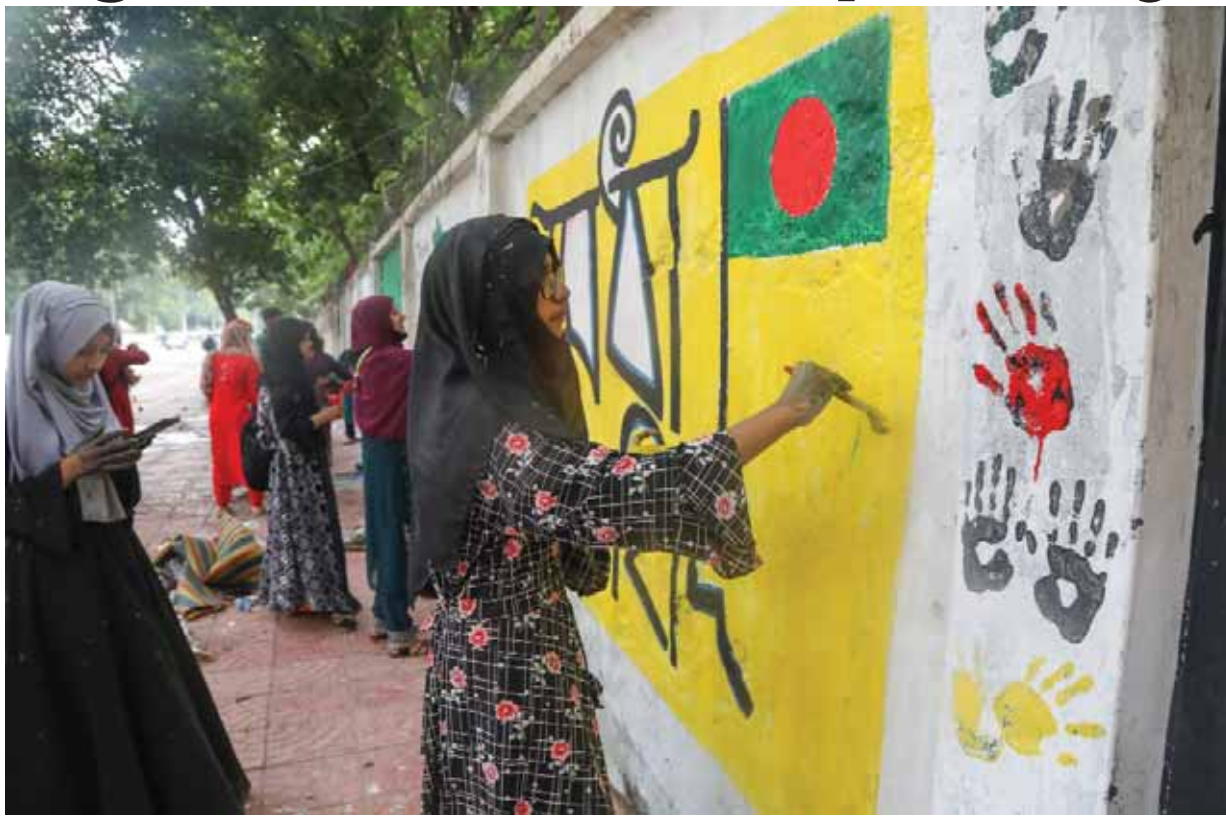
A student paints a new graffiti on a street wall at Dhaka University campus in Dhaka, Bangladesh

He added that it would not take much time to resume the basic operations of the banking sector. "Already the operations are there, but there were some deviations at the middle of the operations...the operations