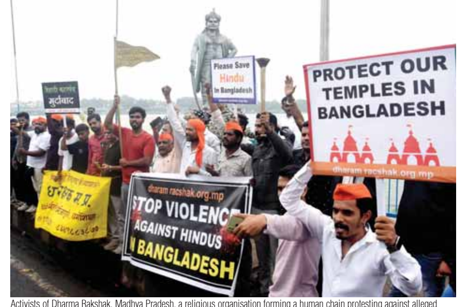
Activists of Dharma Rakshak, Madhya Pradesh, a religious organisation forming a human chain protesting against alleged violence on Hindu minorities and religious places in Bangladesh, at VIP road in Bhopal on Sunday.