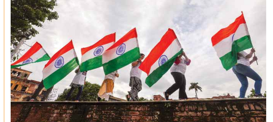
People wave the Indian national flags at Mubarak Mandi palace ahead of the Independence Day, in Jammu, on Sunday