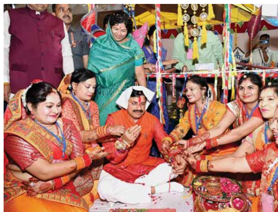
Madhya Pradesh Chief Minister Mohan Yadav with Ladi Behna during Rakshabandhan and Shrawan Utav celebration in Mandla Madhya Pradesh on Sunday.