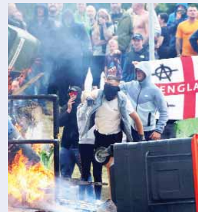
The world seems to be in flames. In the UK, violent clashes between communities are intensifying, with immigrants gaining

ground in the conflict. Across Europe, a similar surge sees immigrants clashing with native populations. But the most alarming development this week has been the chaos and coup in our neighboring country—once a close friend and an Islamic nation that upheld peaceful coexistence among all religions, now plunged into turmoil. These are difficult times where unrests and upheavals have become order of the day. Amidst this global unrest, our own opposition leaders are calling for insurrection, openly demanding the removal of our elected Prime Minister. These are the same voices that champion democracy and preach about love. Yet, we believe that Indians will never tread that destructive path. We stood strong during the Emergency, showing our love for the nation and our willingness to fight for it if necessary. C K Subramaniam | Bengaluru