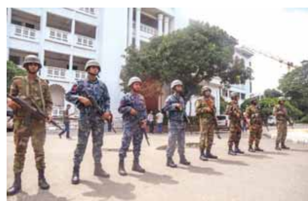
Bangladeshi Army and navy officials stand guard in front of the Supreme Court area in Dhaka, Bangladesh

Central Police Hospital. He warned that the media outlets would face closure if they provided misleading news, the Dhaka Tribune newspaper reported. Meanwhile Syed Refaat Ahmed was sworn in as Bangladesh's new chief justice on Sunday, a day after Obaidul Hassan stepped down as the top judge following an ultimatum by the protesters demanding a revamp of the judiciary. Hassan and five other judges of the apex Appellate Division on Saturday tendered their resignation,