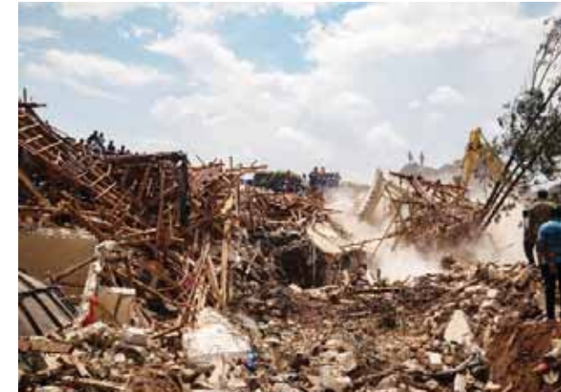
Sunday. "The assessment is not yet completed," she said, adding that rainfall was slowing the efforts of rescue teams digging through heaps of trash. The Kiteezi landfill is on a steep slope in an impoverished part of the city. Women and children who scavenge plastic waste for income frequently gather there, and some homes have been built close to the landfill.

A vast landfill site in the Ugandan capital collapsed, killing at least 18 people, the Red Cross said. Fourteen other people were injured when the Kiteezi landfill, which serves as a waste disposal site for much of Kampala, collapsed late Friday. At least two of the dead were children, Kampala Capital City Authority said in a statement. The collapse is believed to have been triggered by heavy rainfall. The precise details of what happened were unclear, but the city authority said there was a "structural failure in waste mass". Irene Nakasiita, a spokeswoman for the Uganda Red Cross, said the toll reached 18 after more bodies were retrieved from the scene on