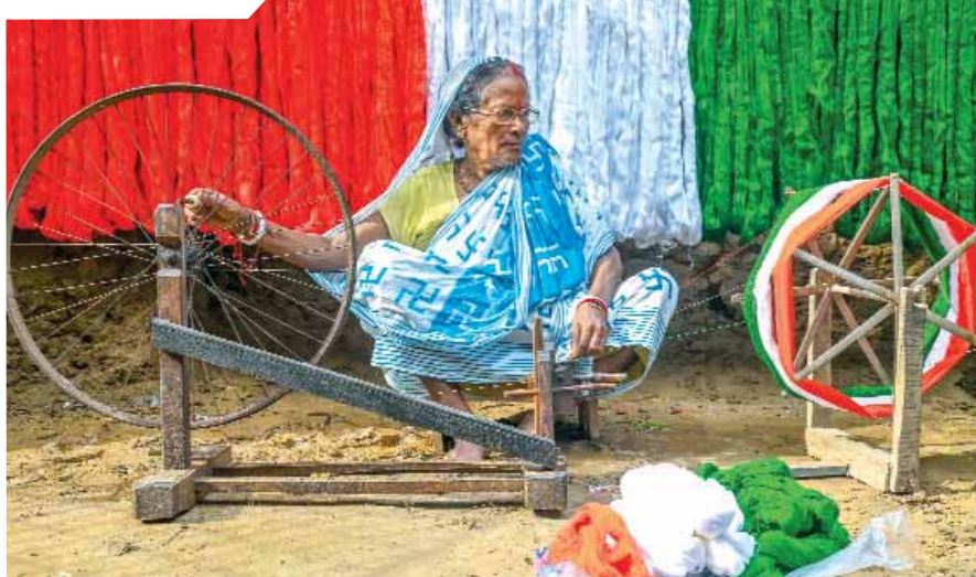
An elderly woman spins tricolour yarns ahead of the Independence Day in Nadia district