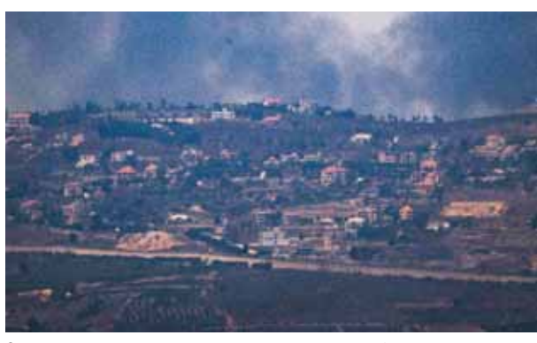
Smoke rises after a strike in an area in Lebanon next to the Israeli-Lebanese border at the Galilee region on Sunday.

A suspected missile attack by Yemen's Houthi rebels struck a container ship traveling through the Gulf of Aden, authorities said on Sunday, likely the first assault by the group since Israeli airstrikes targeted them. The Houthis have offered no explanation for the two-week pause in their attacks on shipping through the Red Sea corridor, which have seen similar slowdowns since the assaults began in November over Israel's war on Hamas in the Gaza Strip. But the resumption comes after the assassination of Hamas leader Ismail Haniyeh in Iran, the Houthis' main benefactor, amid renewed concerns over the war breaking out into a regional conflict. The attack on Saturday happened some 225 kilometers (140 miles) southeast of Aden in a stretch of the Gulf of Aden that has seen numerous Houthi