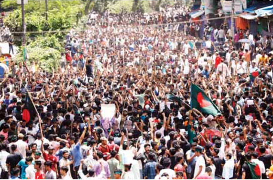
People participate in a rally against Prime Minister Sheikh Hasina and her Government demanding justice for the victims killed in the recent countrywide deadly clashes, in Dhaka, Bangladesh, on Sunday