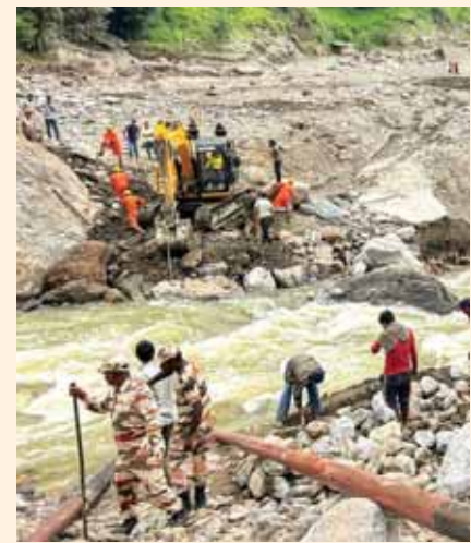
Officials and others during a search and rescue operation following a recent cloudburst, in Shimla, on Sunday

Harmanpreet acknowledged Sreejesh's role in the win but insisted that it was not a one-man show.