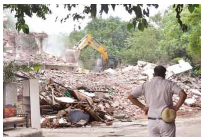
A police personnel during a demolition drive at Khyber Pass area, in New Delhi, on Sunday