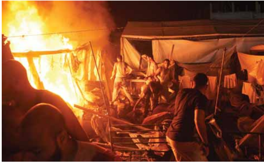
Palestinians react to fire from an Israeli strike that hit a tent area in the courtyard of Al-Aqsa Martyrs hospital in Deir al-Balah, Gaza Strip, on Sunday.

Israeli strikes killed 18 people in Gaza early on Sunday, including four Palestinians in a tent camp inside a hospital complex, while a stabbing attack by a Palestinian killed two people in a Tel Aviv suburb. Tensions have soared following nearly 10 months of war in Gaza and the killing last week of a senior Hezbollah commander in Lebanon and Hamas' top political leader in Iran. Iran and its allies have blamed Israel and threatened retaliation, raising fears of an even more destructive regional war. "The state of Israel is in a multi-front war," Israeli Prime Minister Benjamin Netanyahu told a Cabinet meeting, and said the country was ready for any scenario in defence or attack. Jordan's foreign minister was making a rare trip to Iran as the United States and its Arab allies try to prevent a wider conflict. Already, Hamas says it has begun discussions on choosing a new leader. The stabbing attack in Tel Aviv