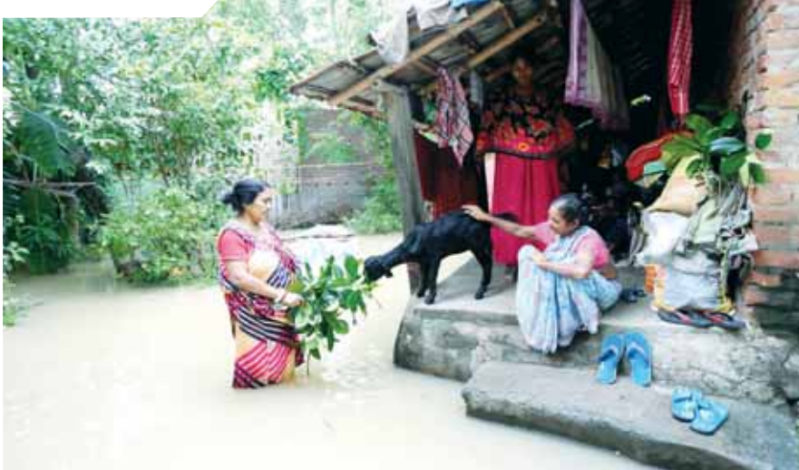
A woman feeds a goat in her partially submerged house after heavy rains in East Bardhaman