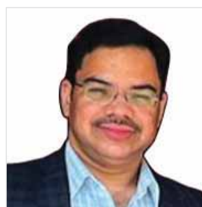
DR. DEVENDER Assistant Professor

structures to help plan treatment. • Magnetic Resonance Imaging (MRI): This is another way to get detailed images of the thyroid and surrounding areas. Again, it is not performed for all patients and has similar indications as for CT scan and is especially useful when doctors suspect the goiter is growing into other tissues, or if a patient is allergic to dye used in CT scans. • Thyroid Scintigraphy: This is a different type of scan in which a special kind of dye ("radioactive tracer") is