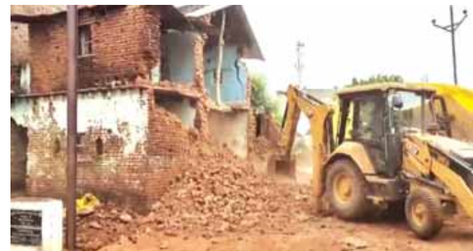
Rescue work underway after a wall collapsed at Shahpur village, in Sagar district, on Sunday PTI

water to the shivling when a wall collapsed, trapping several children who were making clay shivlings under a tent. I was stunned and could not fathom