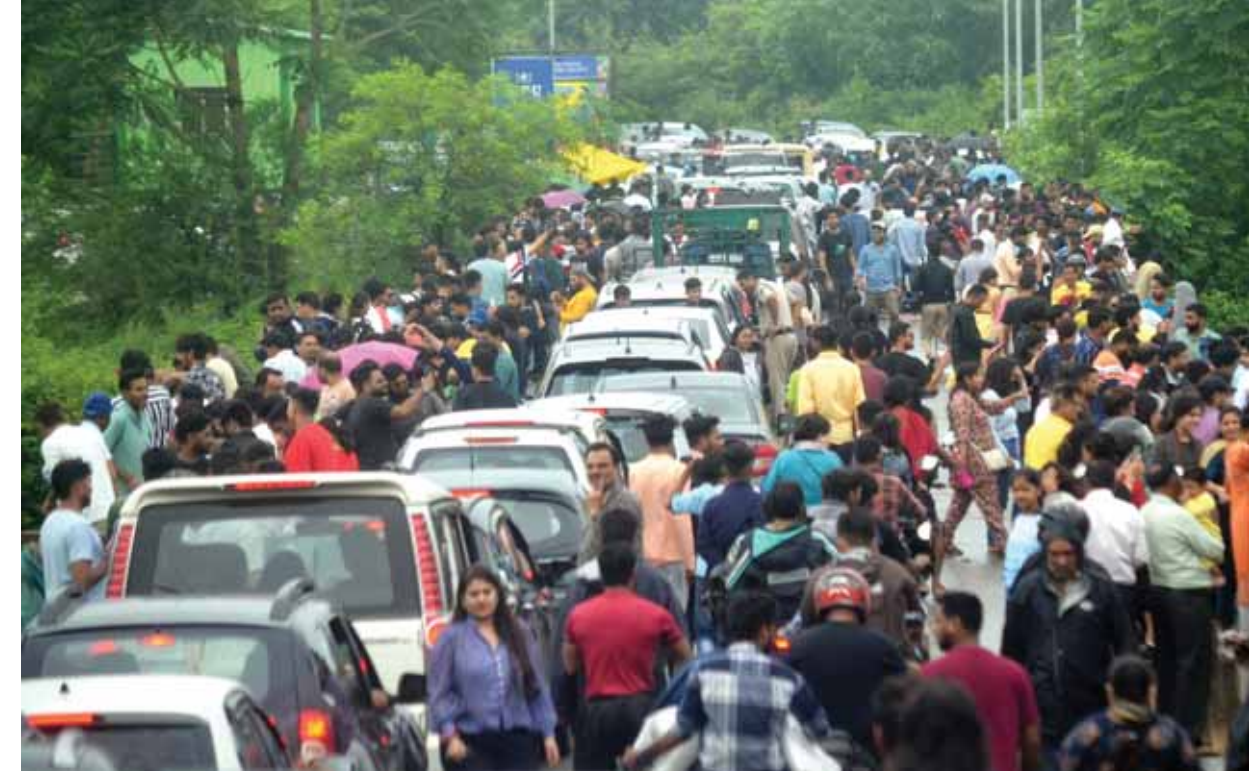
A view of a traffic jam at Kerwa Dam in Bhopal on Sunday.

Bhopal: Chief Minister Mohan Yadav has expressed profound grief over the untimely death of children in the incident of damage to the kutcha house in Sagar district. This incident took place in Shahpur of Sagar district this morning. Chief Minister Yadav said that it is a matter of pain that such incidents have happened after continuous efforts to take precautions during the rainy season. The state government has also directed the disaster teams to remain active to deal with the situations of excessive rainfall in the districts. CM Dr. Yadav has directed the Sagar district administration to provide financial assistance of Rs. 4 lakh each to the affected families and to provide proper treatment to the children injured in the incident.