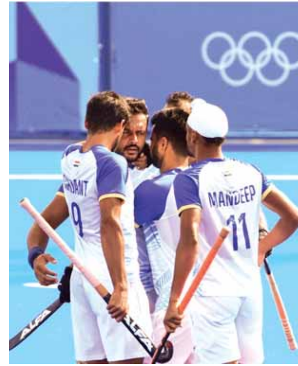
India's captain Harmanpreet Singh (C) celebrates a goal with others during the Hockey Men's Quarterfinal match between India and Great Britain at the 2024 Summer Olympics, at Yves-du-Manoir Stadium, in Colombes, France, on Sunday

"Words cannot express the sort of tenacity, fighting spirit and unity these players have displayed today. Every