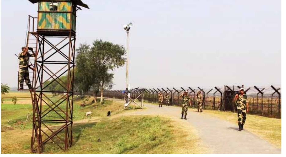
personnel fought back even as a fellow jawan threw a "stun grenade" from a distance to frighten the intruders away. As the infiltrators continued to advance undeterred the woman constable fired a single shot from her rifle scaring the infiltrators who then ran back