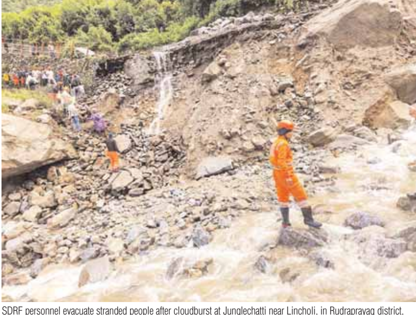
SDRF personnel evacuate stranded people after cloudburst at Junglehatti near Lincholi, in Rudraprayag district, on Thursday