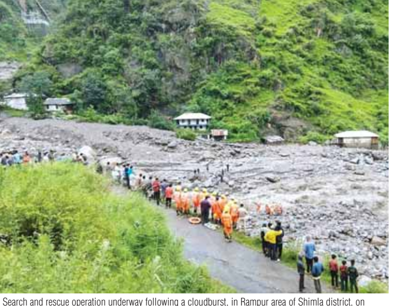
Search and rescue operation underway following a cloudburst, in Rampur area of Shimla district, on Thursday