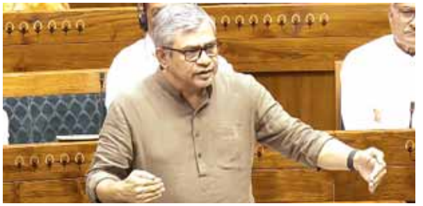
Union Railway Minister Ashwini Vaishnaw speaks in the Lok Sabha during the Monsoon session of Parliament, in New Delhi, on Thursday