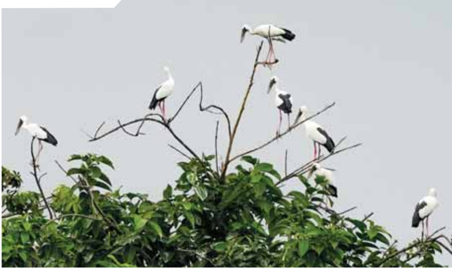
Asian Openbill storks perch on a tree, in Kolkata