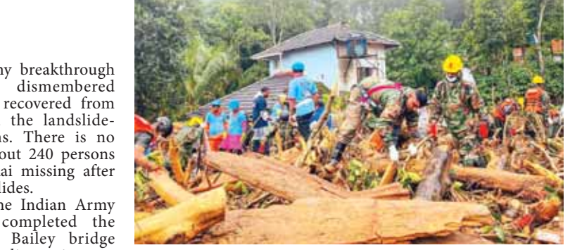
Rescue operation underway after landslides triggered by rain, in Wayanad district, Kerala on Thursday

KUMAR CHELLAPPAN ■ KOCHI Even as the South-West Monsoon's fury continued unabated in Wayanad district, the death toll in the massive landslides in Mundakkai settlement crossed 283 mark by 6 pm on Thursday. Chief Minister Pinarayi Vijayan, who inspected the flood-affected region, told mediapersons that the landslides and deluge which