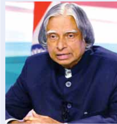
Throughout his life Abdul Kalam professed the scientific, academic as well as spiritual development of the students. He made

numerous speeches and wrote many books addressing the youth; which are listened and read even today by students even across the world. Choosing his birth day as the 'World's Student's Day' was an appropriate decision honoring his works as a scientist and the millions of youths that he inspired and still inspires through his works, achievements, speeches, lectures and books. Students deserve better education standards and we hope it is time to inculcate the best education to students so that they may not wish to go to other countries for education purposes. He believed that students are the future of a nation and they can bring considerable change if well nurtured and educated. He professed education as the only weapon to fight back the demons of poverty, illiteracy, malnutrition etc.