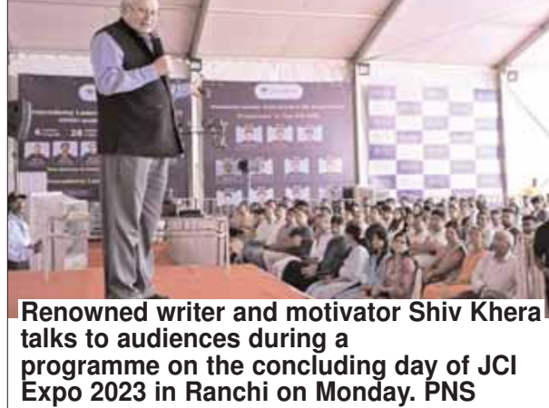
Renowned writer and motivator Shiv Khera talks to audiences during a programme on the concluding day of JCI Expo 2023 in Ranchi on Monday.