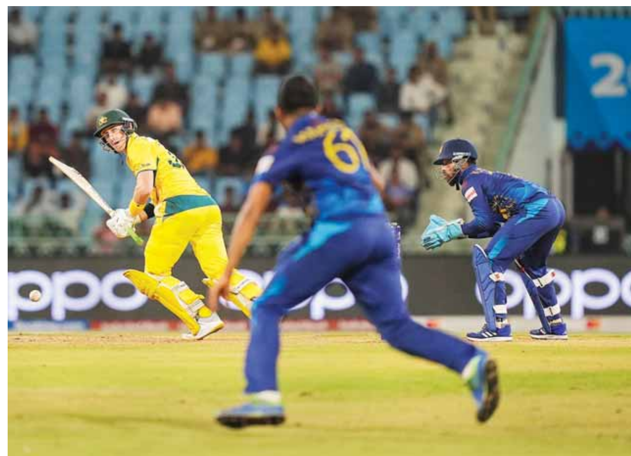
Australia's batter Marnus Labuschagne plays a shot during the ICC Men's Cricket World Cup 2023 match between Sri Lanka and Australia at Bharat Ratna Shri Atal Bihari Vajpayee Ekana Cricket Stadium in Lucknow on Monday. Australia beat Sri Lanka by five wickets in their ICC World Cup match here on Monday. Sent in to bowl, Australia dismissed Sri Lanka for 209 in 43.3 overs and then returned to overhaul the target in 35.2 overs, scoring 215 for five in a match that was briefly interrupted by rain. This was Australia's first win of the ongoing tournament.

expedite the retrieval of misplaced belongings. If passengers inadvertently leave their items on RAPIDX trains or within station premises, they can promptly seek assistance from station staff. Further inquiries and support regarding lost items can be directed to the RAPIDX Customer Service Centre at 08069651515. Passengers will have a 24-hour window to claim their lost belongings from the station where they were misplaced or left. Following this period, any unclaimed items will be transferred to the designated "lost and found" centre at the Ghaziabad station, operational from 8 am to 8 pm daily. The RRTS trains have been designed with an aerodynamic profile, featuring long noses and plug-in doors to minimize air resistance at higher speeds. Passengers will relish panoramic views through expansive window panes, enhancing their travel experience.