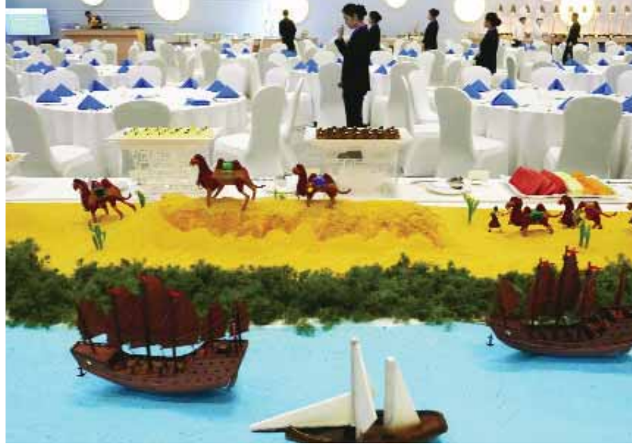
Waitresses prepare for meal time at the media center near a display depicting China's Silk Road during the Third Belt and Road Forum...