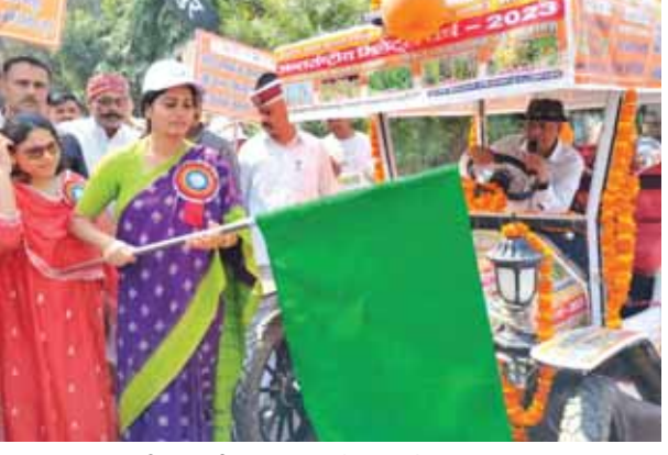
Union Minister of State for Commerce and Industry Anupriya Patel flagging off the millet awareness rally at Vikas Bhawan on Sunday

Flagging off the awareness rally taken out by the Agriculture department the minister appealed to farmers to