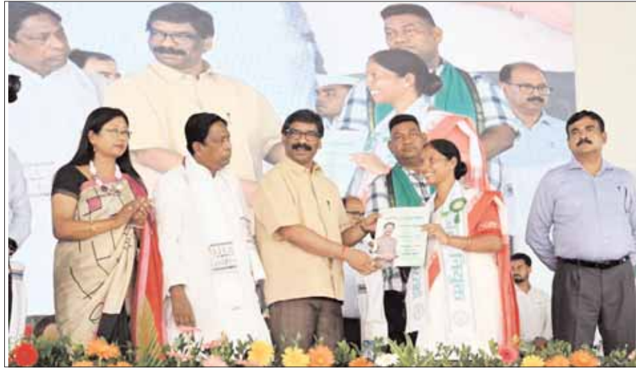
Chief Minister Hemant Soren distributing appointment letters among 827 trained graduate teachers selected for secondary schools by Jharkhand Staff Selection Commission in the teacher appointment letter distribution ceremony at Dr. Ramdayal Munda Football Stadium, Morhabadi in Ranchi on Monday.

PNS : RANCHI The process of large-scale appointments is going on in the state. Appointments have been made in many departments and the recruitment process is going on for many posts. This trend will continue further also. In this connection, appointment letters are being distributed among you today. It is expected from you that as a teacher, you will discharge your responsibilities with full dedication in shaping the future of children and in the development of the state," said Chief Minister Hemant Soren while addressing a gathering at the teacher appointment letter distribution ceremony organized at Dr. Ramdayal Munda Football Stadium, Morhabadi, Ranchi on Monday. On this occasion, he symbolically presented appointment letters to 24 teachers out of 827 graduate trained