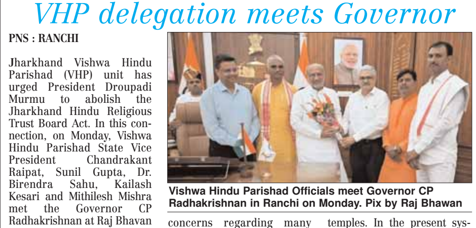
Vishwa Hindu Parishad Officials meet Governor CP Radhakrishnan in Ranchi on Monday.