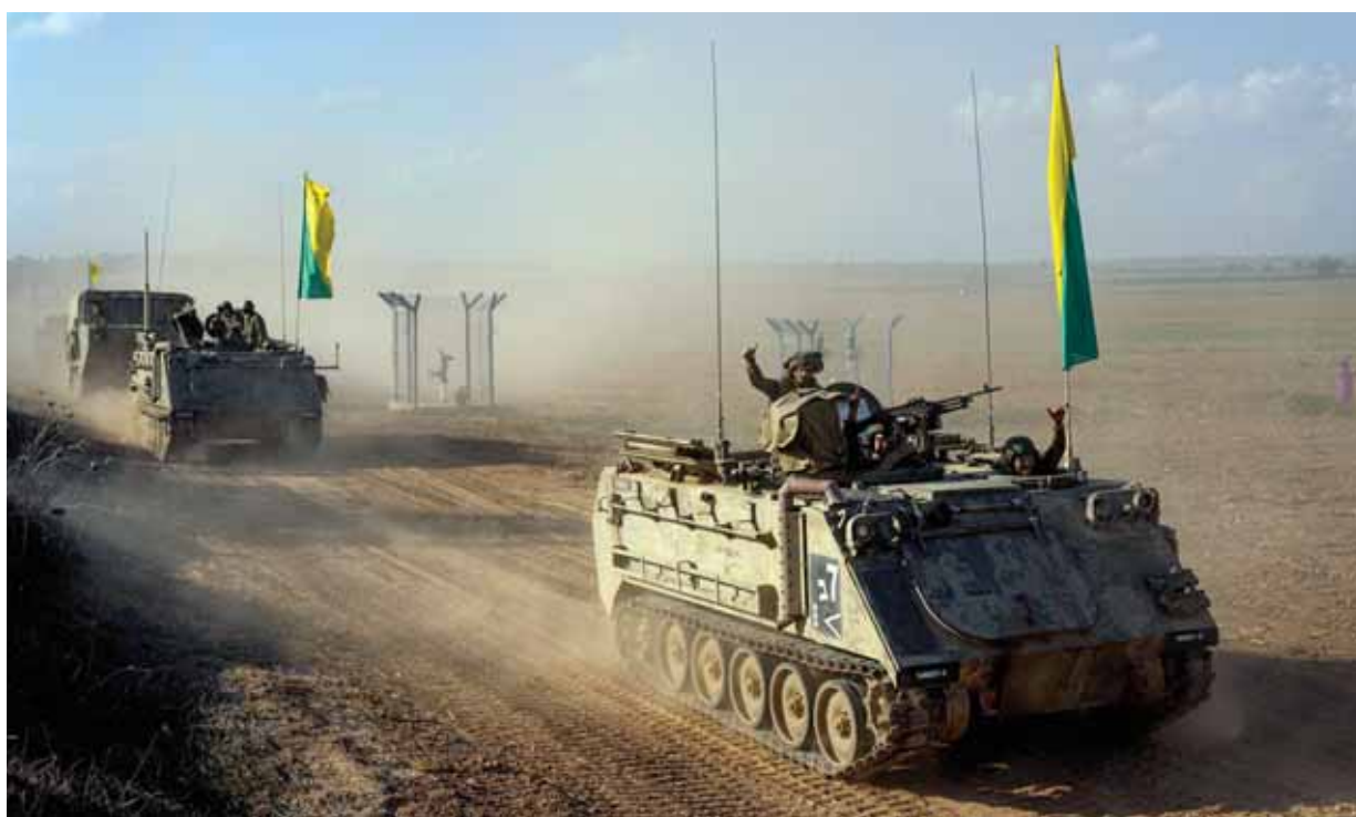
Israeli armored personnel carriers head toward the border with the Gaza Strip in southern Israel