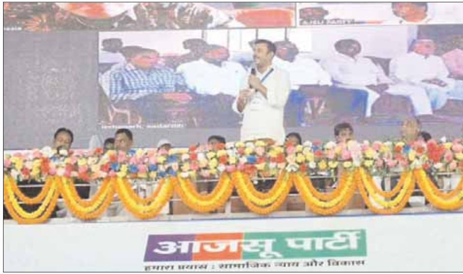
what is it? Why does the Government not issue advertisements for appointments by linking its employment policy with the 1932 Khatian based locality policy? It is the

Mahato and Martyr Nirmal Mahato go in vain. Our ancestors have sacrificed their lives for this and now it is our determination to achieve it. Dalit minorities, backward classes and tribals of the State should support us, we will give Khatian based local policy. The present Government is conspiring with the indigenous people of the State, especially the Dalits, backward classes, tribals and minorities," said Mahto. The party Chief said that the Government says in the House that Khatian based localism policy is not legally possible, but big posters are pasted on the streets that we have given the 1932 Khatian based localism policy to the indigenous people of the State. "If it is not a plant then