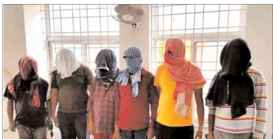
The arrested crimianls at police station