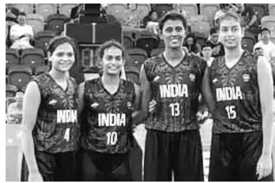
while facing a humiliating defeat against last edition's gold medallist China. The women's team will lock horns

The women's team had finished second in its group, having beaten Uzbekistan