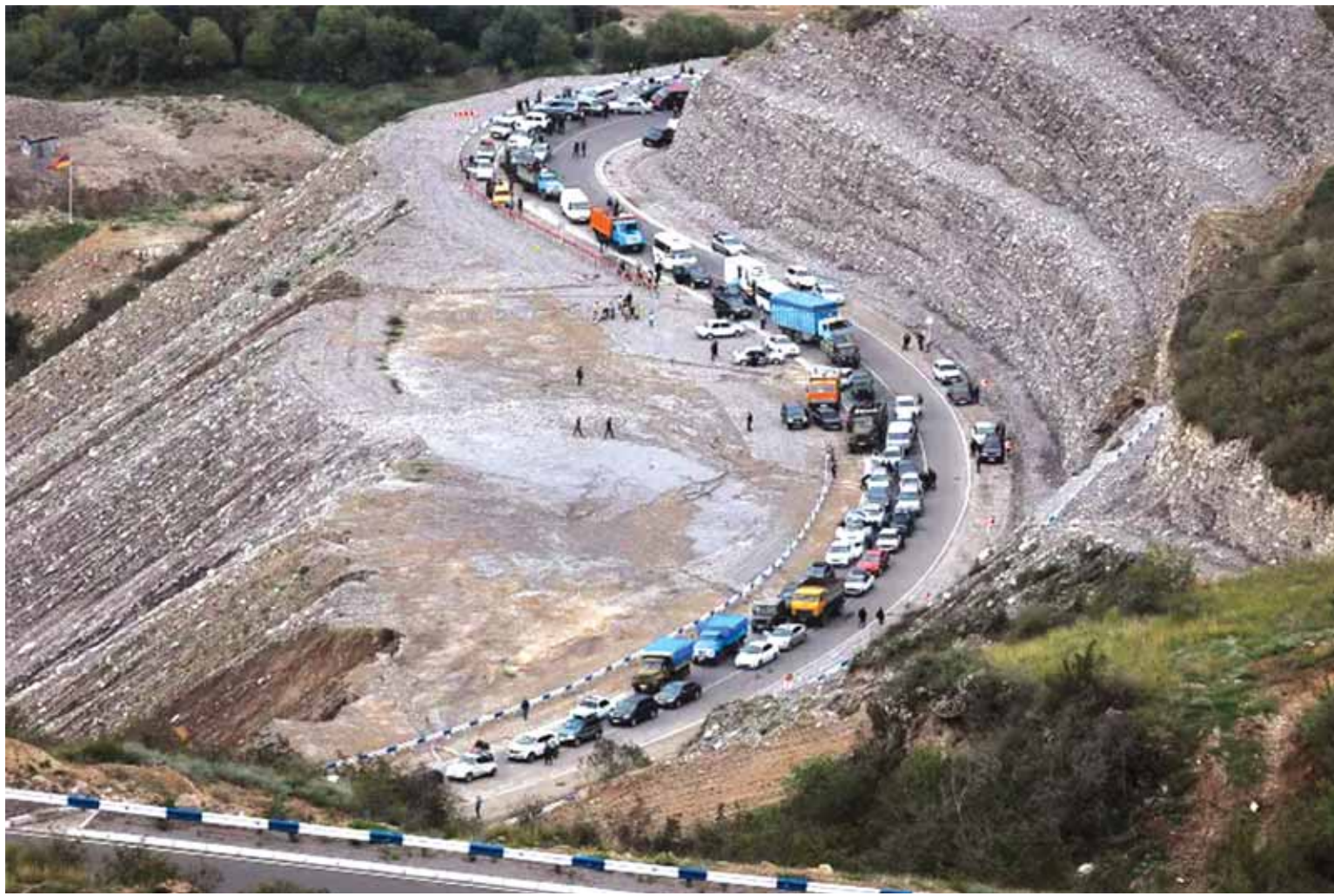
A convoy of cars of ethnic Armenians from Nagorno-Karabakh moves towards Komidzor in the Syunik region in Armenia

Meanwhile, the Nagorno-Karabakh oblast declared independence, leading to intense fighting between Armenia and Azerbaijan. By 1993, the Armenian security forces had occupied the region and also gained control over 20 per cent of the neighbouring Azerbaijani territory. In 1994, Boris Yeltsin, the first leader of the Russian Federation, successfully negotiated a peace deal known as the Bishkek Protocol between the two former Soviet Republics.