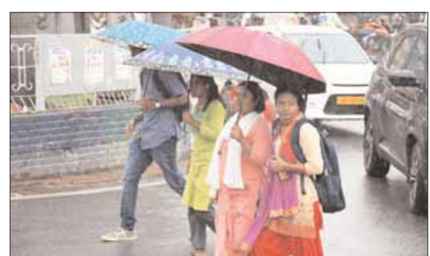
Girls walking taking umbrella in State Capital.

PNS : RANCHI While the Indian Meteorological Department (IMD) has announced the departure of monsoon season from the Country on Saturday, on the other hand it has issued an alert of heavy rain in Jharkhand, West Bengal and Odisha on Sunday. In the yellow alert issued till October 2, it has been said that there will be intermittent rain in many parts of Jharkhand including Ranchi till October 2. The IMD informed in its regular bulletin that it will continue to rain in the first week of October. The temperature is also likely to drop by four to five degrees. Meanwhile, there was heavy rain in many areas including the State Capital on Saturday evening. The Meteorological Department has issued an orange alert in Sahibganj, Dhanbad, Bokaro, East Singhbhum, West Singhbhum and Seraikela Kharsawan districts of Jharkhand. There is a possibility of heavy rain in these districts. There is a possibility of rain in Godda,