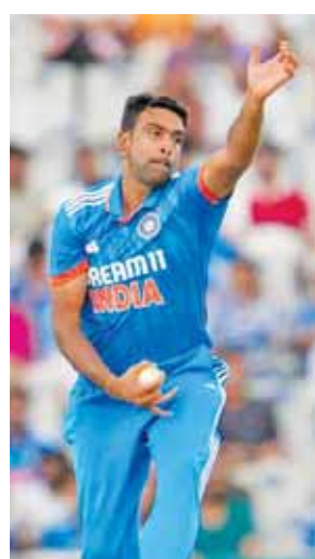
■ GUWAHATI

champions England here on Saturday, the 37-year-old Ashwin made the admission in a pre-match chat. "Being in a good space, enjoying this tournament will keep me in good stead. This could be my last World Cup for India, so enjoying the tournament is of utmost importance," Ashwin told Star Sports. "I would have said that you were joking. Life is full of surprises. Honestly, did not think I would be here. Circumstances have made sure I am here today, the team management have shown trust," said Ashwin while talking about his inclusion in the Indian squad. Ashwin has played 10 matches for India in World Cup history with his last appearance coming in 2015. He has bagged 17 wickets in the competition at an average of 24.88 and an economy of 4.36 with his best figures being 4/25. Apart from Virat Kohli, Ashwin is the only member of the current Indian side who were also a part of their World Cup winning campaign in 2011. Ashwin said dealing with pressure would be crucial. "All you can do is turn the ball both ways, and I think I can do it. Dealing with pressure is paramount in these tournaments, and it will dictate how the tournament goes," he said.