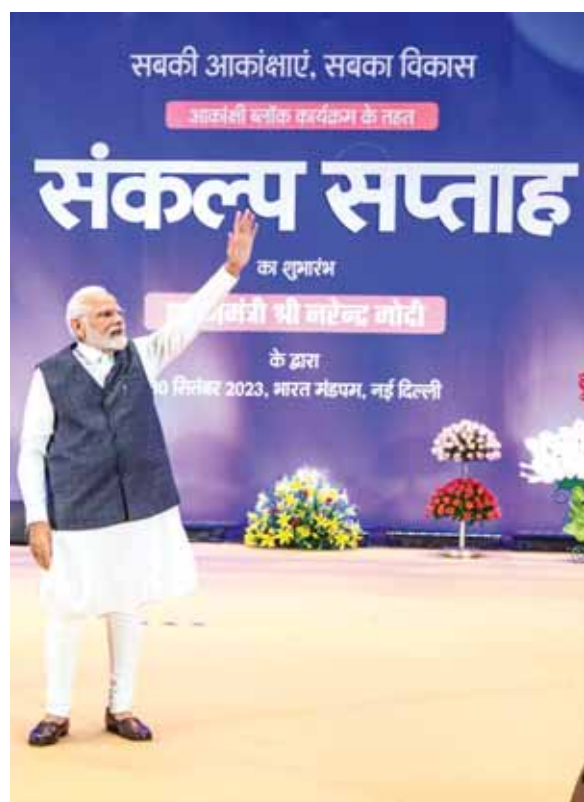
Prime Minister Narendra Modi during the launch of a week-long programme for Aspirational Blocks titled 'Sankalp Saptah' at Bharat Mandapam in New Delhi on Saturday

"We don't need to learn from other people what freedom of speech is about. But we can tell people this. We don't think freedom of speech extends to incitement, to violence. That to us is a misuse of freedom," he emphasised.