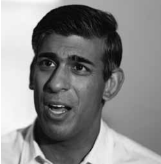
Rishi Sunak, Prime Minister of the United Kingdom, is seen during a press conference in London.

"It's about being Conservative and ensuring that the public keep more of the money that they earn,