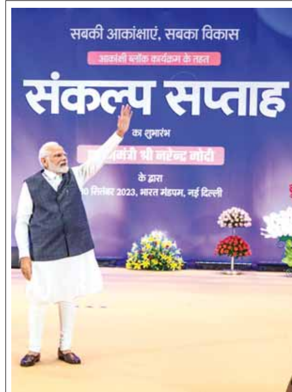
Prime Minister Narendra Modi during the launch of a week-long programme for Aspirational Blocks titled 'Sankalp Saptah' at Bharat Mandapam in New Delhi on Saturday

The Indian mission added that the discussions with Scottish leaders ranged from India-Scotland cooperation in sectors across fintech, sustainable agriculture, tourism and water conservation. A visit to the Scottish Parliament, a lecture entitled 'India@75' at the University of Edinburgh, an interaction at the University of Strathclyde and a breakfast meeting with leading business chiefs on topics ranging from whisky, aviation, energy, agriculture, green economy, space and investments were part of the packed two-day schedule to the region.