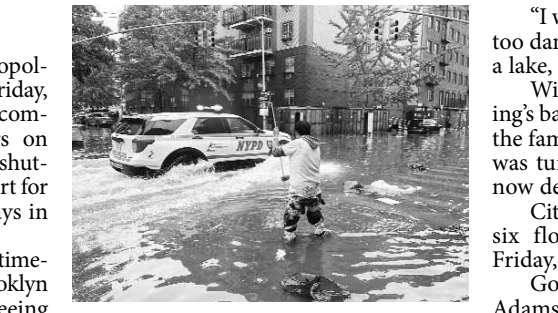
Flooding is seen in Manhattan as heavy rain falls on the New York City area Friday.

More than 7.25 inches (18.41 centimetres) of rain had fallen in parts of Brooklyn by nightfall, with at least one spot seeing 2.5 inches (6 centimetres) in a single hour, according to weather and city officials. The 8.65 inches (21.97 centimetres) at John F. Kennedy Airport surpassed its record for any September day, a bar set during Hurricane Donna in 1960, the National Weather Service said. And more downpours were expected. The deluge came two years after the remnants of Hurricane Ida dumped