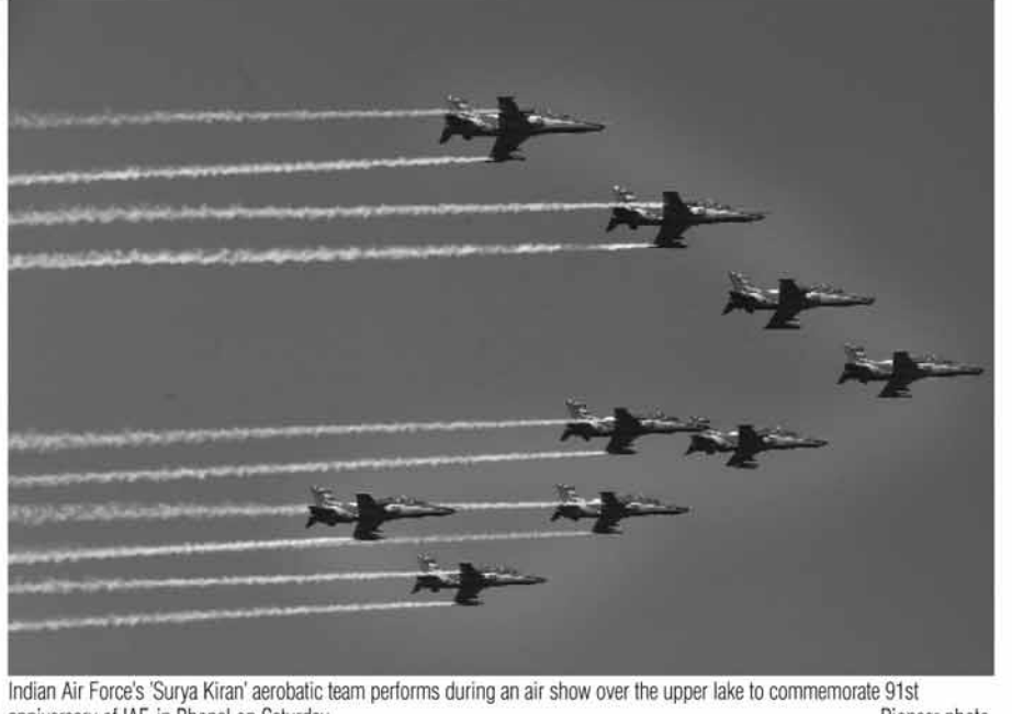
Indian Air Force's 'Surya Kiran' aerobatic team performs during an air show over the upper lake to commemorate 91st anniversary of IAF, in Bhopal on Saturday. Pioneer photo

that the number of wild animals is continuously increasing. This is an indicator of a healthy eco-system. Chouhan said that this earth belongs to animals, birds, creatures and trees as much as it belongs to humans. The same consciousness resides in all of us. If we want to save the earth for the future generations, then we all will have to make combine efforts day and night with the government to conserve and enhance its bio-diversity and natural wealth. Only the active co-operation of the society and the public can make it a mass movement. With this in mind, Wildlife Week is celebrated every year from 1 to 7 October to increase awareness among the general public about the conservation of wild animals and we reiterate our pledge towards the conservation of forests and wild animals. Chouhan said that various public awareness programmes are being organised across the state on Wildlife Week. During this period, various programmes will provide an opportunity to students and the general public to understand nature and natural processes and also enhance their sense of wildlife conservation.