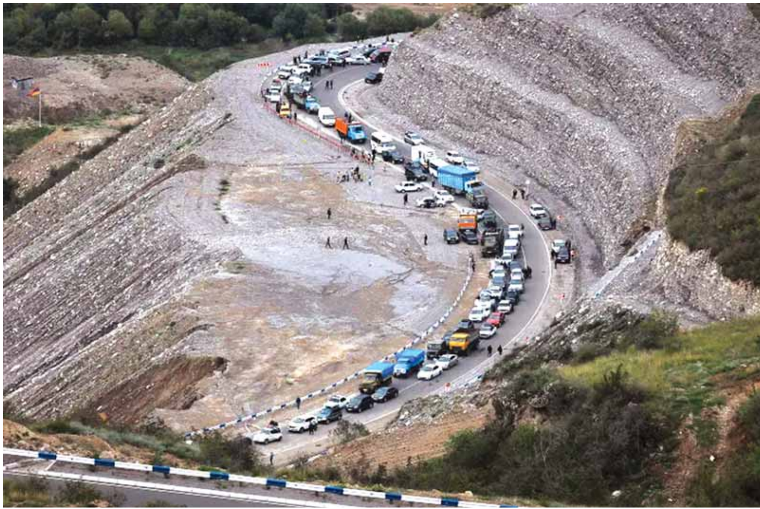
A convoy of cars of ethnic Armenians from Nagorno-Karabakh moves towards Komridzor in the Syunik region in Armenia

Meanwhile, the Nagorno-Karabakh oblast declared independence, leading to intense fighting between Armenia and Azerbaijan. By 1993, the Armenian security forces had occupied the region and also gained control over 20 per cent of the neighbouring Azerbaijani territory. In 1994, Boris Yeltsin, the first leader of the Russian Federation, successfully negotiated a peace deal known as the Bishkek Protocol between the two former Soviet Republics.