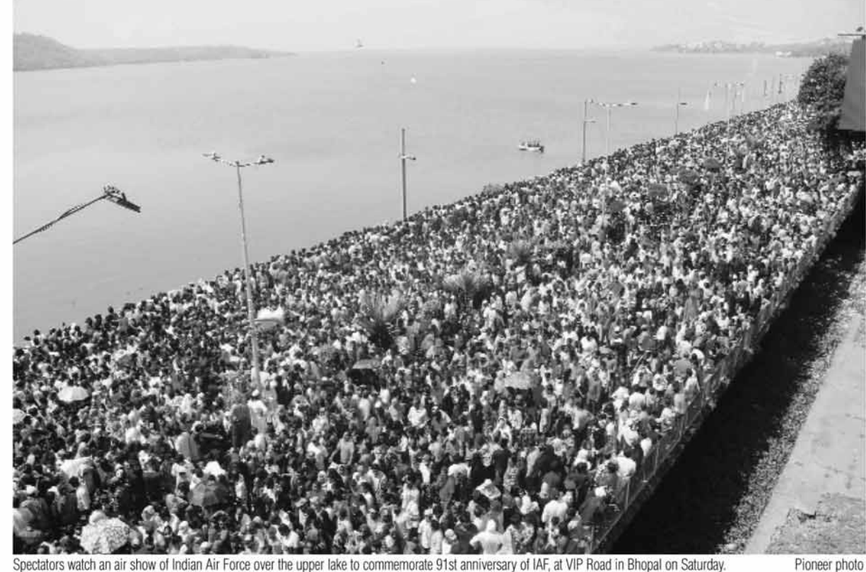
Spectators watch an air show of Indian Air Force over the upper lake to commemorate 91st anniversary of IAF, at VIP Road in Bhopal on Saturday.