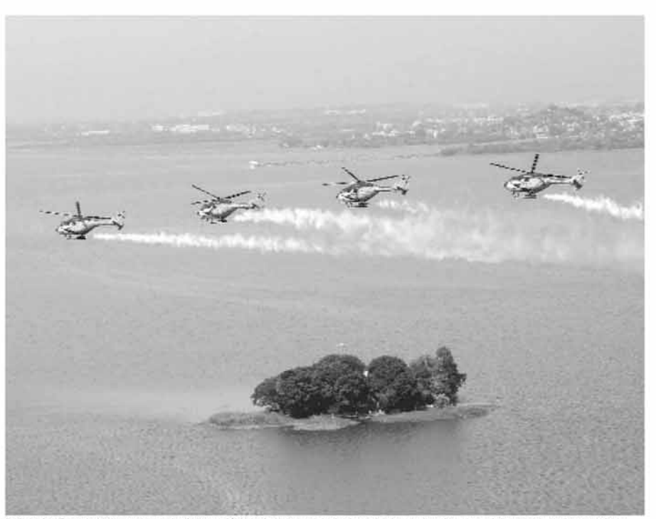
Indian Air Force's helicopter aerobatic team 'Sarang' performs during an air show over the upper lake to commemorate 91st anniversary of IAF, in Bhopal on Saturday.