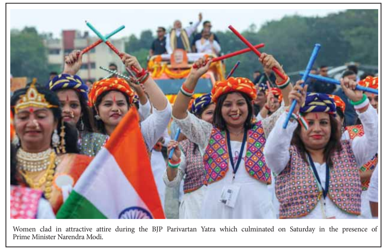
Women clad in attractive attire during the BJP Parivartan Yatra which culminated on Saturday in the presence of Prime Minister Narendra Modi.

forest lease holders have been registered in the paddy procurement portal.